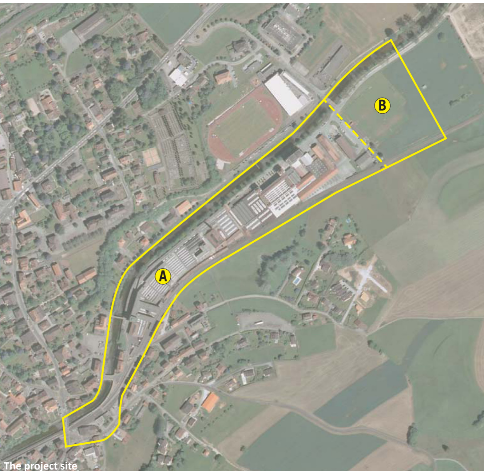
The project site

SITE DEFINITION The Val-de-Travers spreads over some 20 kilometers and is located to the west of the Neuchâtel Canton, partially bordering the Vaud Canton. The valley follows the Areuse River, an important component of the Region identity. During the past centuries, the nine separate old villages expanded to form now an urban back bone called the Val de Travers Town. The valley currently inhabited by 12,000 people, was always an important communication route between Switzerland and France in the past. It experienced a significant growth starting at the beginning of the 19th Century, based on industrial activity (clock making, mechanical industry, machinery and textile in particular). This industrial past left its mark on the identity of a region that remains open to the world and to technological innovation. In the town of Couvet, the streets run parallel to the Main Street and perpendicular streets link the various blocks. At first, the northern sector was used to build small apartment buildings, (3 story high above a ground floor containing the main entrance) and small single family houses that are simple and functional. At the same time, larger homes were built at the eastern entrance of the village.