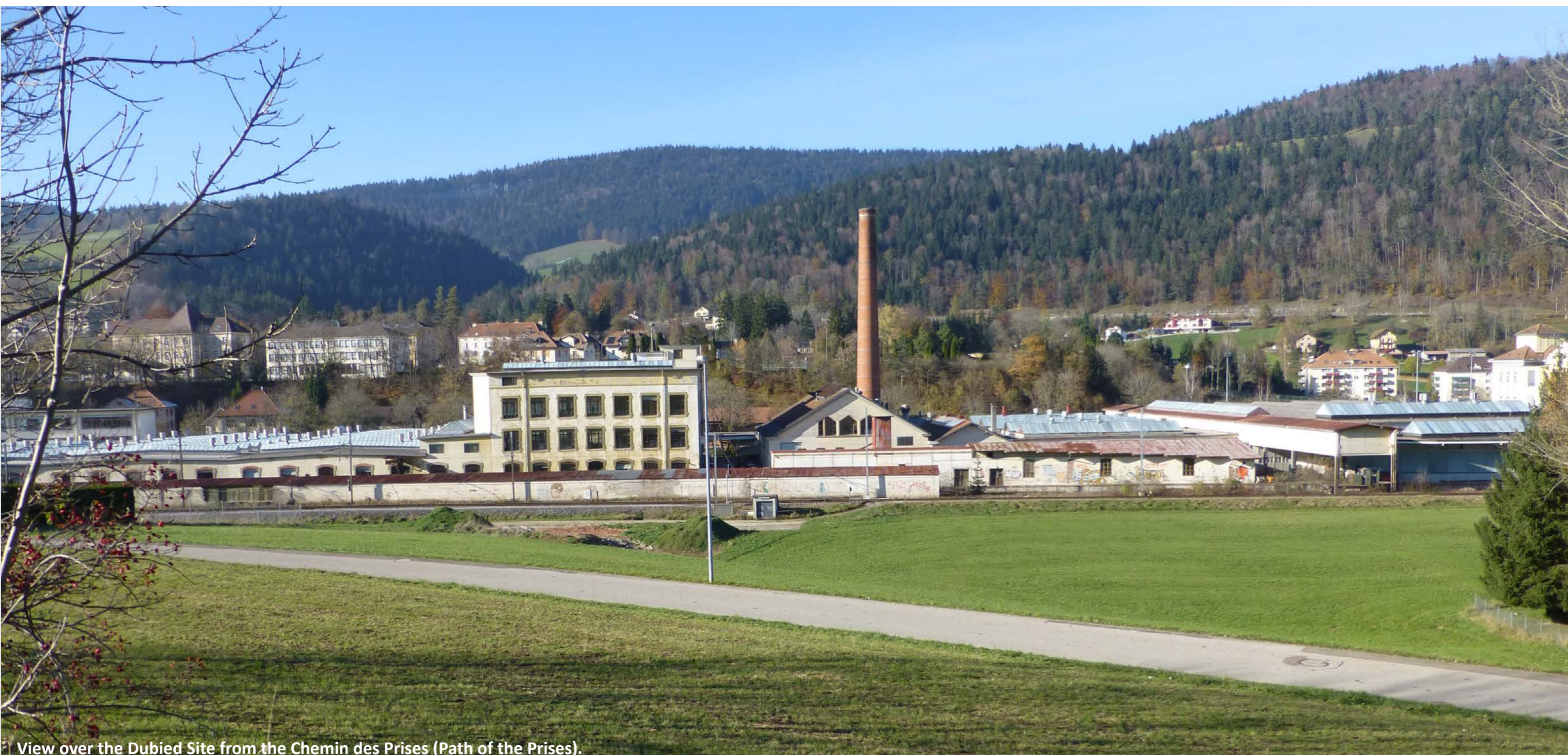
View over the Dubied Site from the Chemin des Prises (Path of the Prises).

CATEGORY Industrial / landscape / architecture