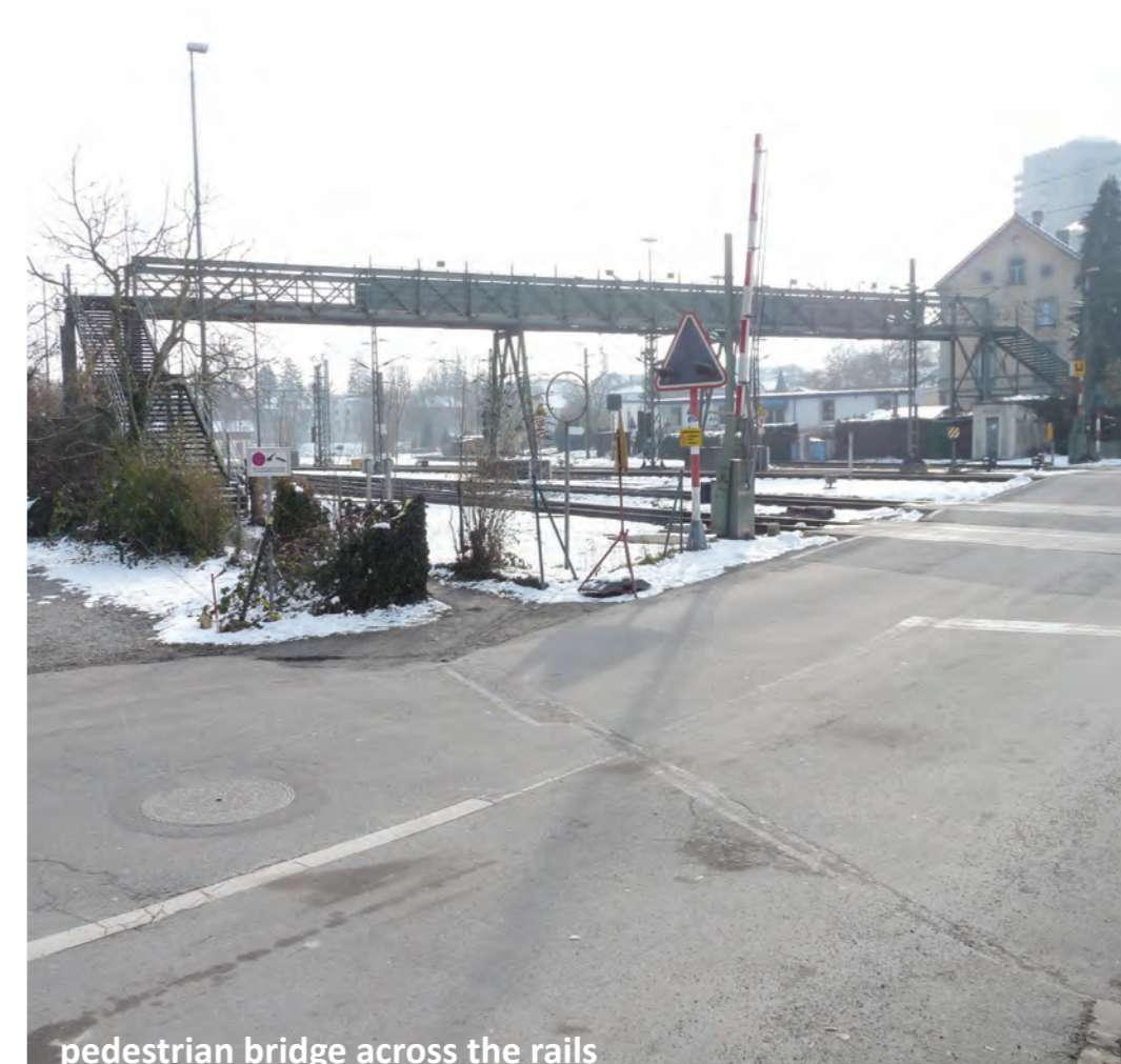
pedestrian bridge across the rails