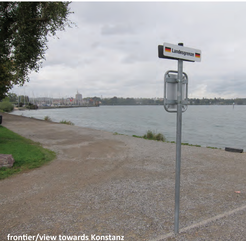
frontier/view towards Konstanz