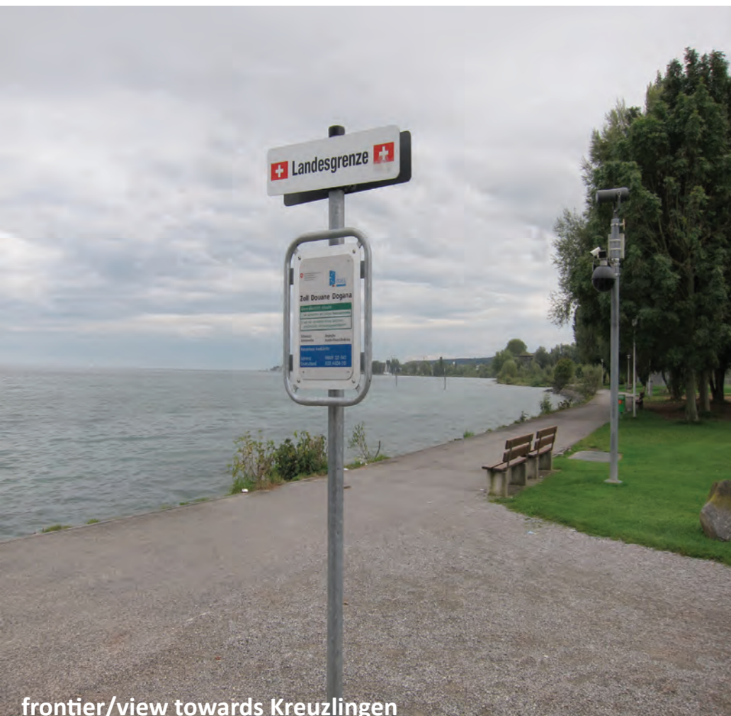
frontier/view towards Kreuzlingen