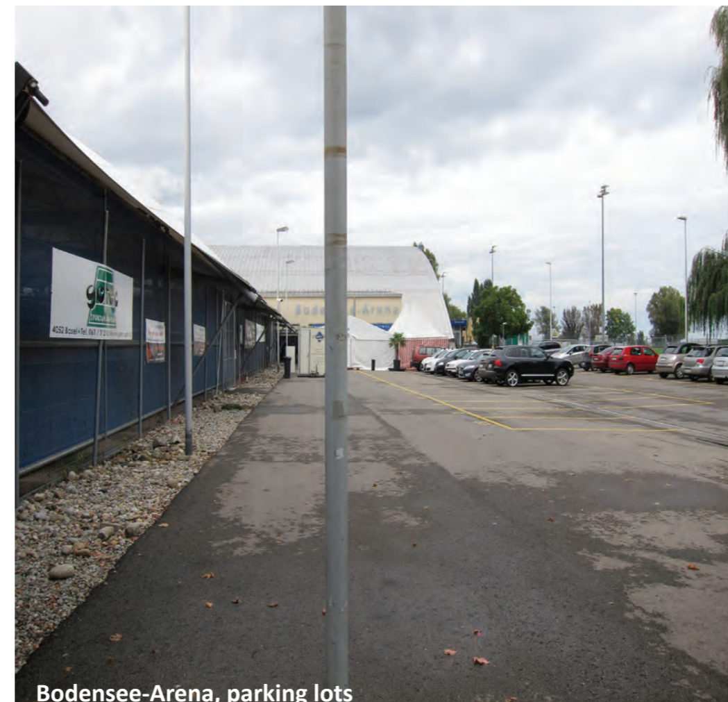
Bodensee-Arena, parking lots