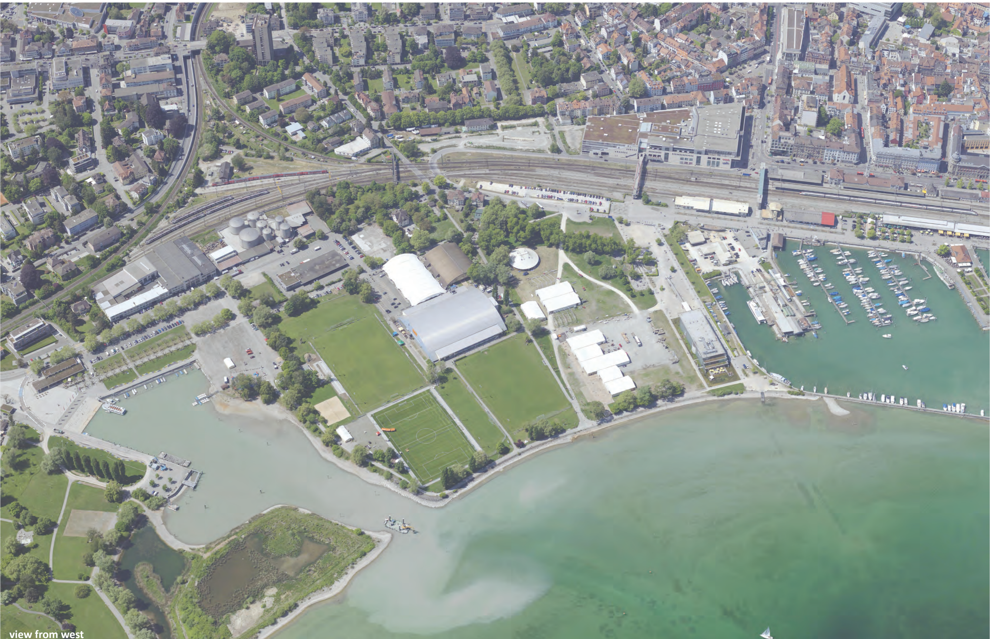
view from west