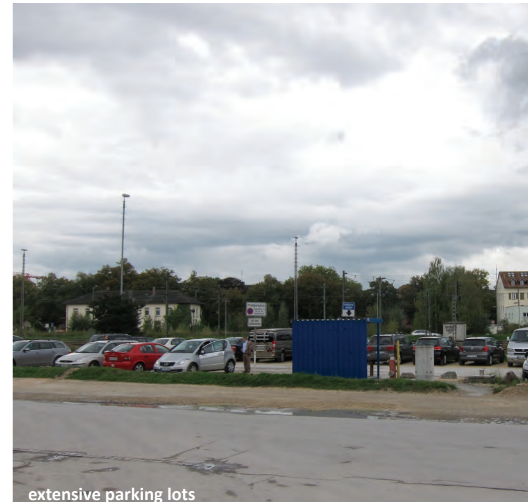
extensive parking lots