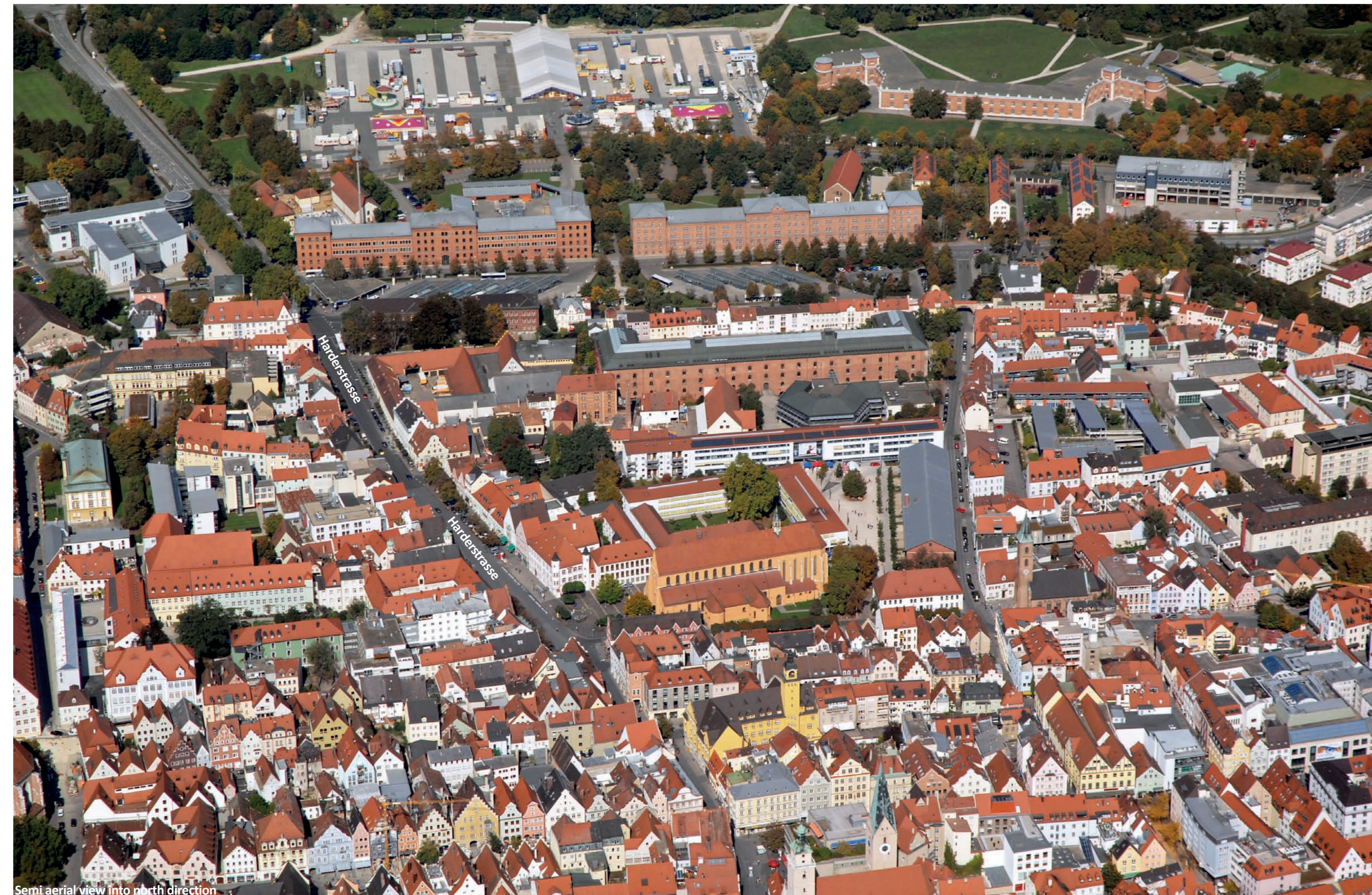
Semi aerial view into north direction