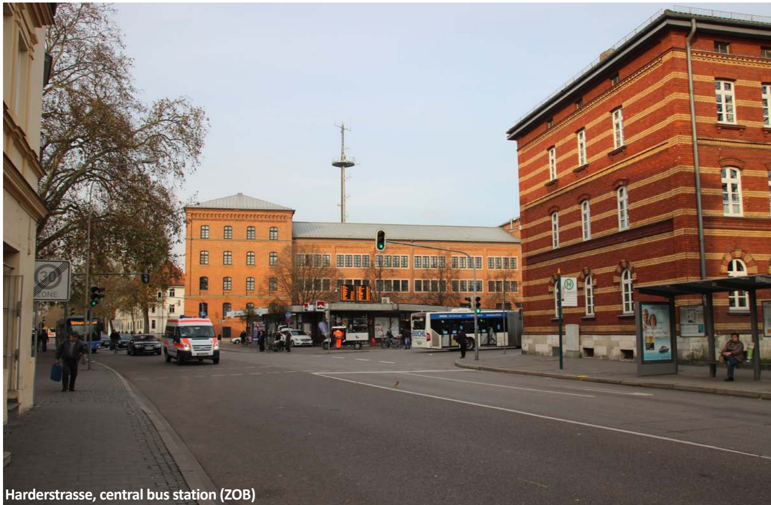
Harderstrasse, central bus station (ZOB)