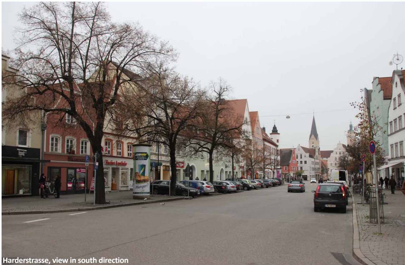
Harderstrasse, view in south direction