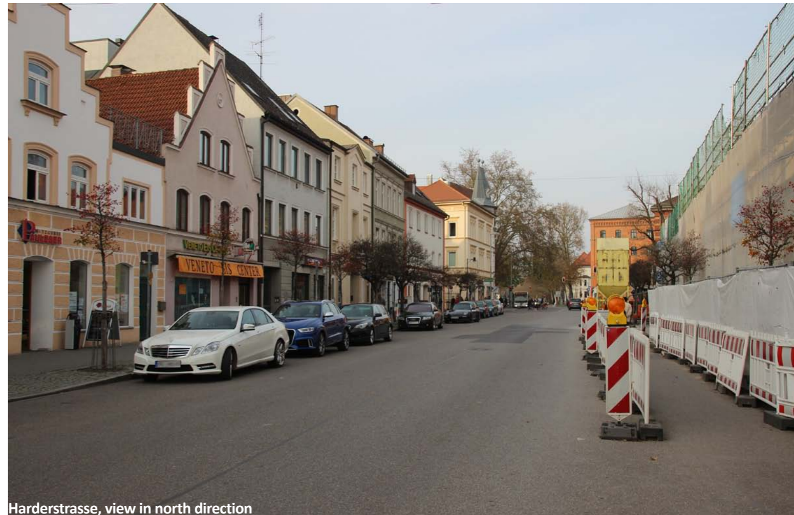
Harderstrasse, view in north direction