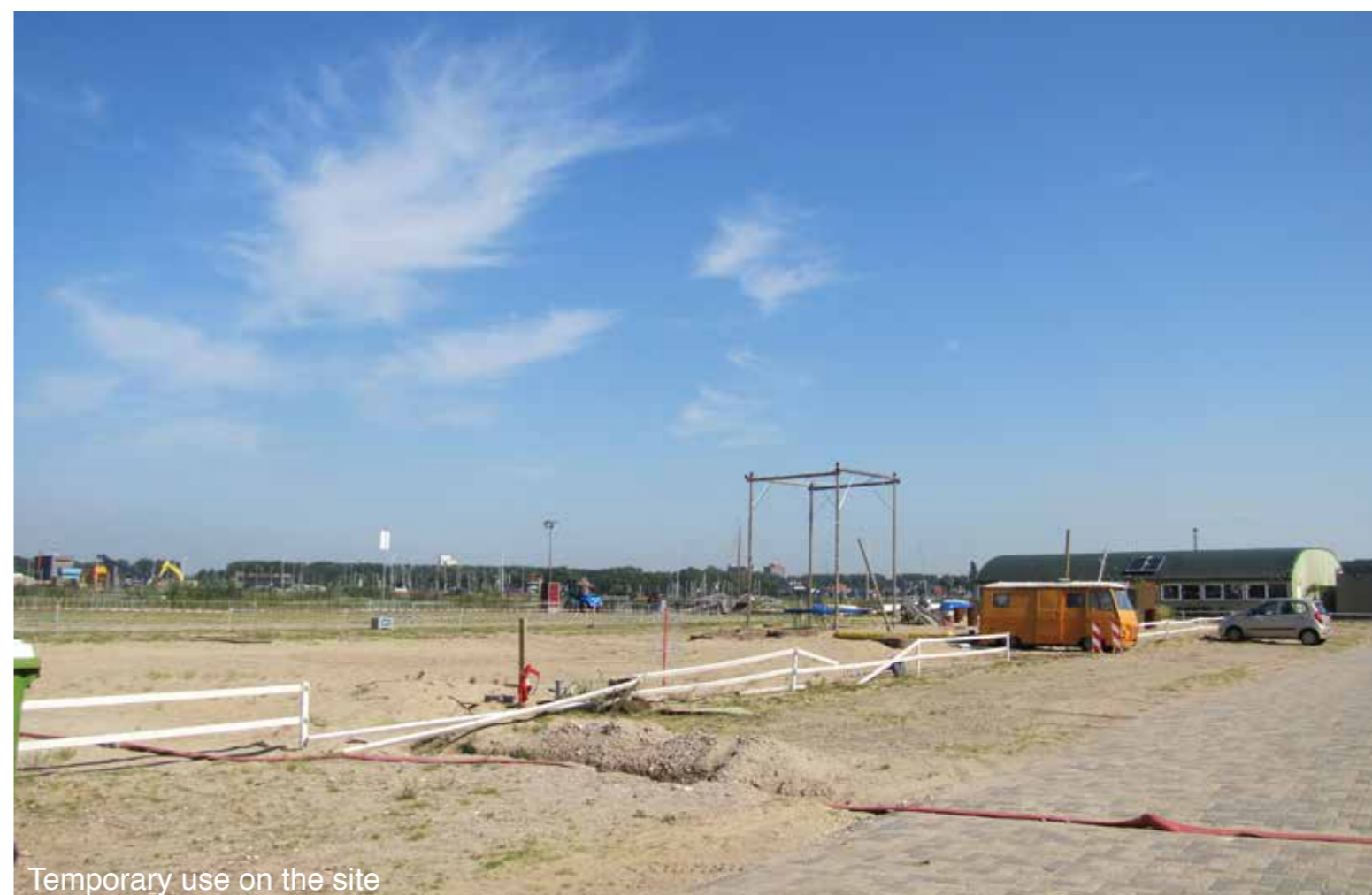
Temporary use on the site