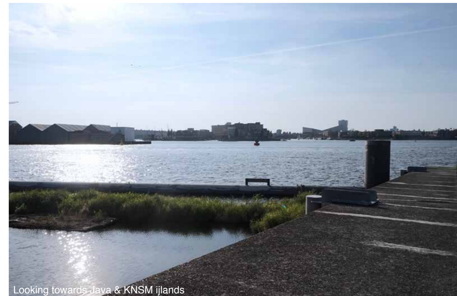
Looking towards Java & KNSM ijlands