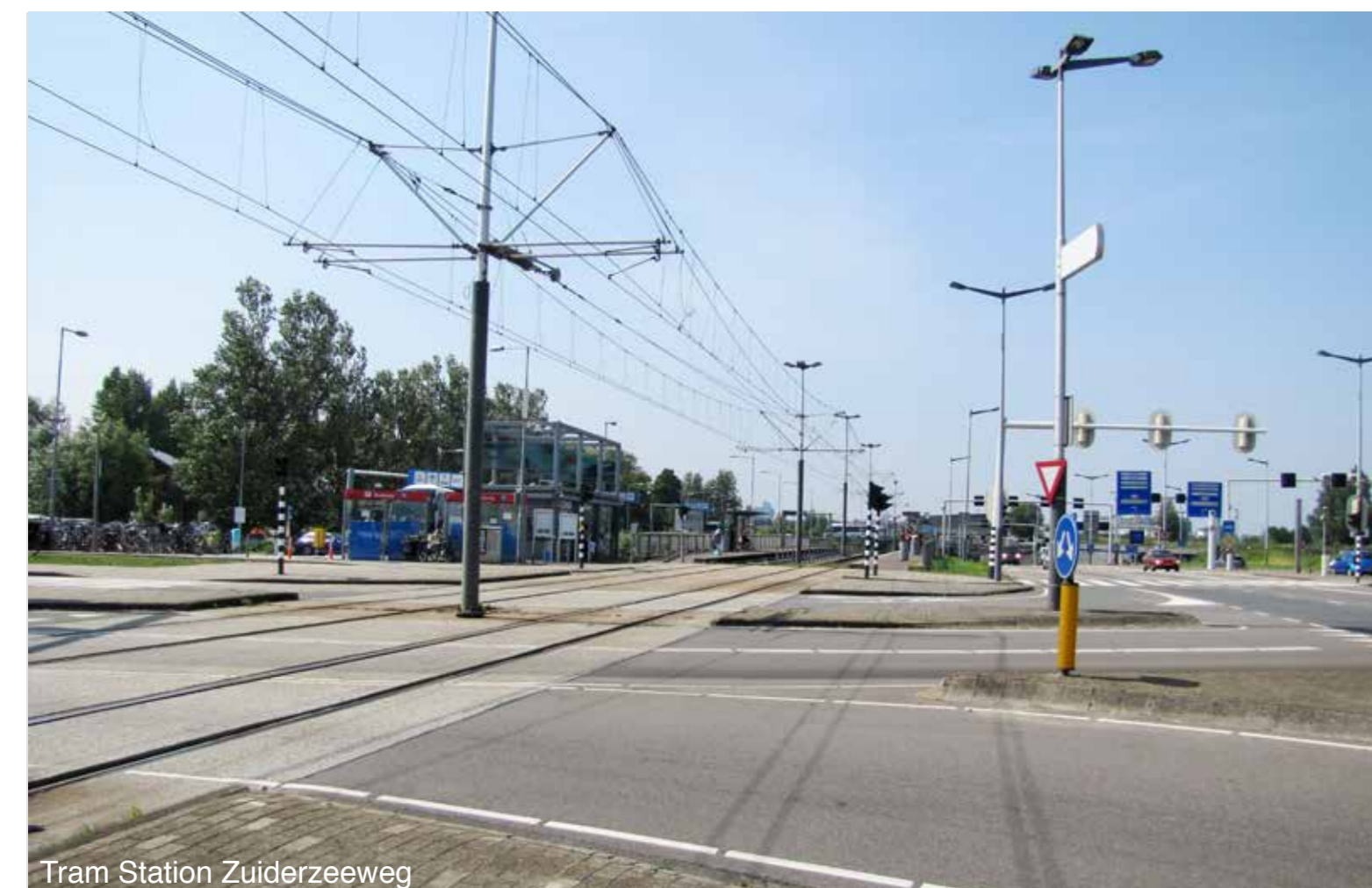
Tram Station Zuiderzeeweg