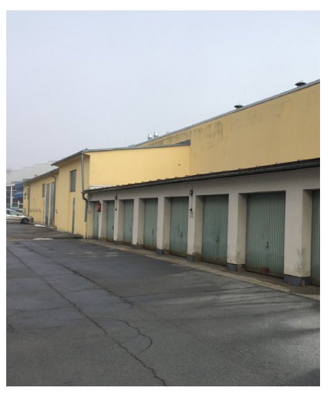
Found elements that inspired the project.