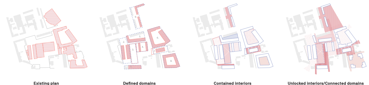
A fenced-off amorphic urban fabric

A new pedestrian bridge connects the train platforms and links the north and the south side of the city, allowing for direct access from the train towards the new network of interconnected domains - the main pedestrian spine of the project site. In that way the domains reach out, not only towards the train station, but also towards the south of the city.