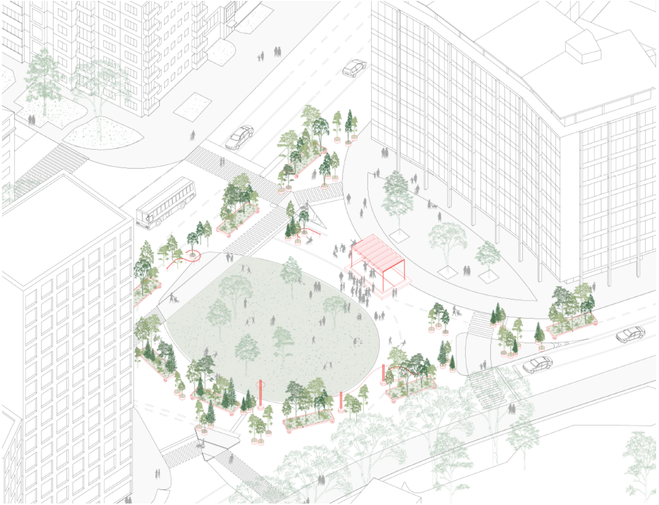
Figure 4 The place des Charmilles is transformed into a vibrant urban space including pockets of shade and greenery and a central stage for events, play and encounter.

These scenarios show how the modular system of La Parade du Vivant can adapt to various urban conditions — reclaiming space for people and non-human life, one site at a time.