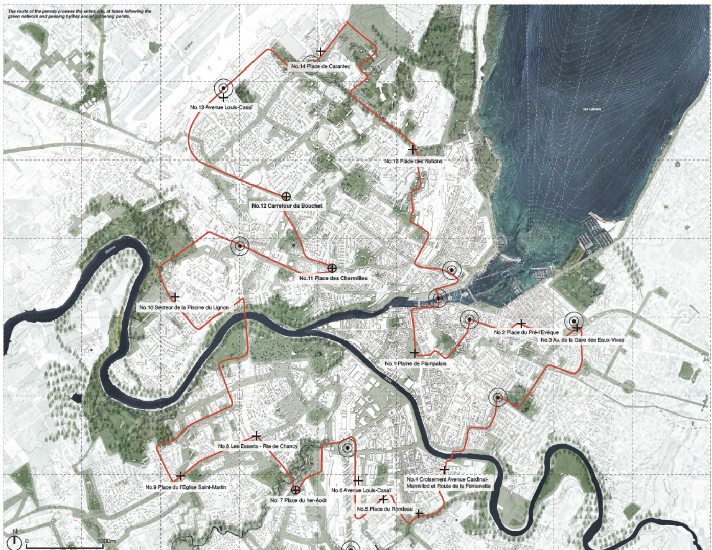
Figure 1 The parade route crosses the entire city, linking key mobility nodes and segments of the urban green network

Rooted in the long tradition of civic parades that shape urban identity and collective memory, the Parade places non-human life at its symbolic and physical center. The plants, animals, and ecosystems that quietly inhabit Geneva are now brought into view — proudly paraded through the streets. These mobile interventions reveal the transformative power of vegetation and the latent potential of public space to become more alive, more inclusive, and more climate-adaptive. Each trailer becomes a miniature ecosystem, offering shelter, nourishment, and water to birds, insects, and other urban fauna — while inviting residents to rest, play, and gather.