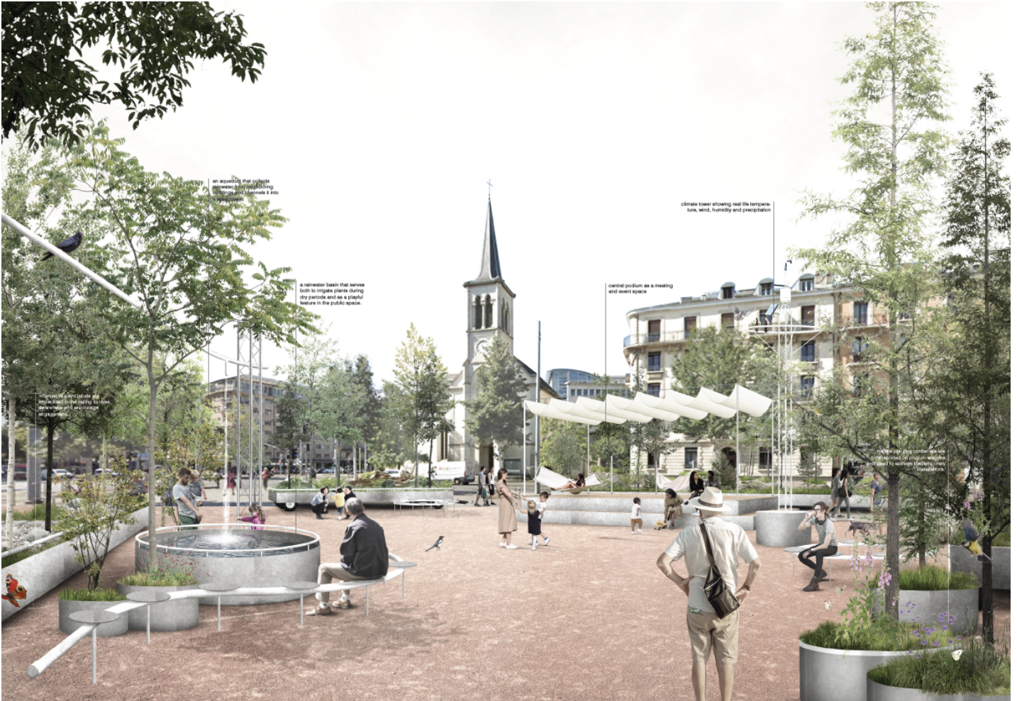
Figure 3 Installation of the parade at Plaine de Plainpalais. The parade unfolds in a vibrant urban oasis with plant containers, urban furniture etc.

The hyper-mobile nature of the installation allows it to reach 15 locations over the summer season. Each Friday afternoon, the parade departs for a new site — a performative journey that invites citizens to walk, cycle, or observe along the route. These weekly movements become moments of civic imagination, tracing a path that connects green corridors, neighborhood centers, and dense urban intersections. The journey begins and ends at Plaine de Plainpalais , where the full fleet of trailers gathers in a festive opening and closing event. Citizens can follow the parade's itinerary online, encounter it in their daily routes, or join the program at any point.