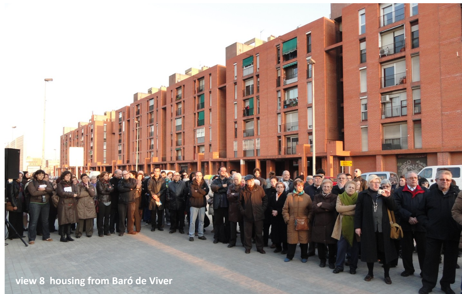
view 8 housing from Baró de Viver