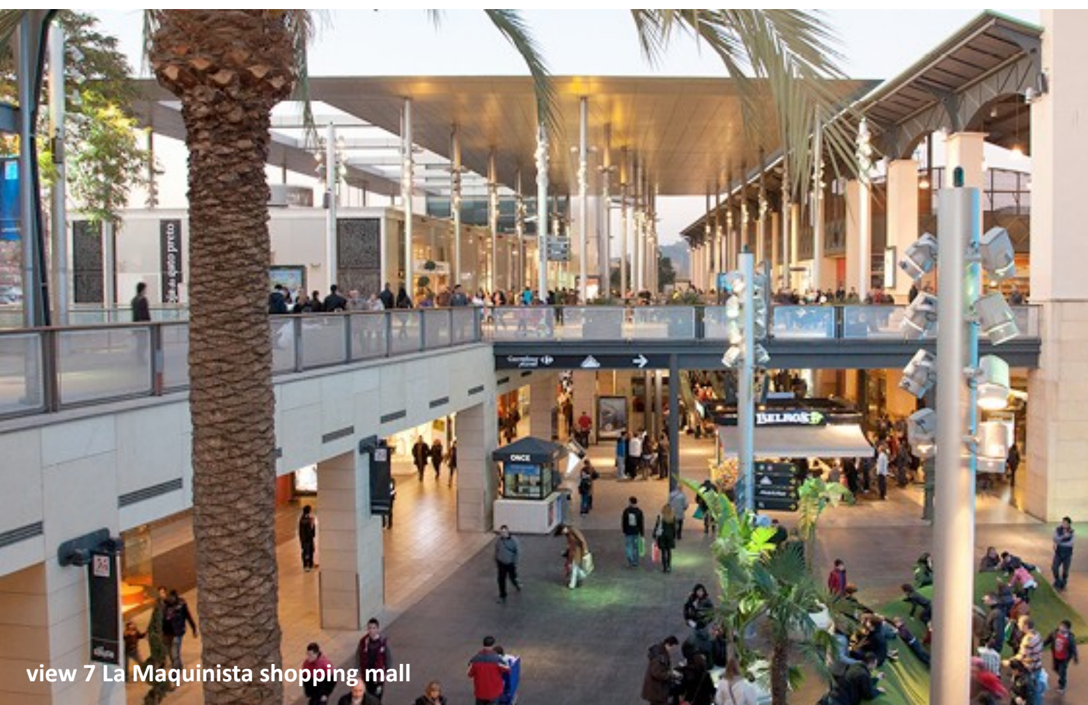
view 7 La Maquinista shopping mall