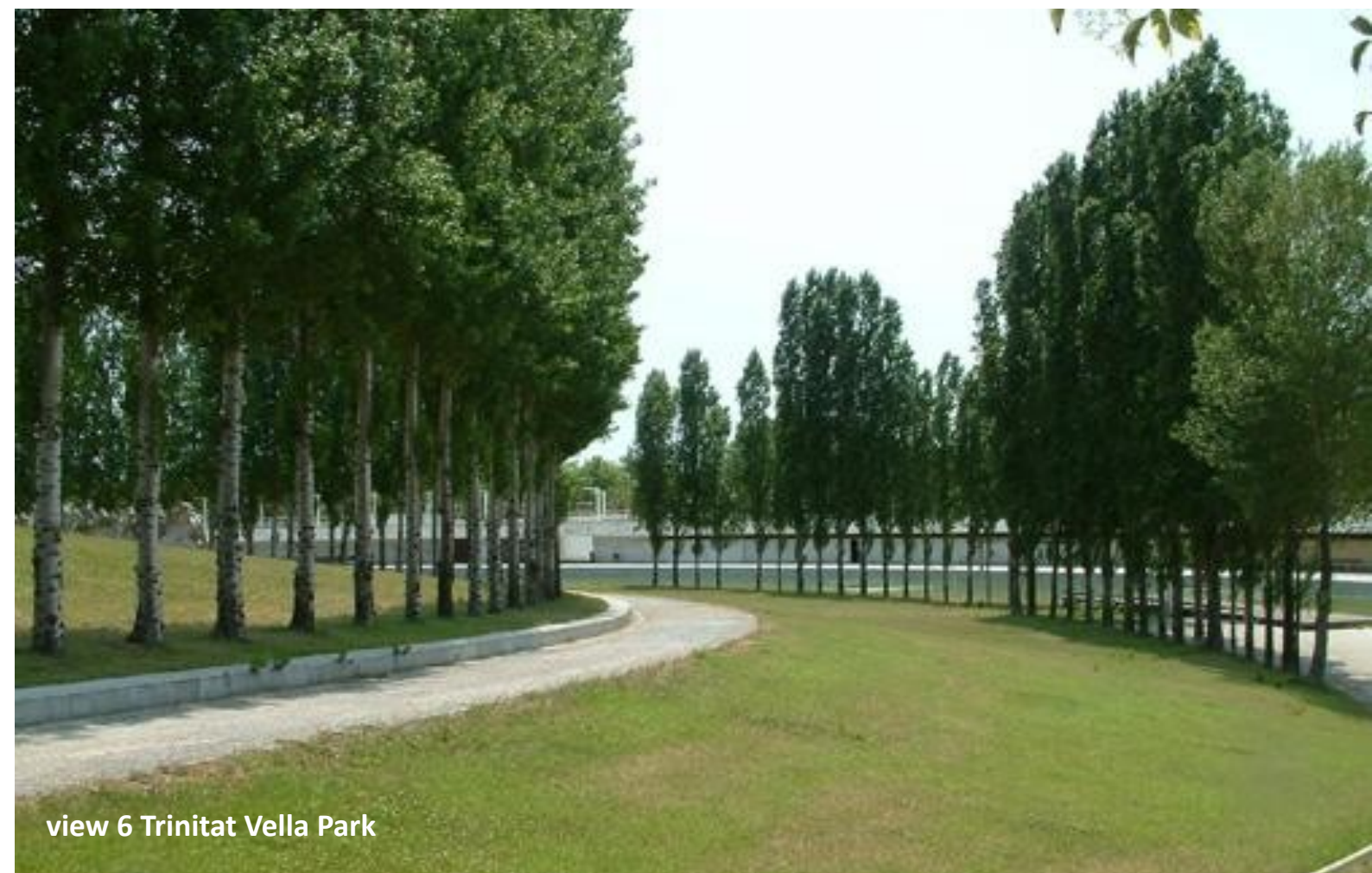
view 6 Trinitat Vella Park