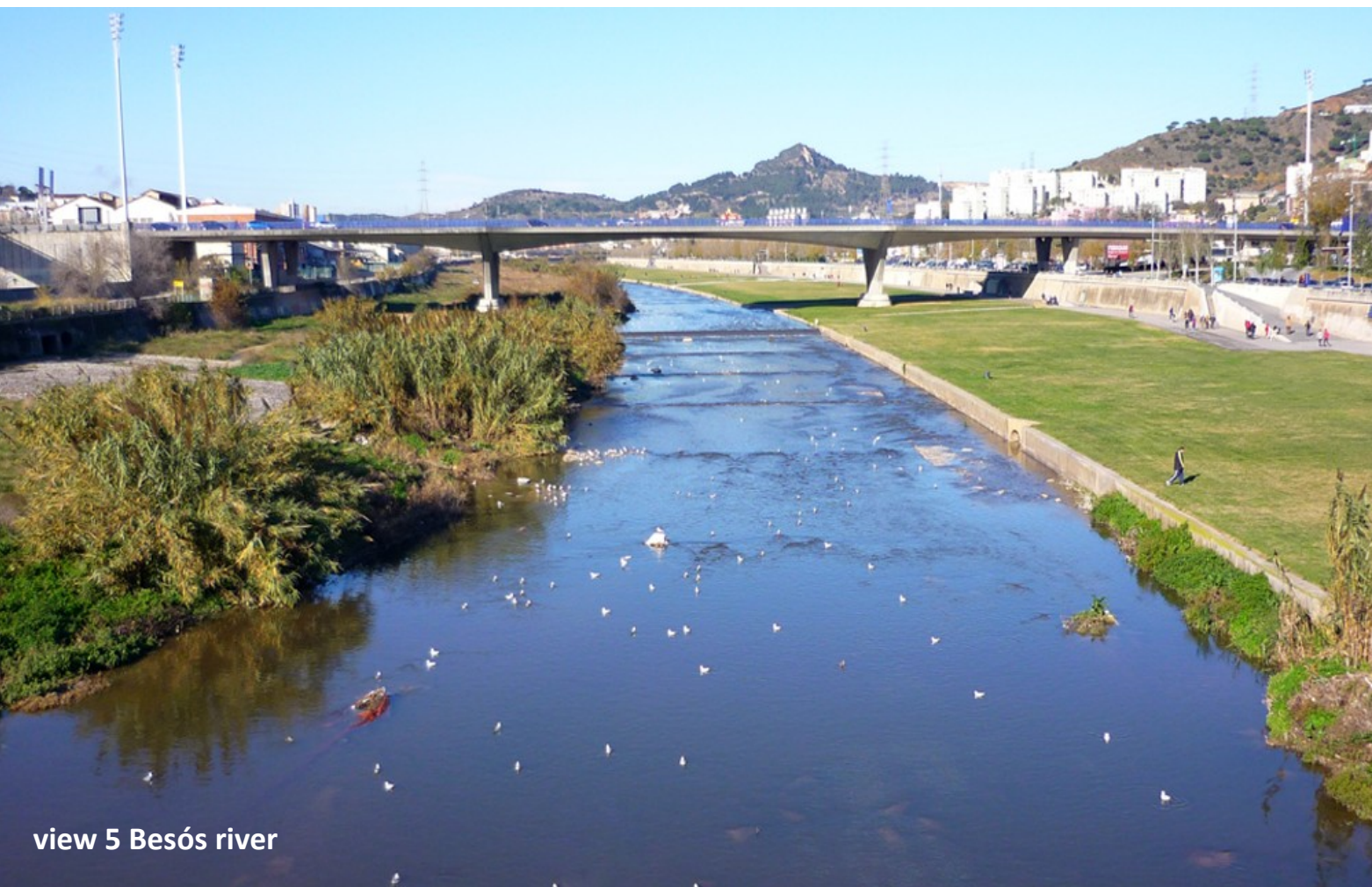
view 5 Besós river