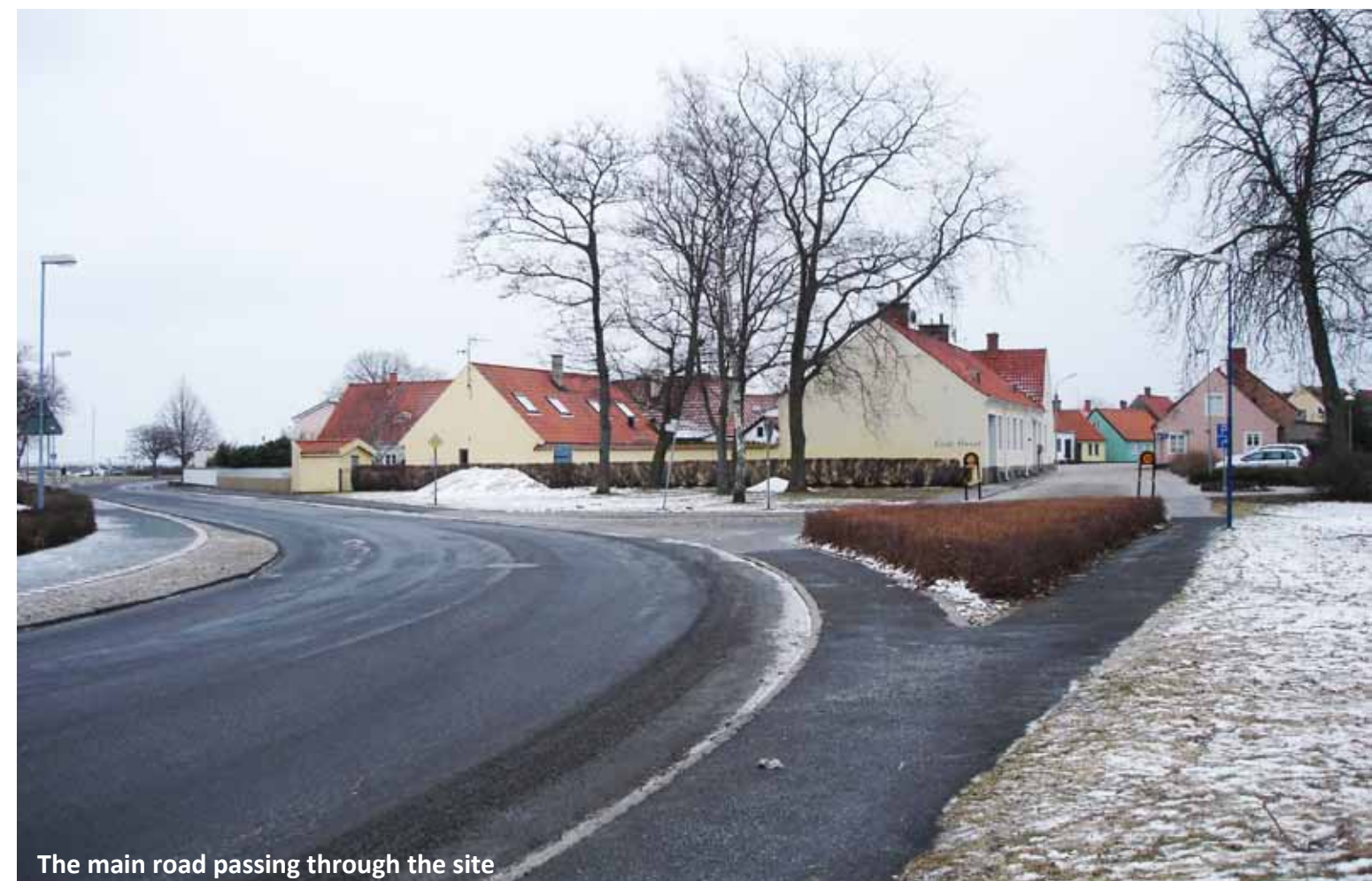
The main road passing through the site