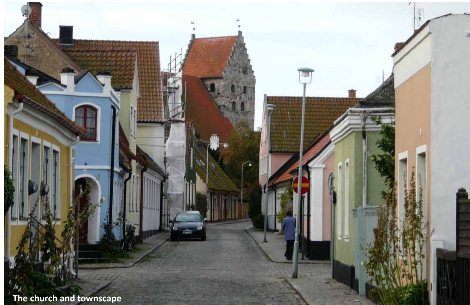
The church and townscape