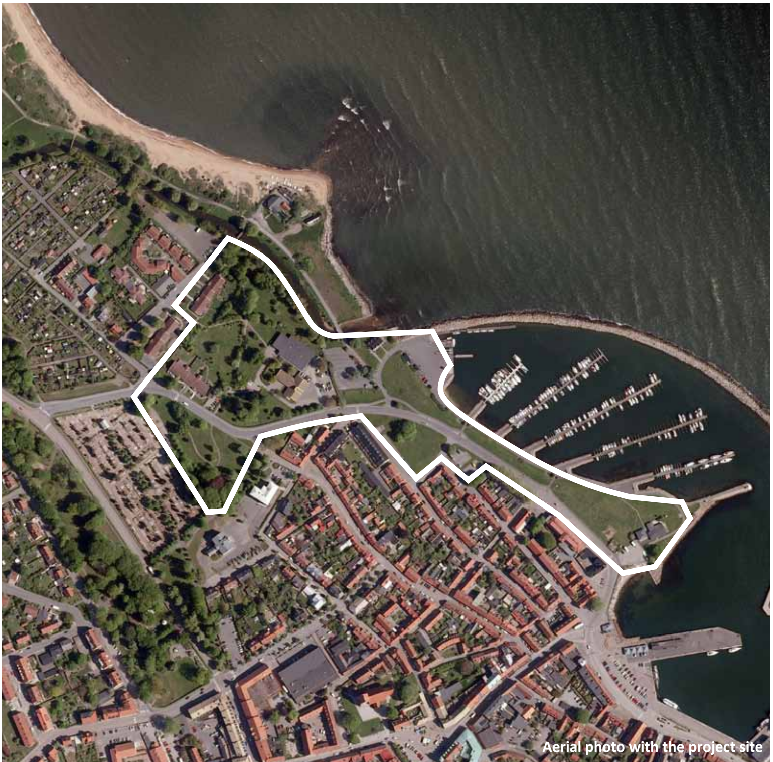
Aerial photo with the project site

The site has clearly defined borders. The Baltic Sea to the east is the starting point of the settlement and provides the town with a small-scale harbour. By the shoreline is a continuous recreational zone. The south-eastern part of the site is bordering the old town structure. The areas west and north of the site consist mostly of single-family houses and allotment gardens. There are two larger public buildings within the strategic site, just south of the main project area, that needs to be preserved. All buildings within the project site may be demolished with the exception of the beach pavilion in the south east part of the project site.