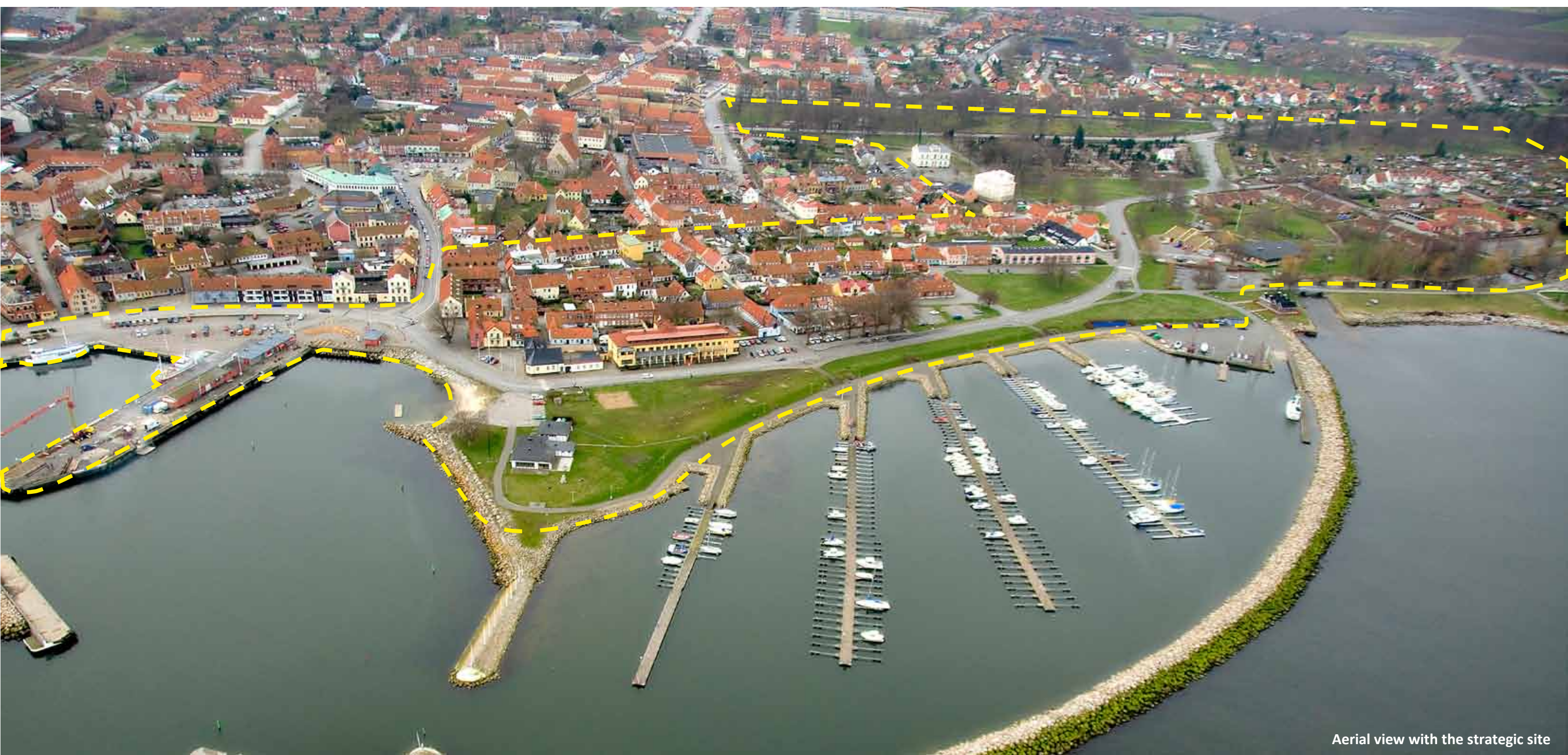
Aerial view with the strategic site

LOCATION Kvarteret Lasarettet, Simrishamn POPULATION city 6 500, municipality 19 400 STRATEGIC SITE 7 ha PROJECT SITE 2,5 ha SITE PROPOSED BY the municipality of Simrishamn OWNER OF THE SITE the municipality of Simrishamn