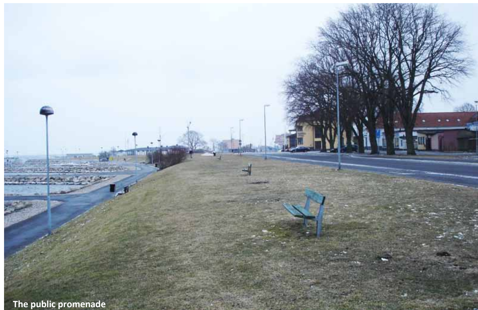
The public promenade