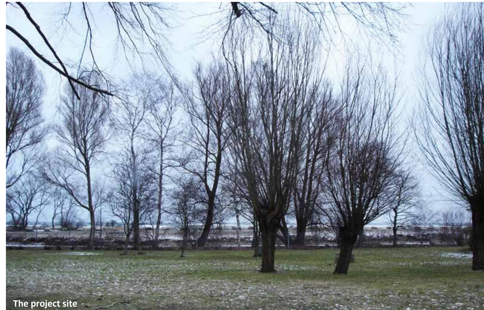
The project site