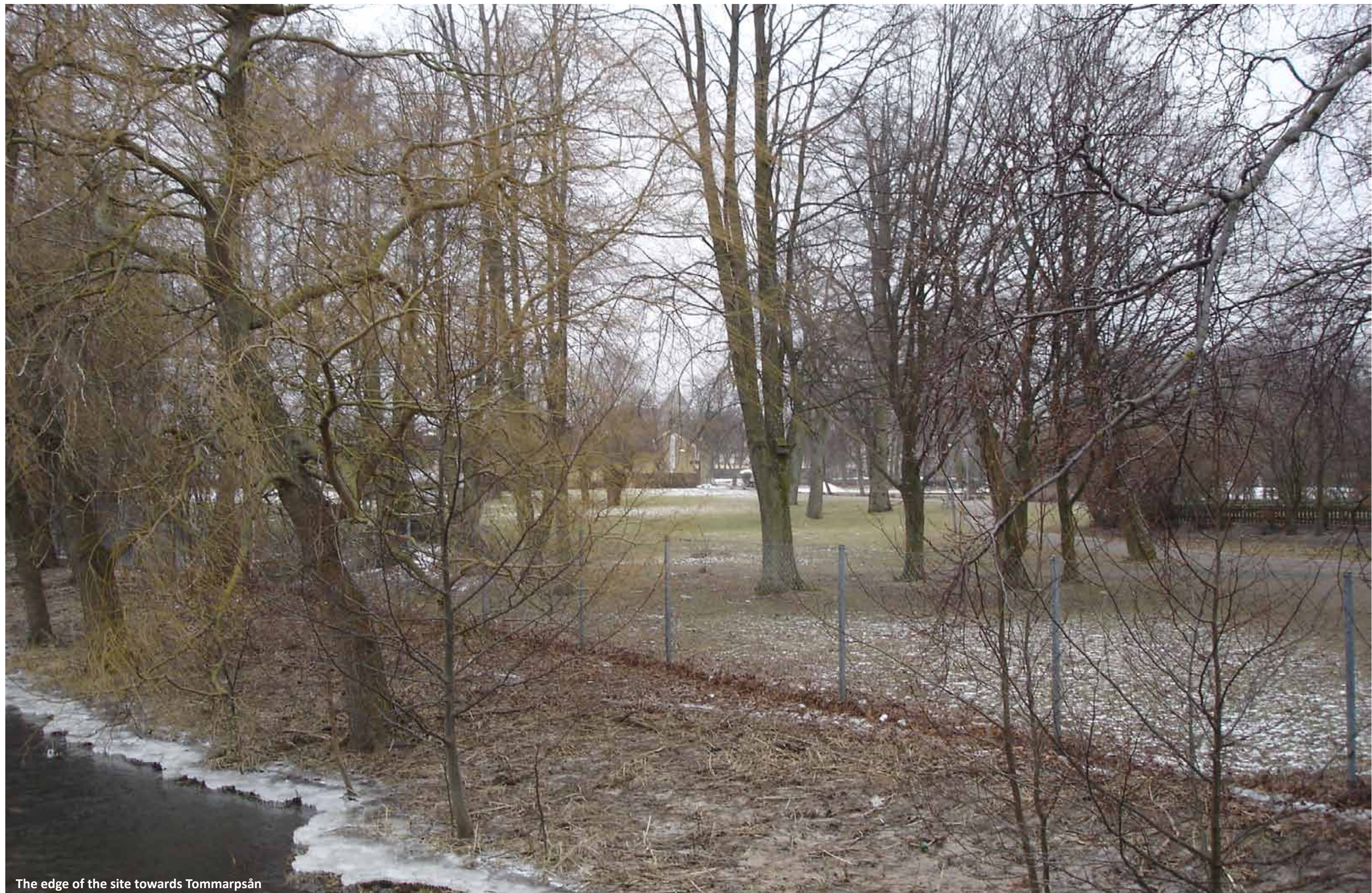
The edge of the site towards Tommarpsån