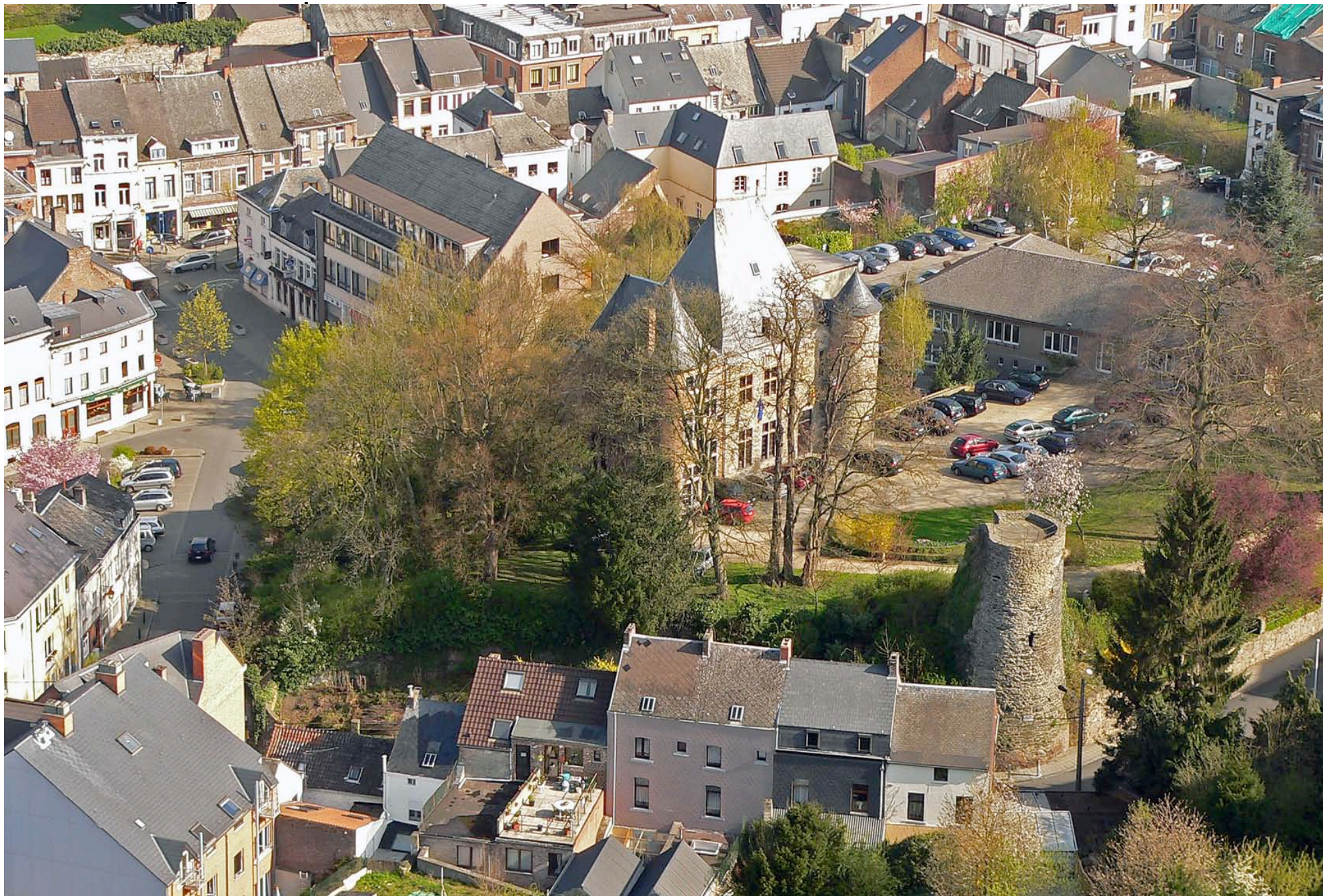
Gembloux – Belgium – european 10