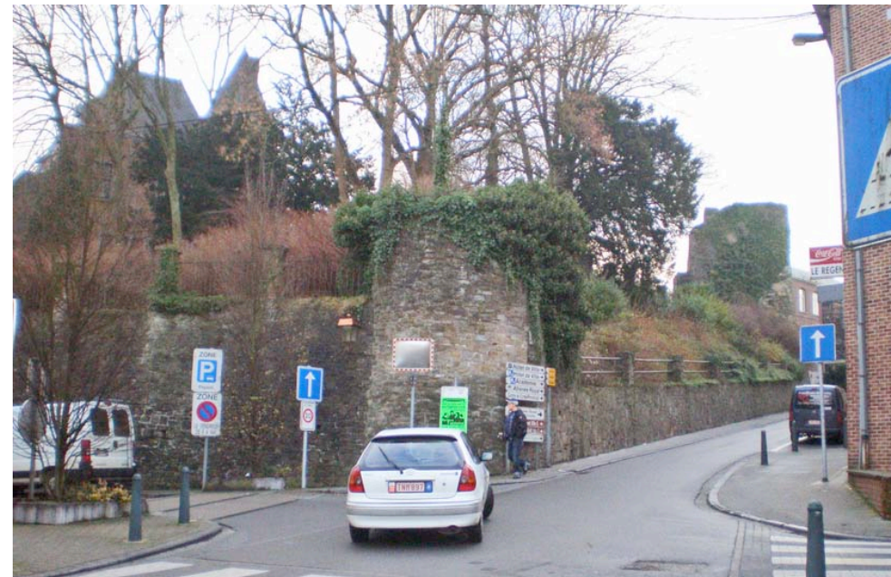
Rue du Chien Noir