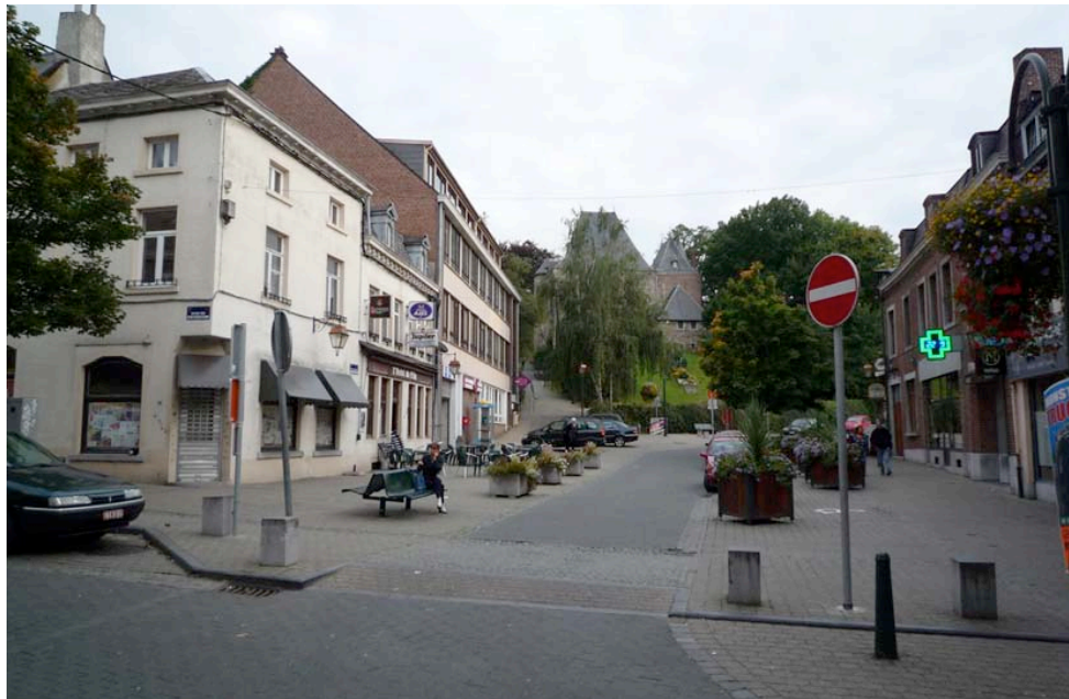
Place de l'Hôtel de ville