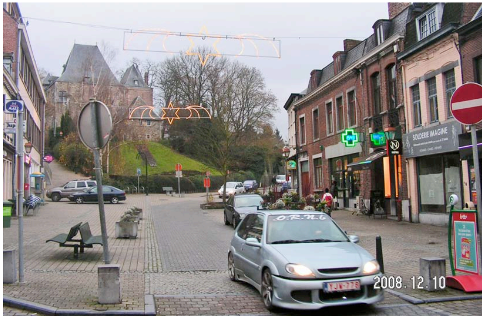
Place de l'Hôtel de ville