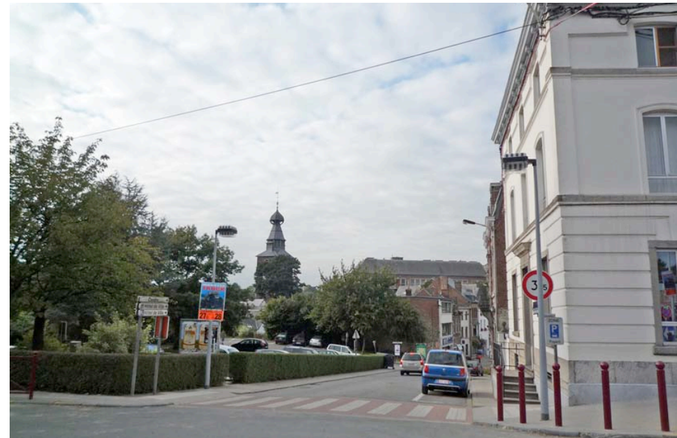
Rue du 8 Mai