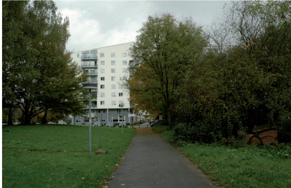
Road axis of the future Campus-Boulevard with the University's guesthouse in the background