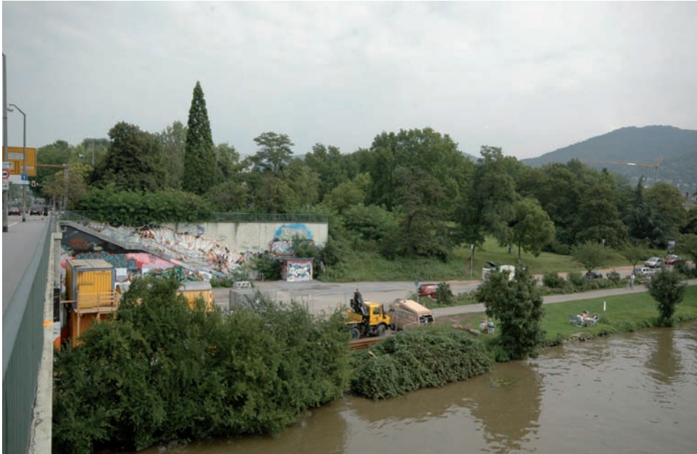
Green area at Roemerbad