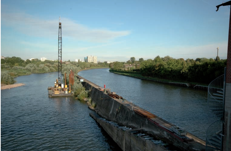
Altneckar, dam crest of Neckar Island and Neckar Canal