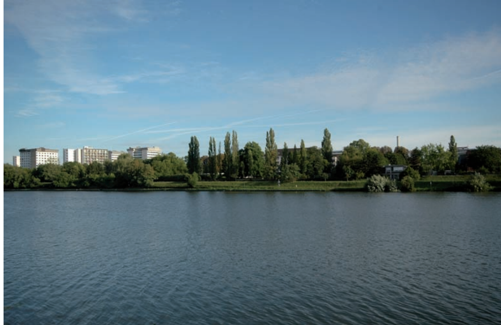
Neckar foreshore with the southern part of the University Campus