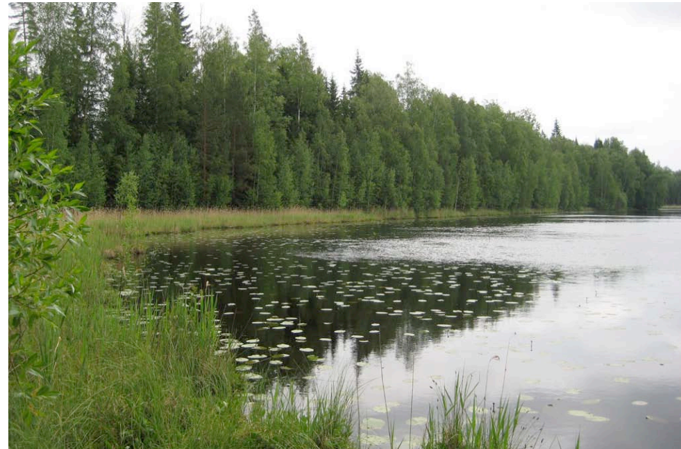
Pieni Virolainen lake