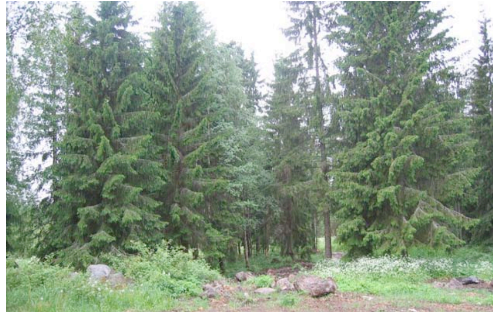
View from the site