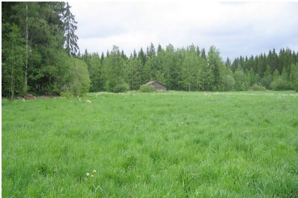
A meadow to the east of the project site