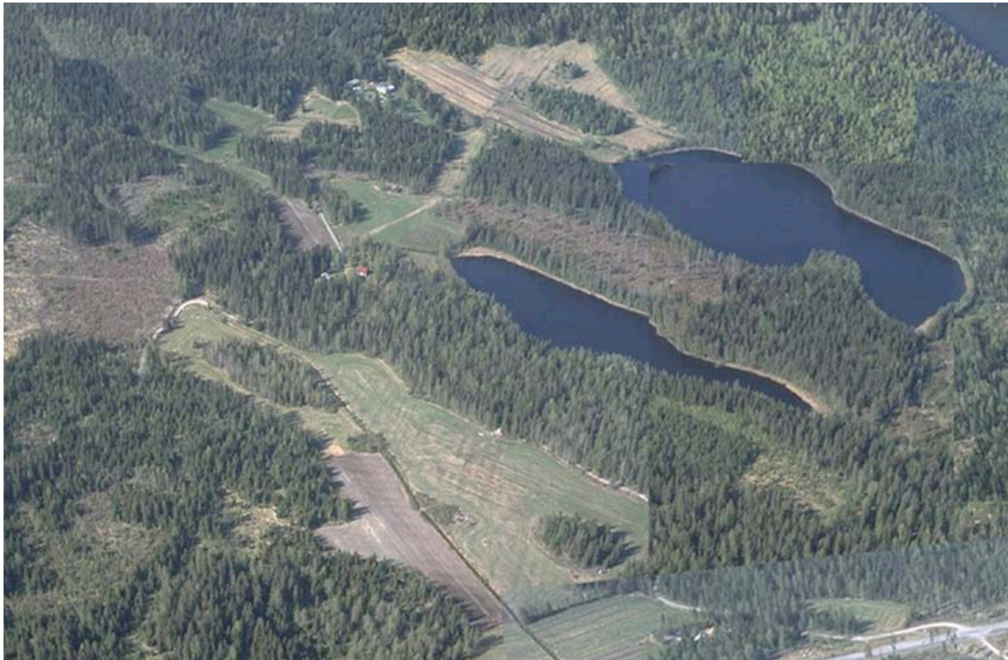
Aerial photo of the area covered by the competition