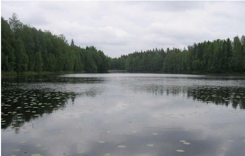
Pieni Virolainen lake