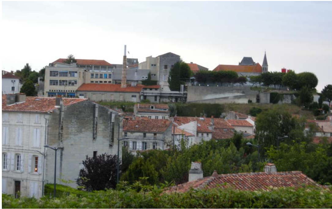
South façade of the site