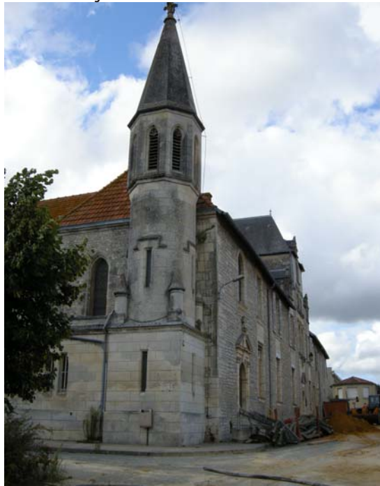
Chapel and Governor's house