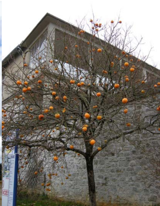
Health building with extension