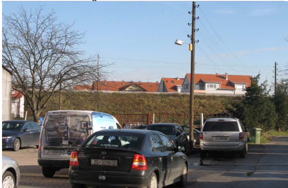
view of the NASIP