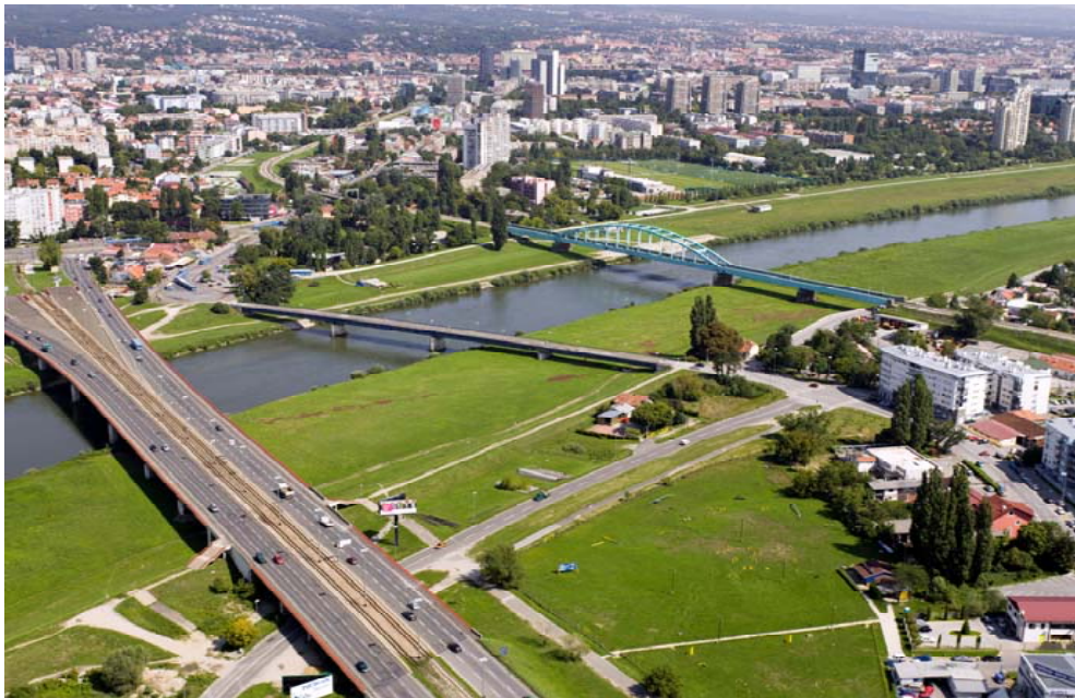
aerial view of the bridges