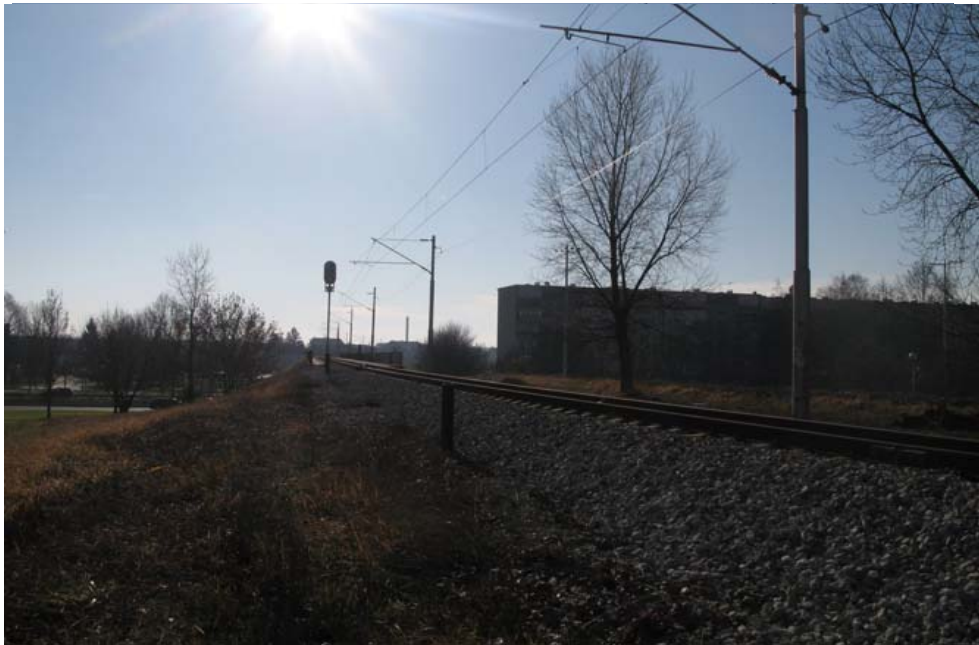
view of the railroad