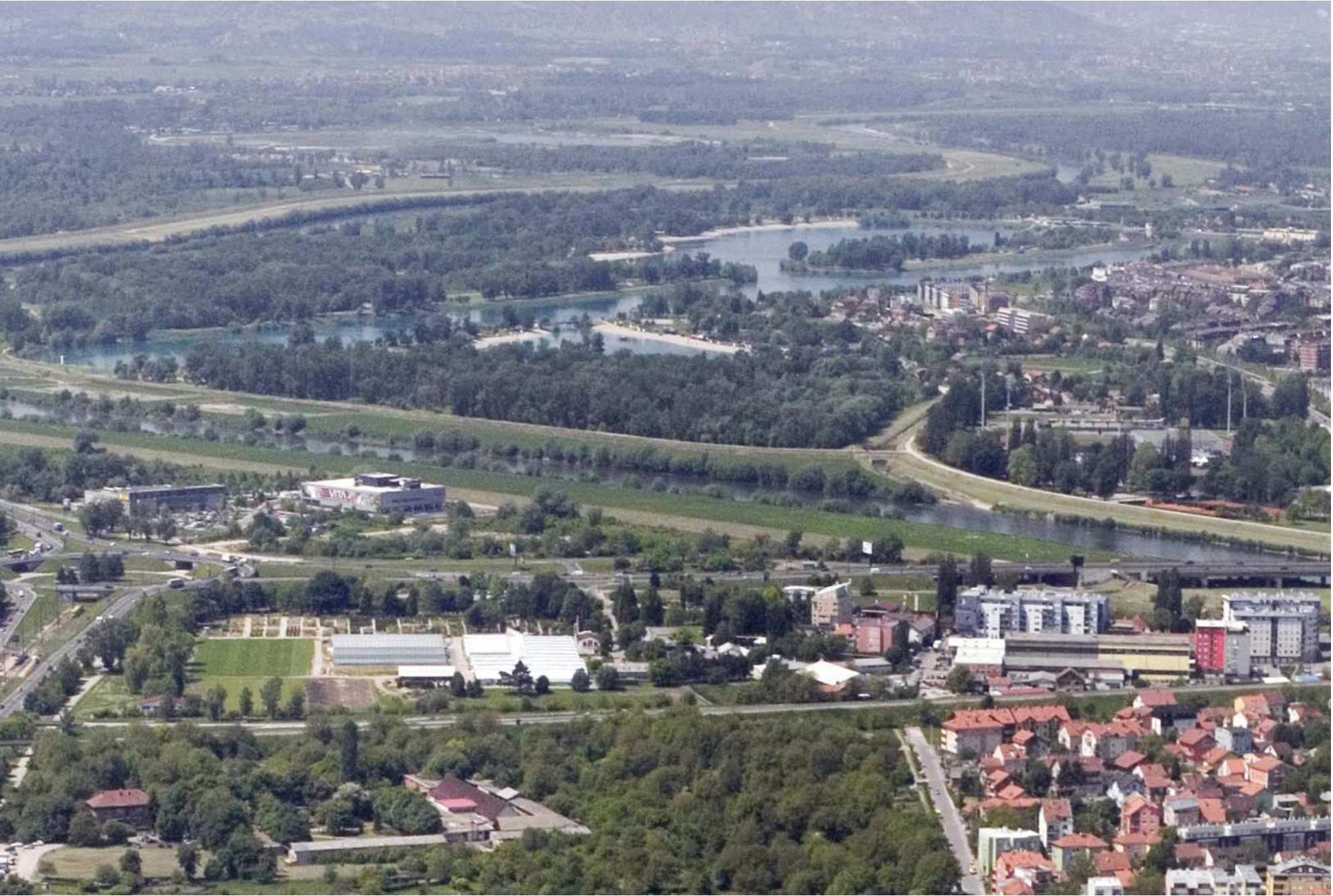
Zagreb – Hrvatska – europa 10