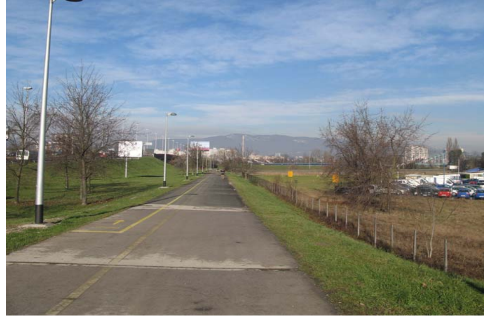
view from the south