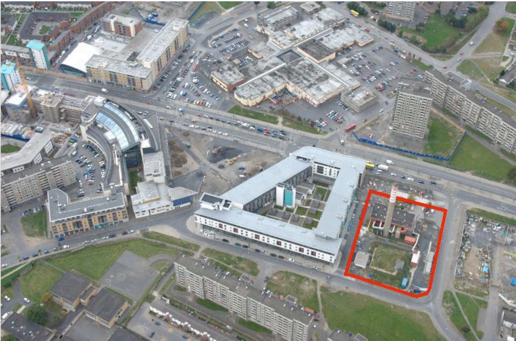
Aerial view of boiler house site