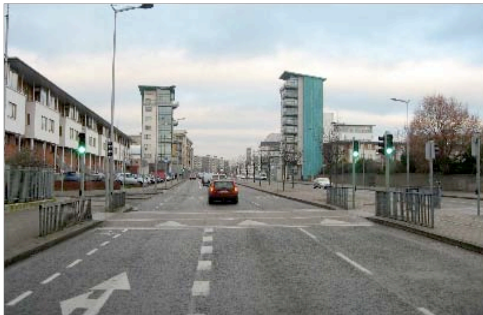
A Aerial view of main street adjacent site B Road intersection adjacent site C View looking south towards Study Site D View looking North along Ballymun Main Street