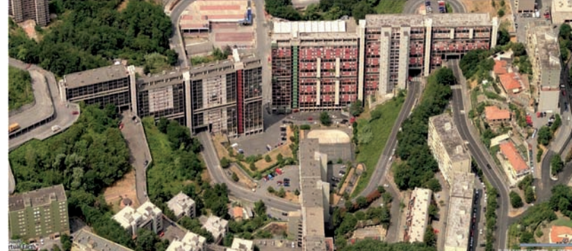
Perspective view of Begato 9 and old-Miralanza factory