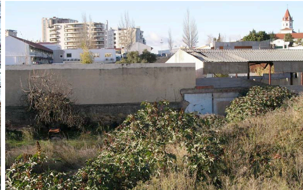
1 - Intersection of Avenida do Brasil and Campo Grande