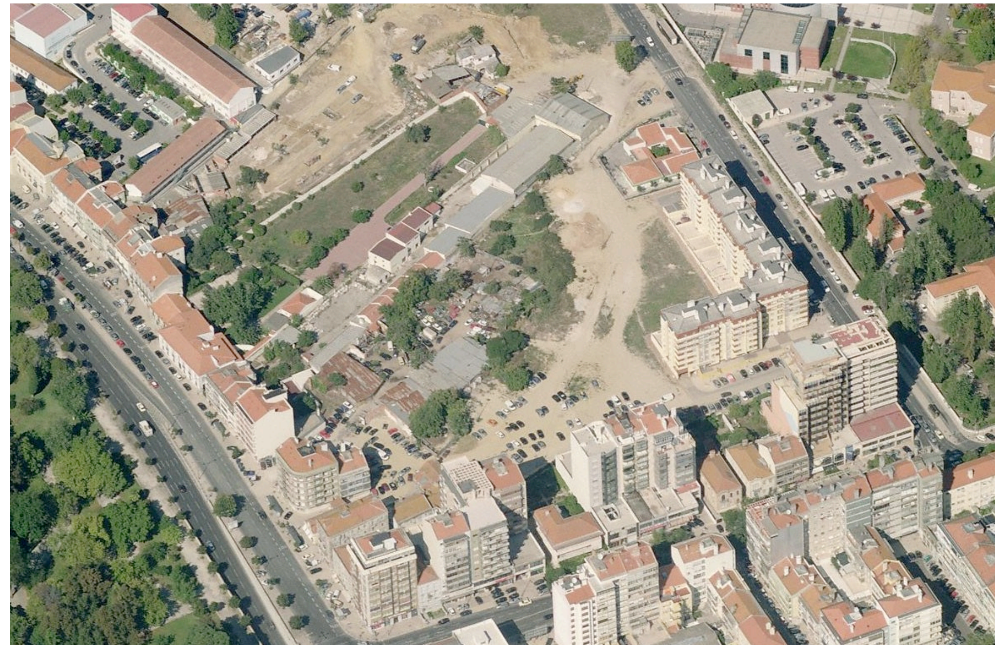
Aerial view of the site