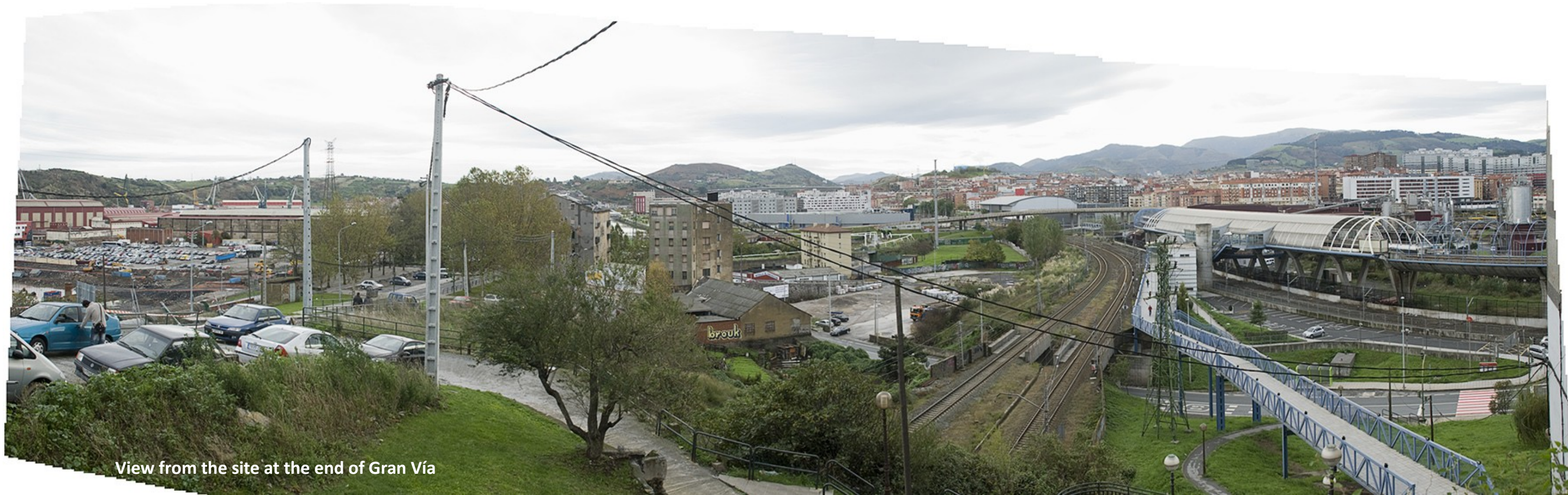
View from the site at the end of Gran Vía