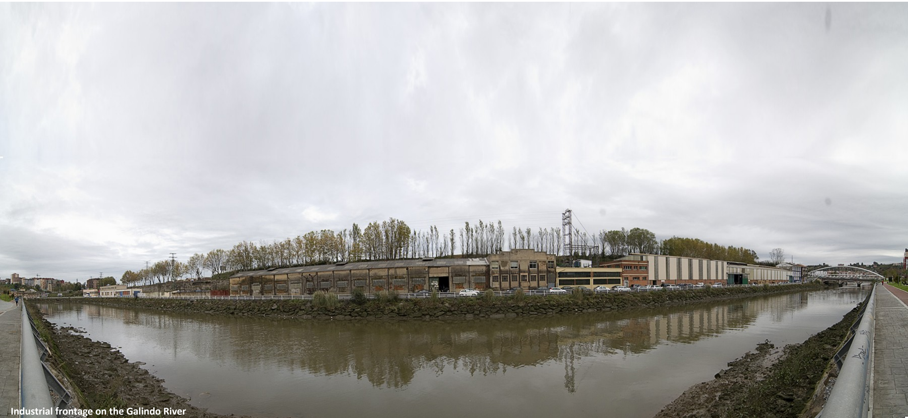
Industrial frontage on the Galindo River