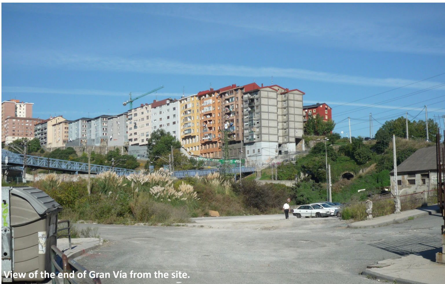
View of the end of Gran Vía from the site.