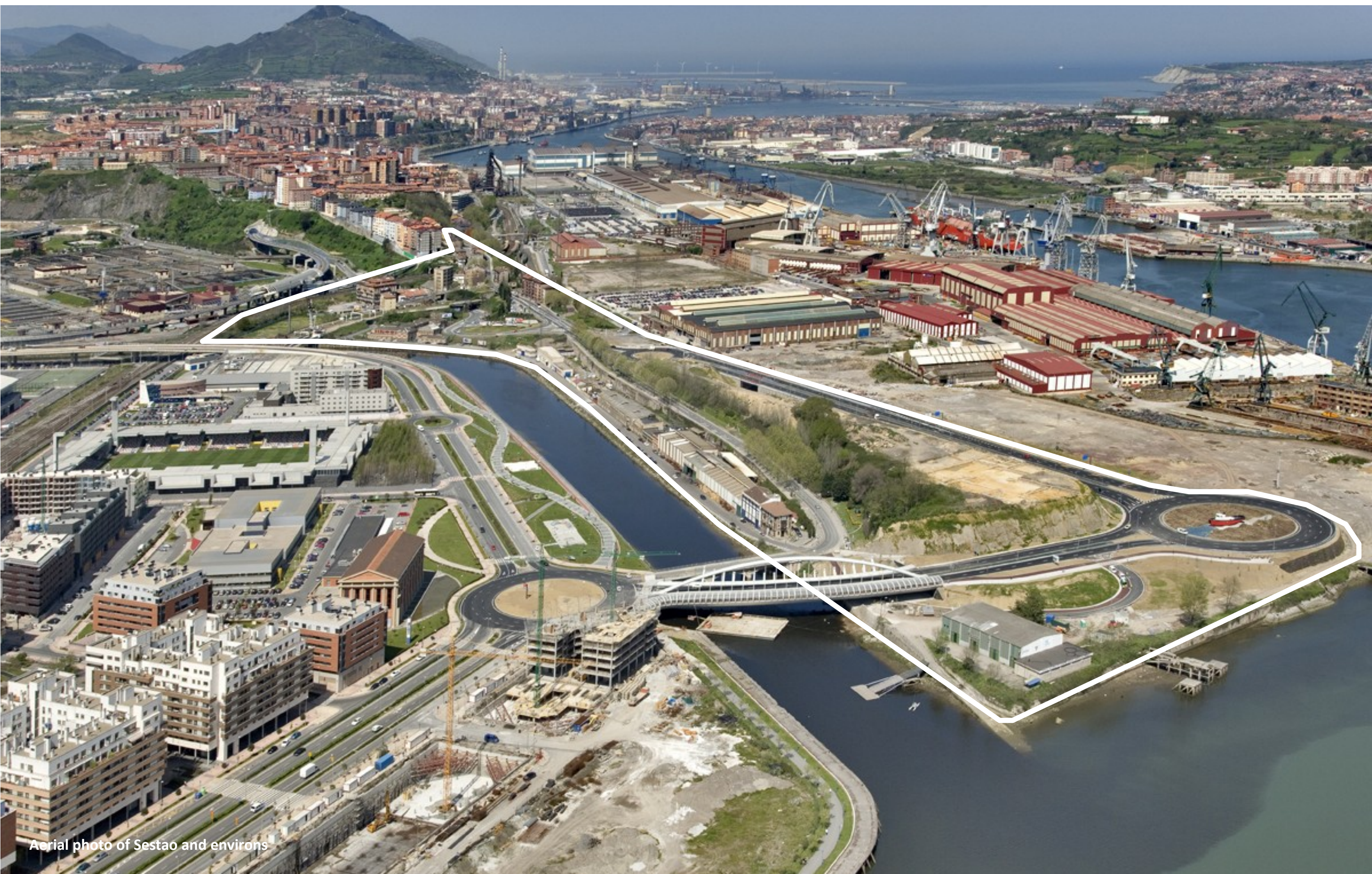
Aerial photo of Sestao and environs