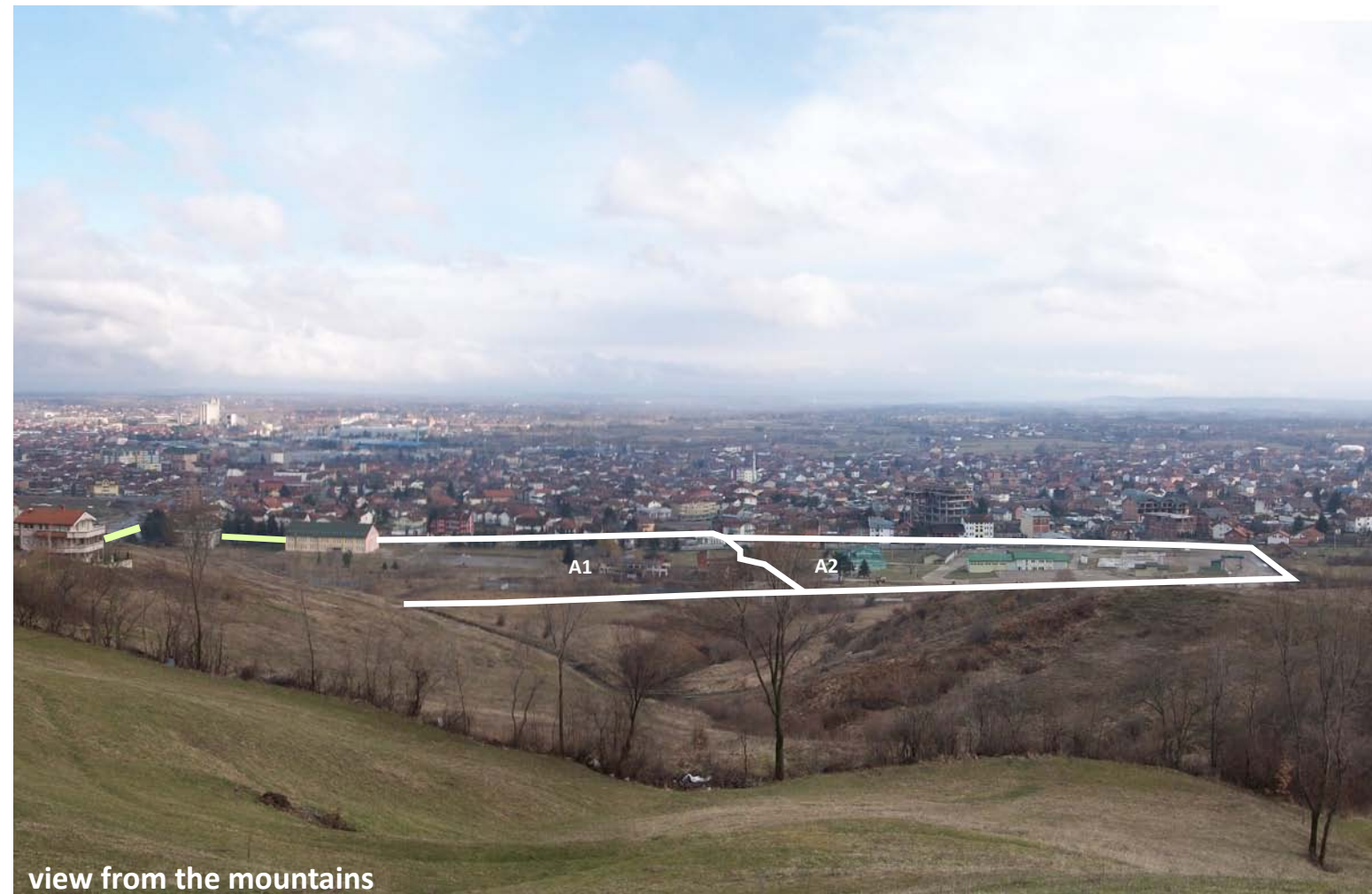
view from the mountains