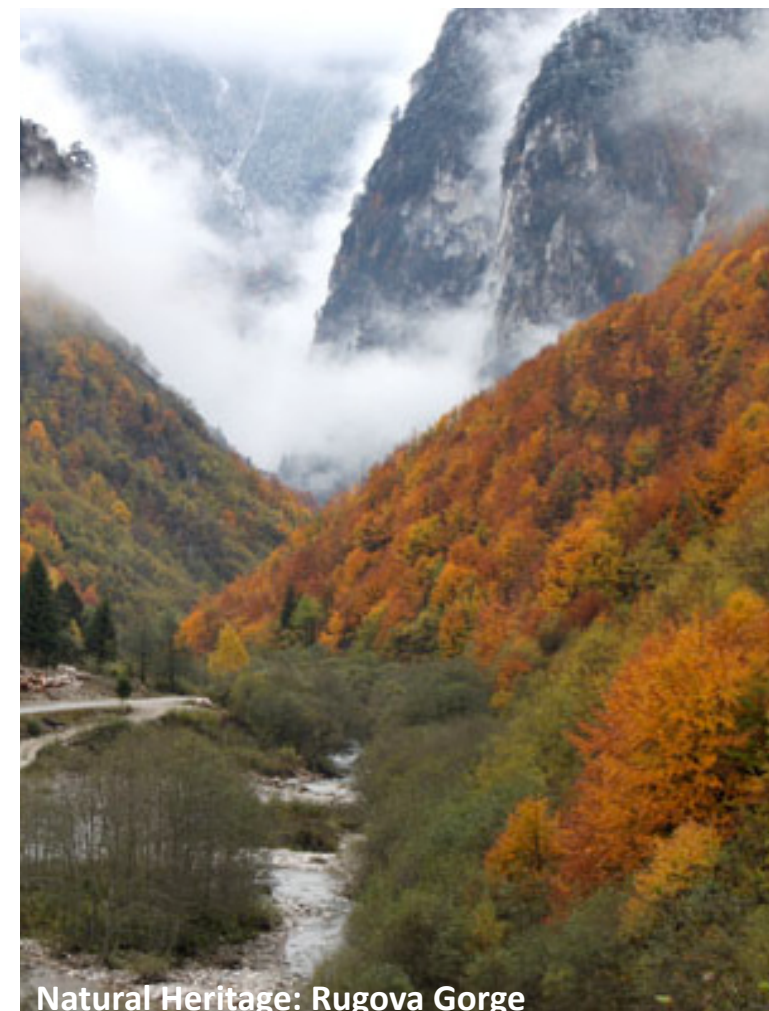
Natural Heritage: Rugova Gorge