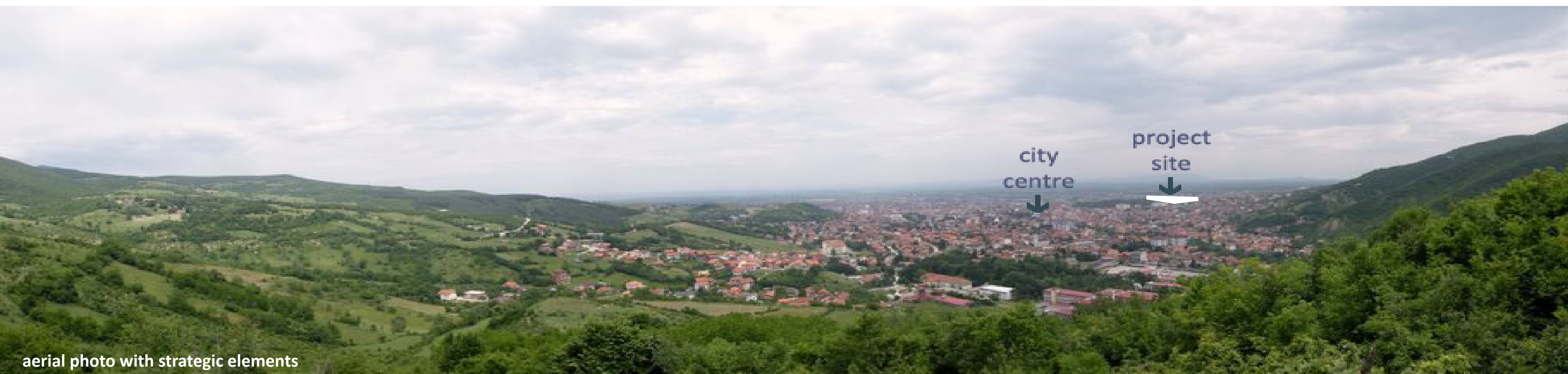
aerial photo with strategic elements