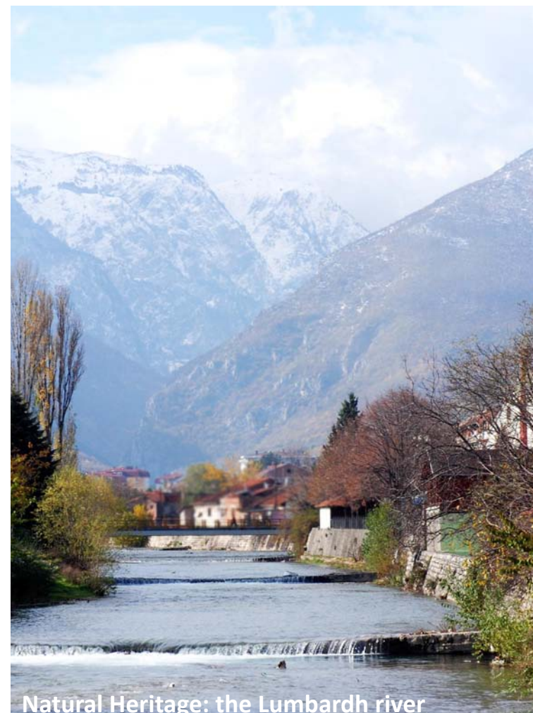
Natural Heritage: the Lumbardh river