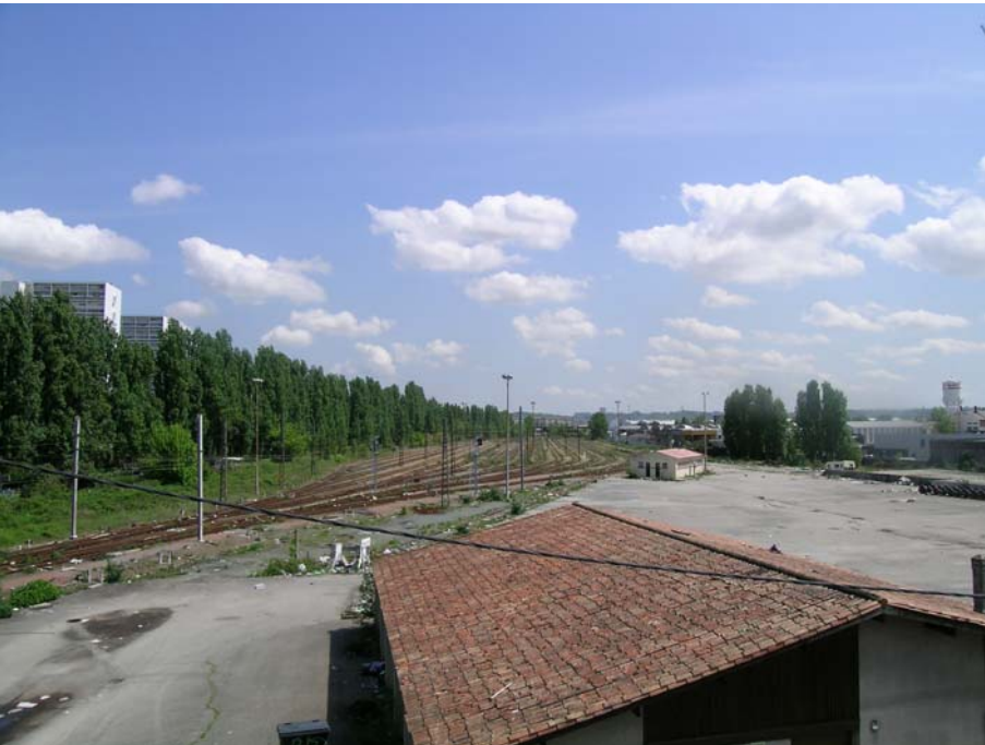
Disused railway cluster seen from the Allées de Boutaut looking East (project site)