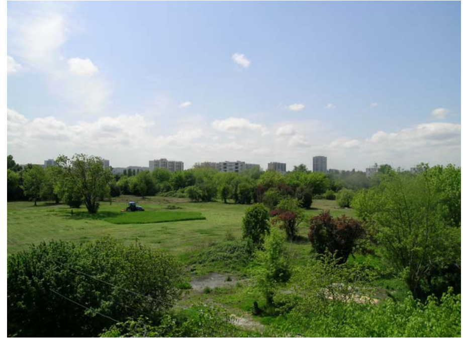
Land that can be urbanised West of the allées de boutaut (outside study site)