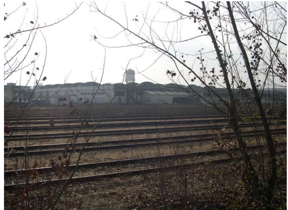
Disused railway cluster as seen from the SAFT site (project site)