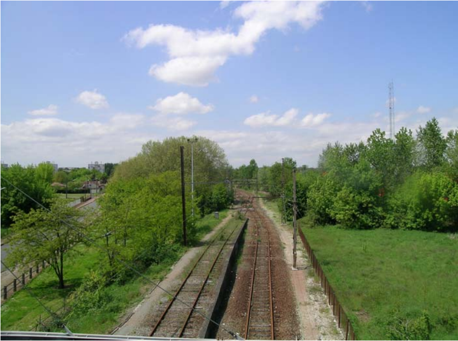
The disused rail road towards the West seen from the study site (outside the study site)