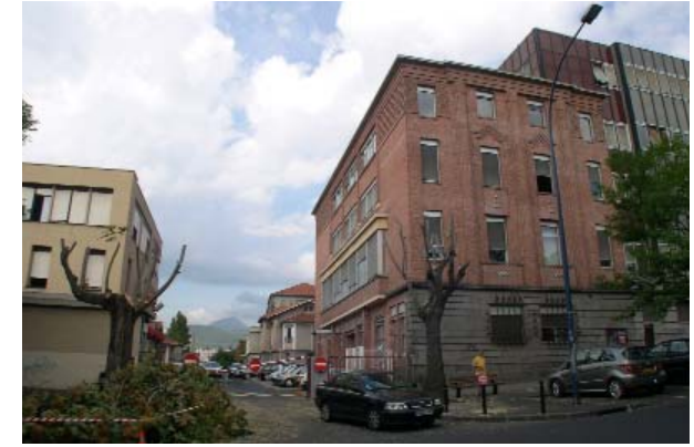
Maternity hospital and laboratory (pavillon Emile Roux)

photos taken at ground level showing the project site's characteristic elements