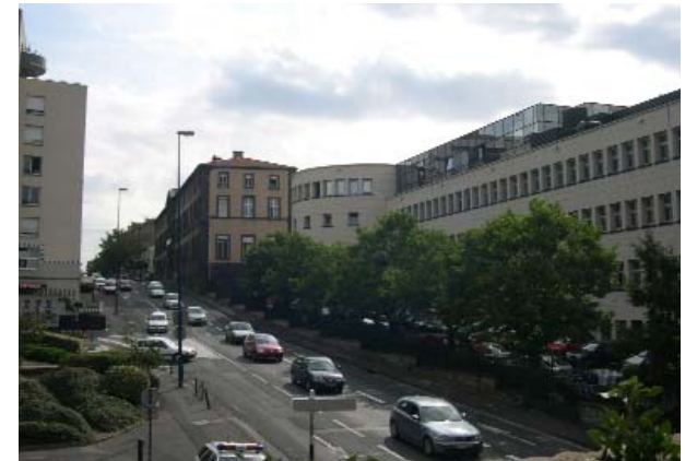
Bd Lagarlaye, View towards North facade-dental faculty