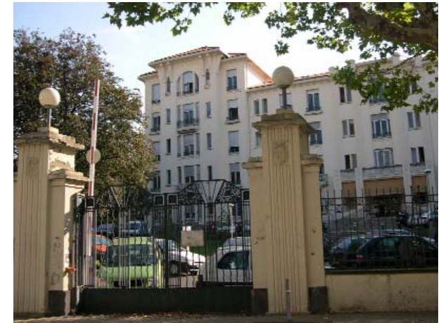
Entrance gates Bd Charles de Gaulle - Polyclinic