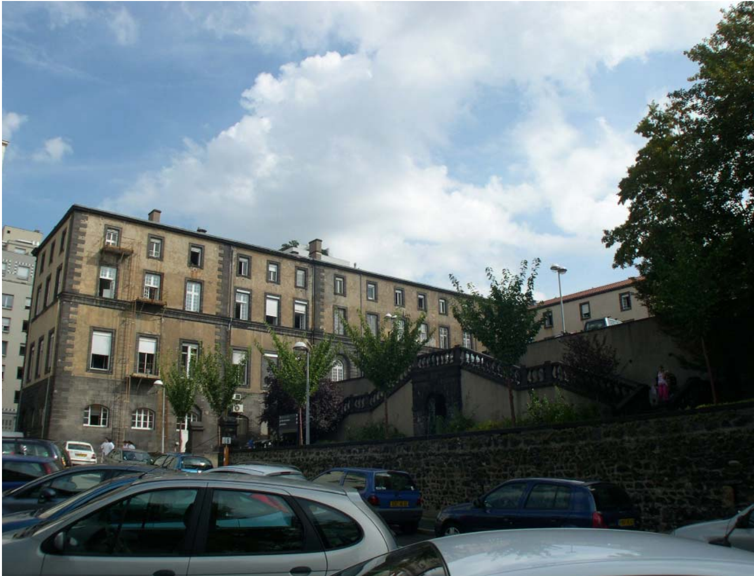
View of the stairs of the Cour d'Honneur (interior south facade)

photos taken at ground level showing the project site's characteristic elements