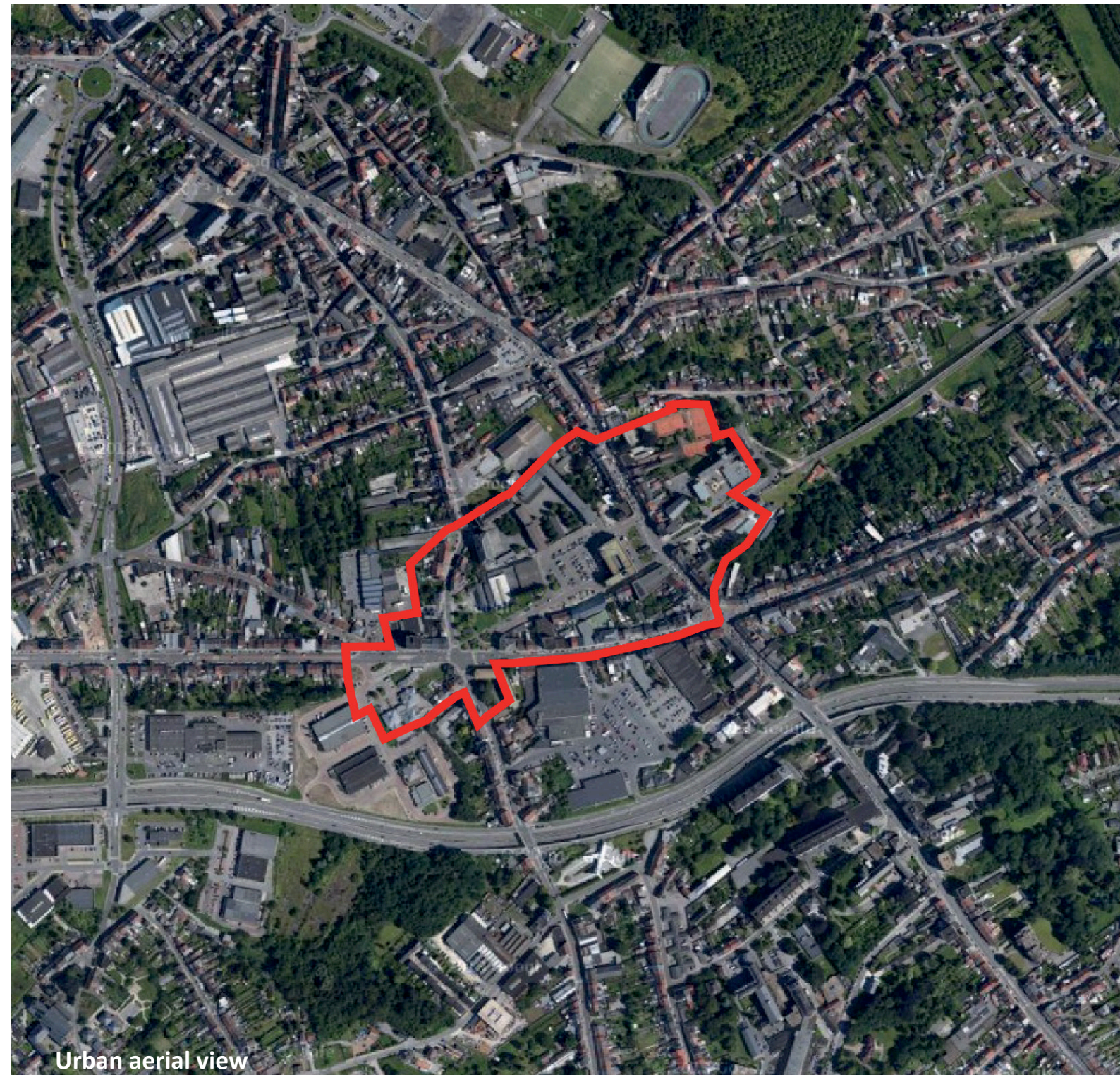
Urban aerial view