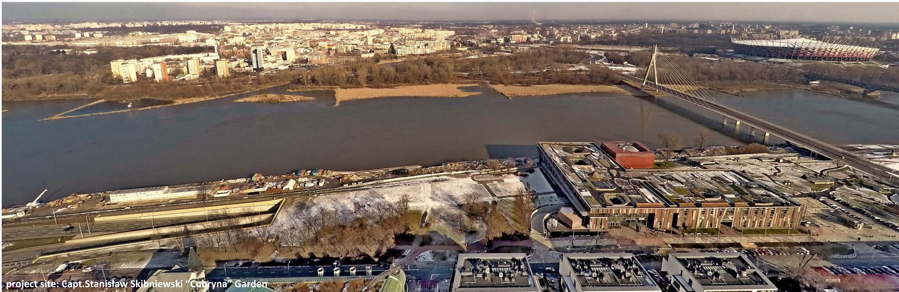
project site: Capt. Stanisław Skibniewski "Cubryna" Garden