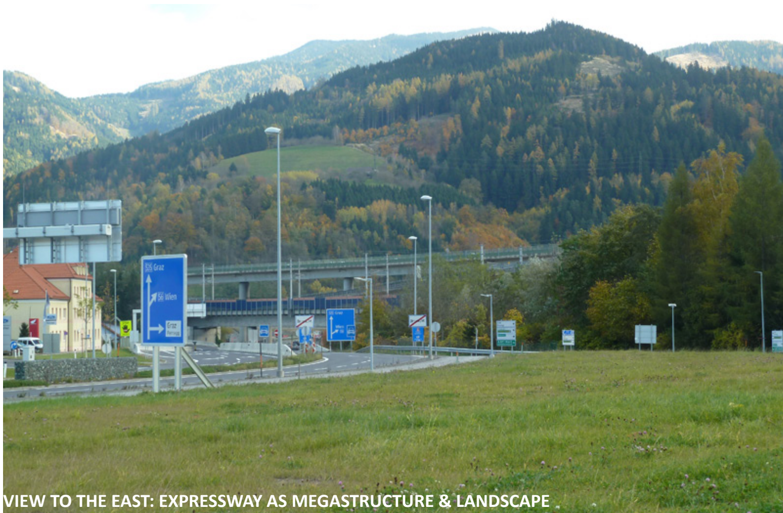
VIEW TO THE EAST: EXPRESSWAY AS MEGASTRUCTURE & LANDSCAPE