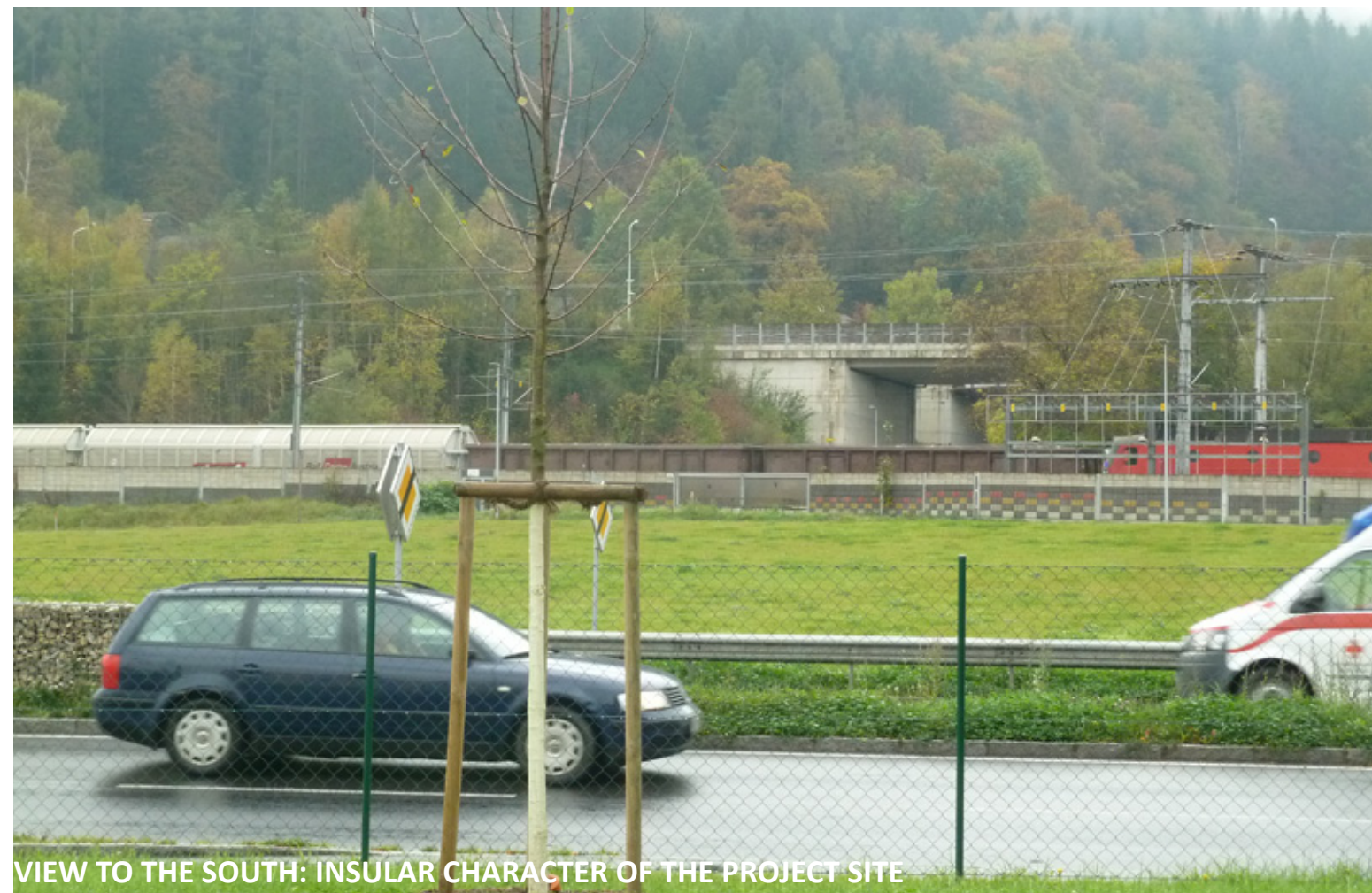
VIEW TO THE SOUTH: INSULAR CHARACTER OF THE PROJECT SITE