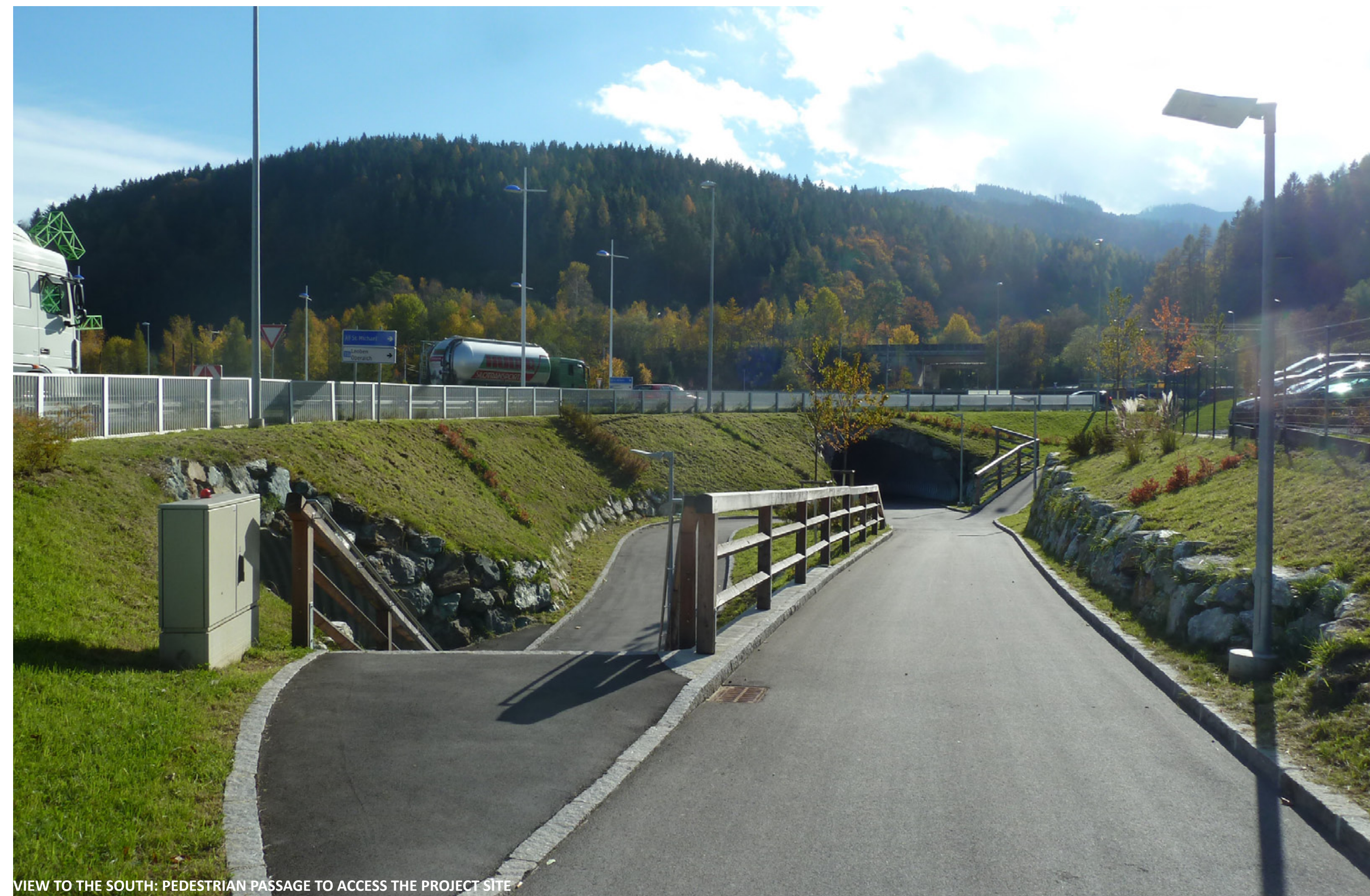
VIEW TO THE SOUTH: PEDESTRIAN PASSAGE TO ACCESS THE PROJECT SITE