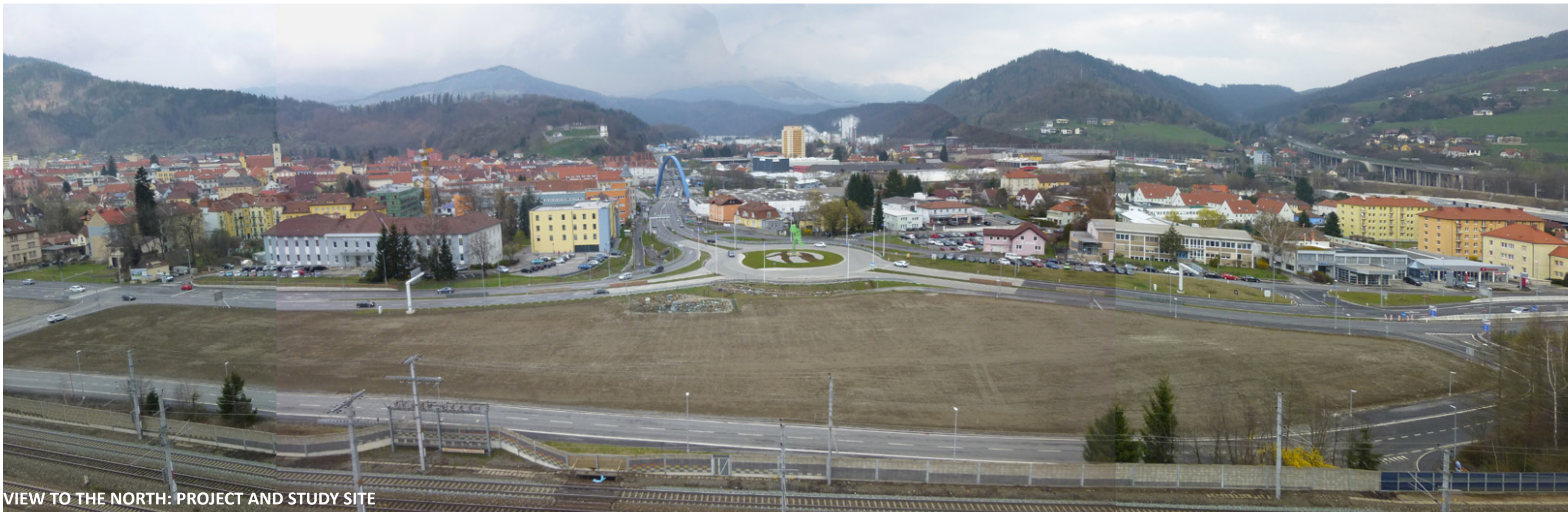
VIEW TO THE NORTH: PROJECT AND STUDY SITE