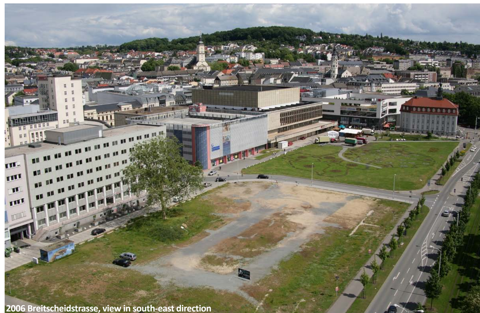
2006 Breitscheidstrasse, view in south-east direction