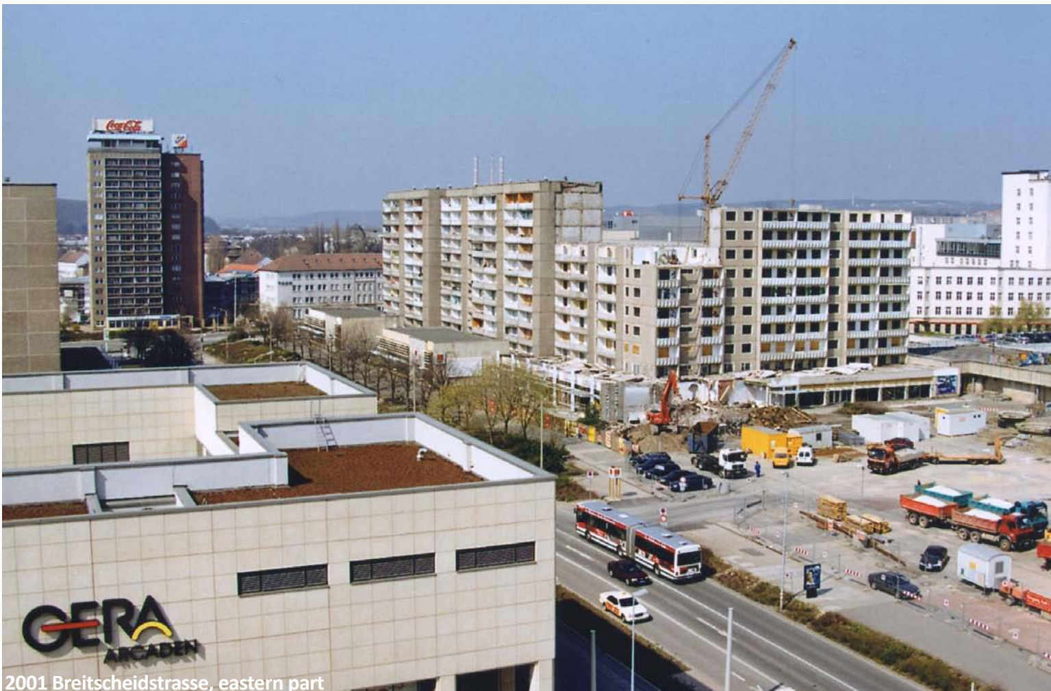
2001 Breitscheidstrasse, eastern part