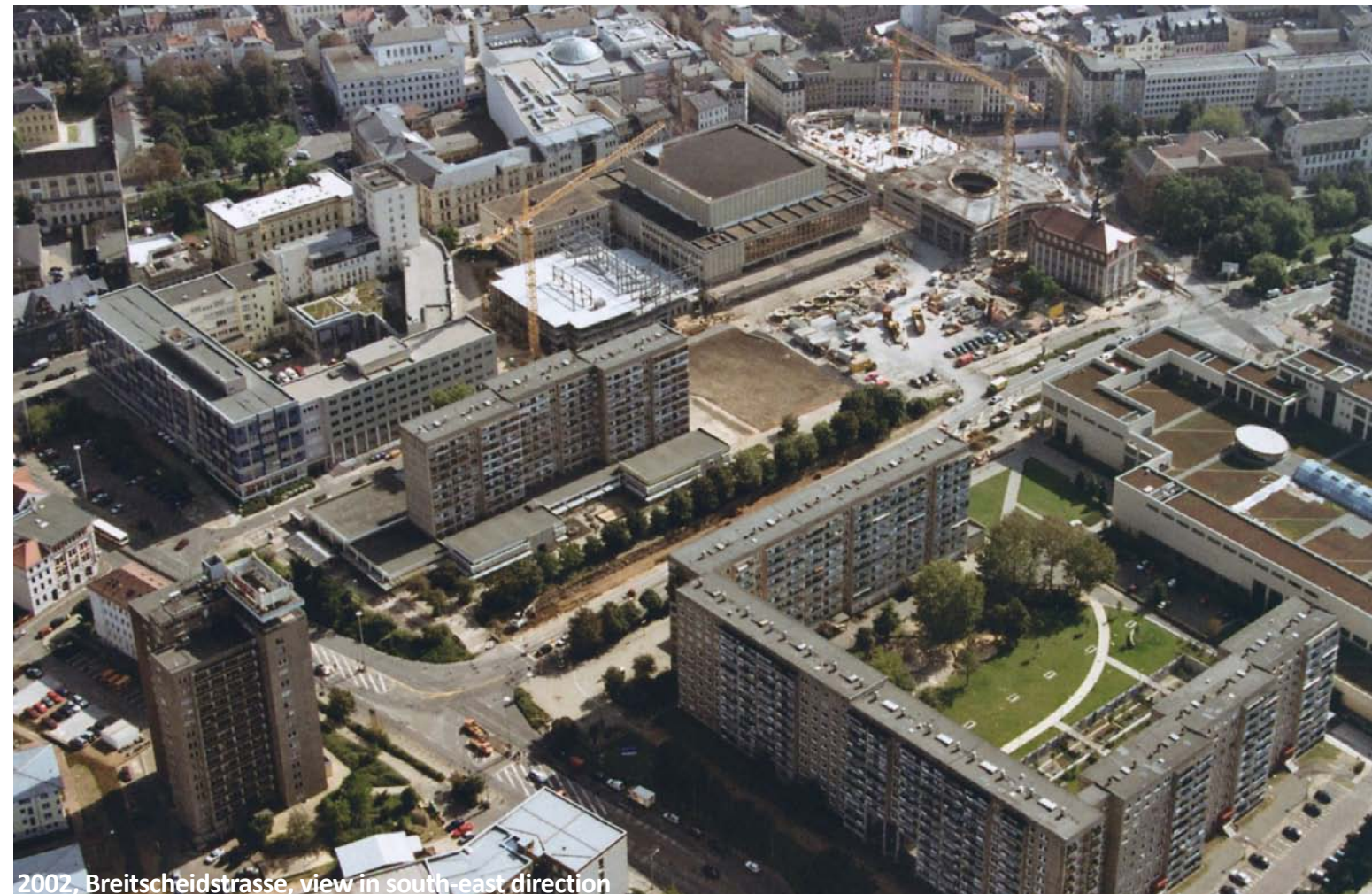
2002, Breitscheidstrasse, view in south-east direction