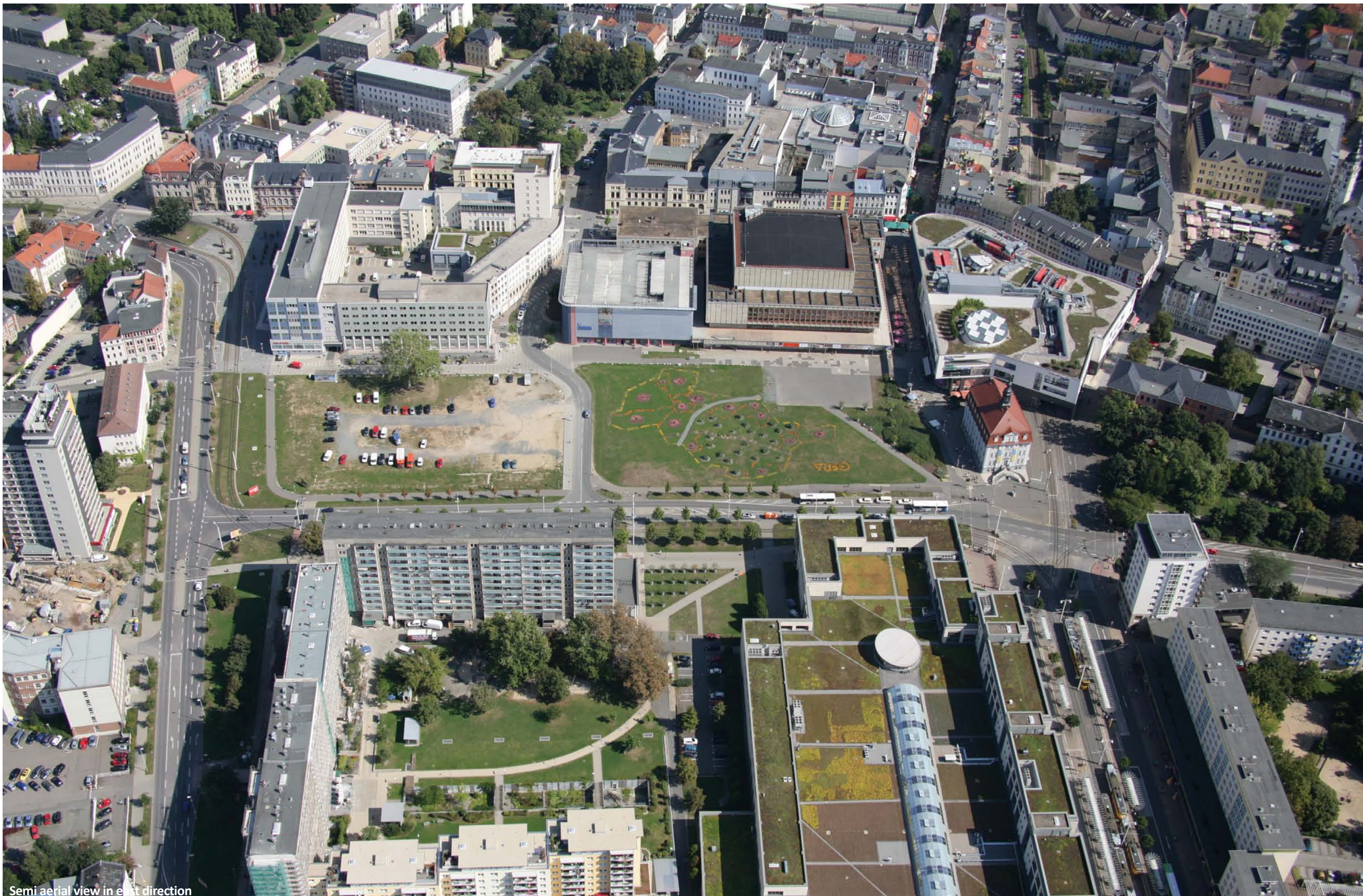
Semi aerial view in east direction