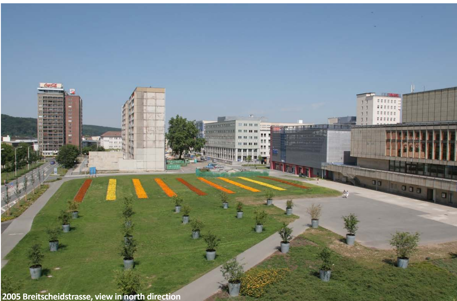
2005 Breitscheidstrasse, view in north direction