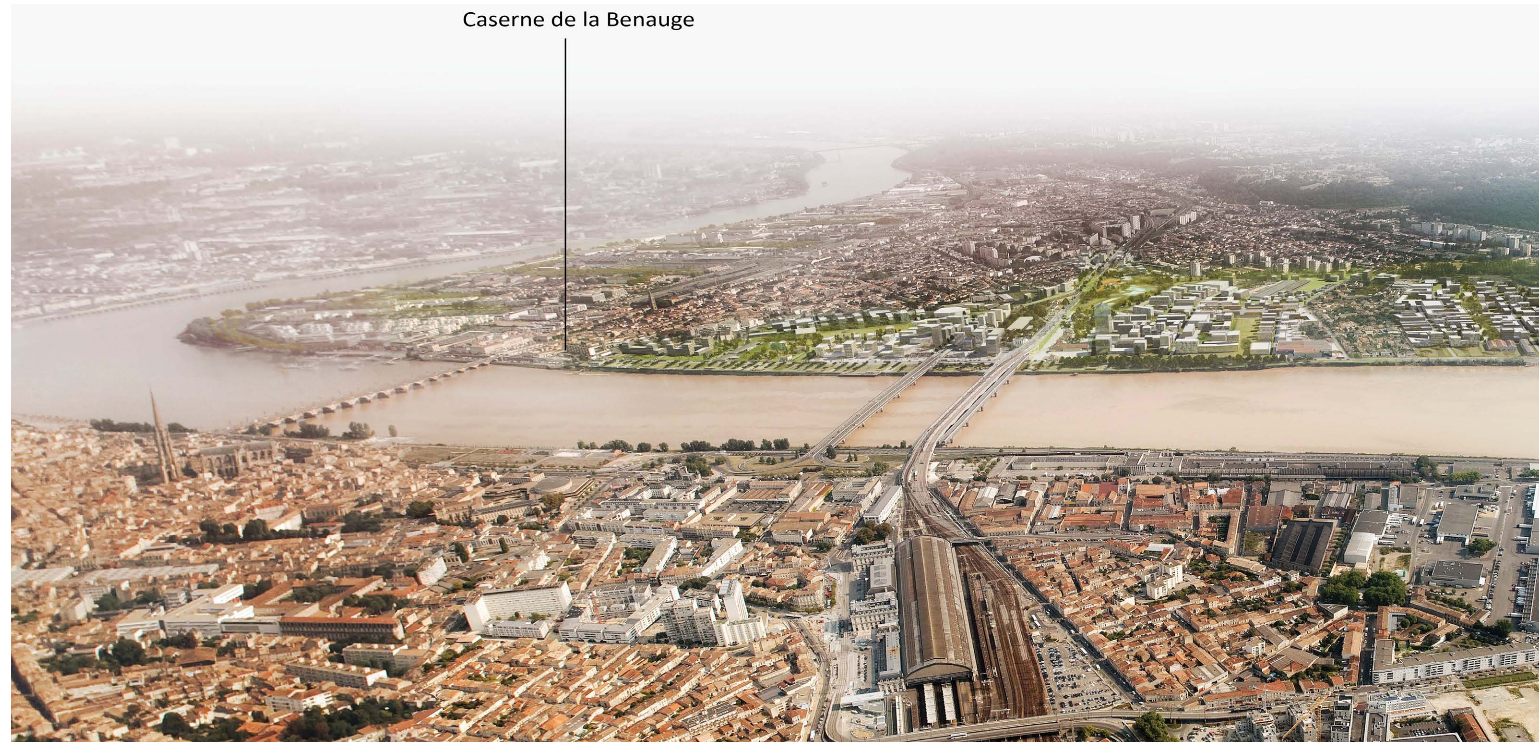
Caserne de la Benaugue