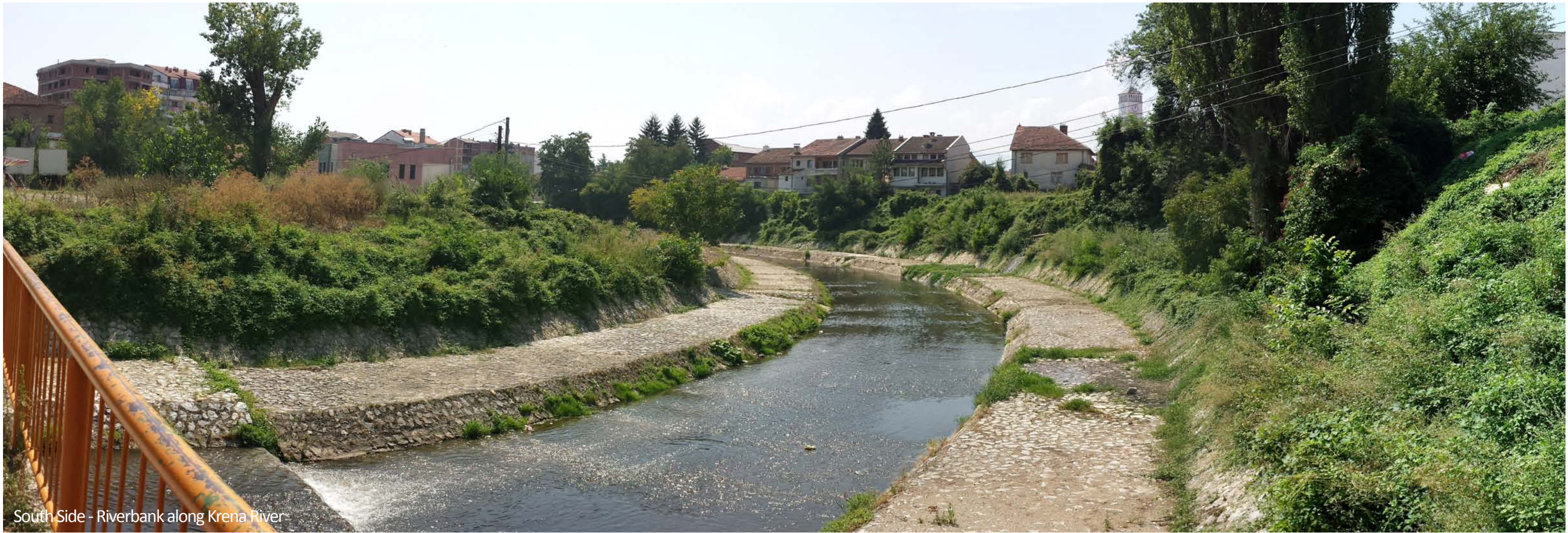
South Side - Riverbank along Krena River