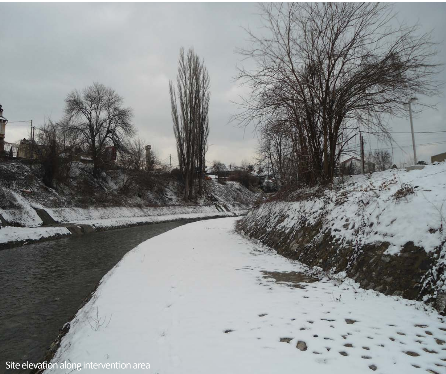
Site elevation along intervention area