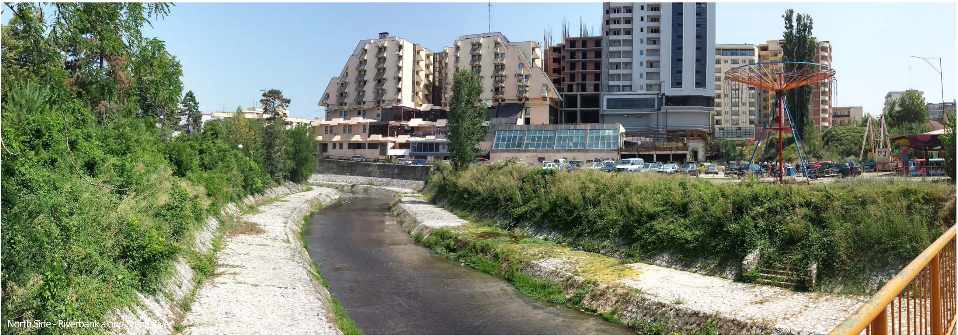
North Side - Riverbank along Krena River