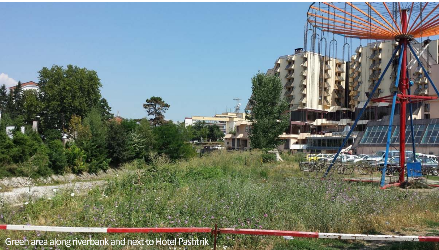
Green area along riverbank and next to Hotel Pashtrik