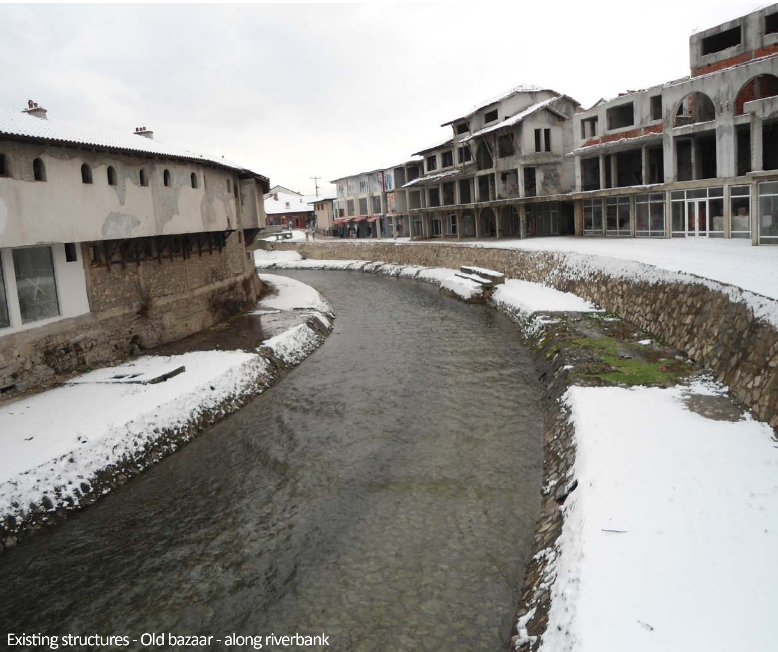
Existing structures - Old bazaar - along riverbank