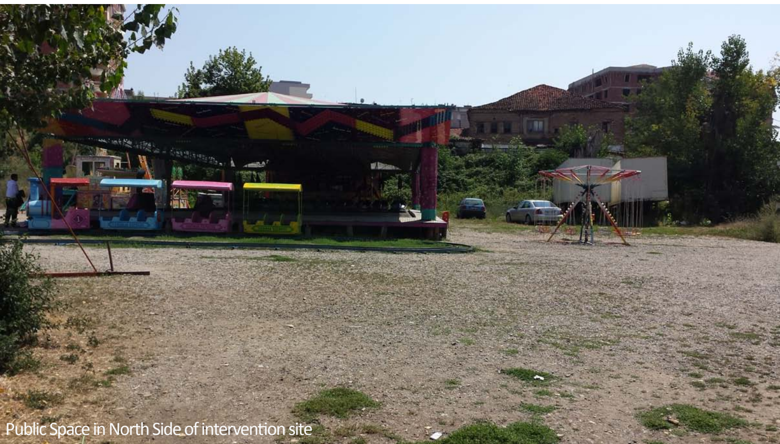
Public Space in North Side of intervention site