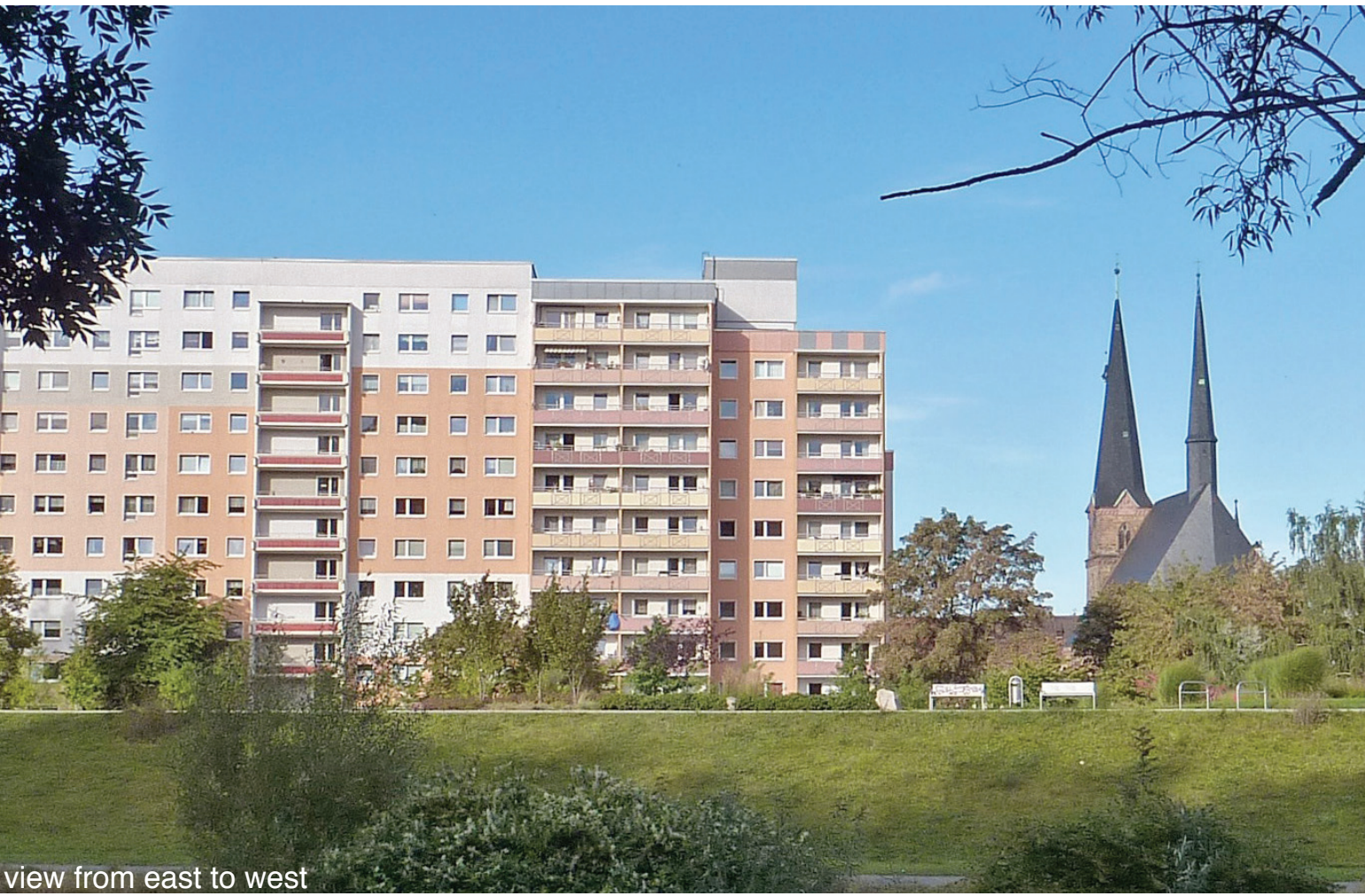
view from east to west