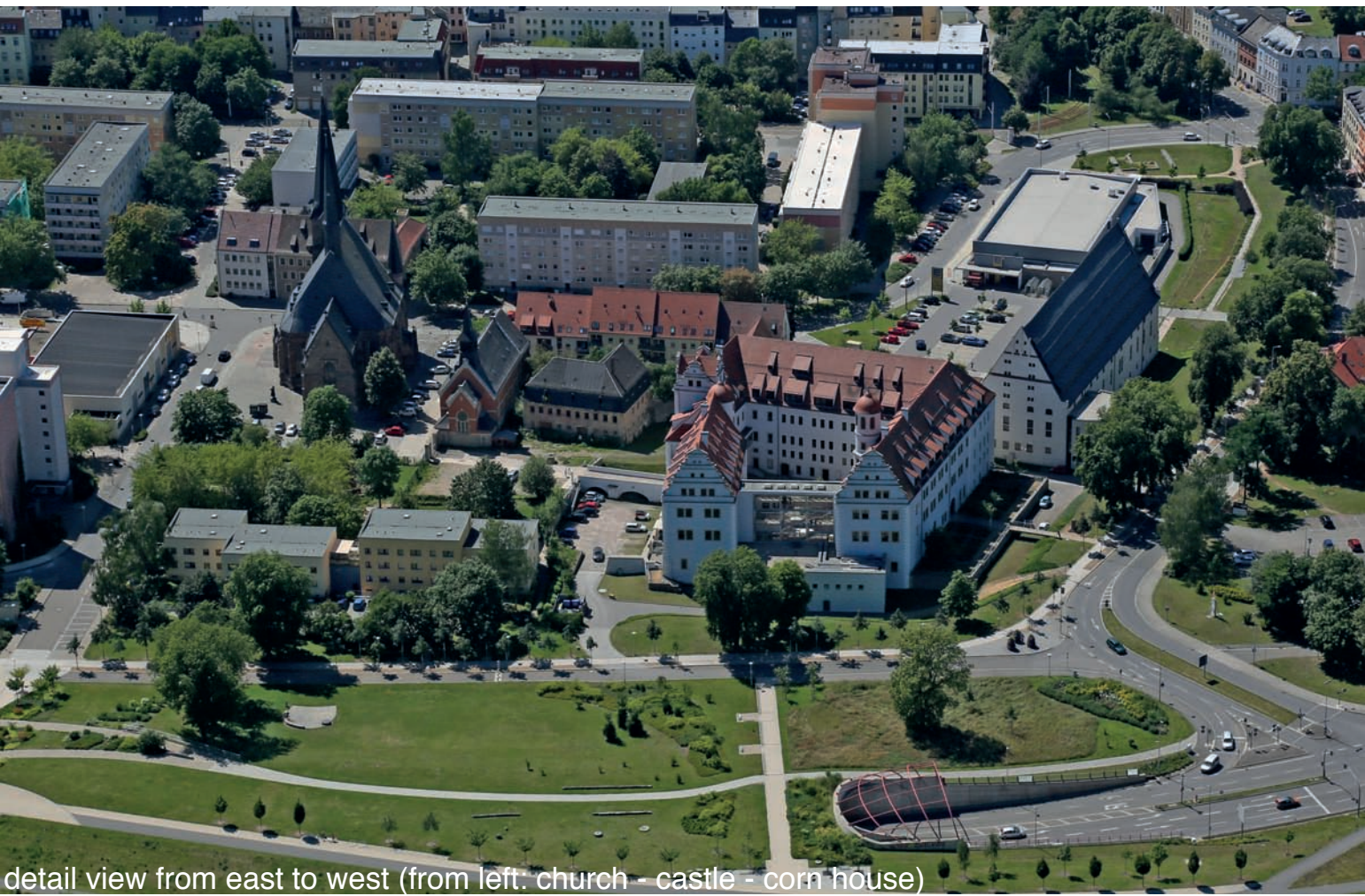
detail view from east to west (from left: church - castle - corn house)