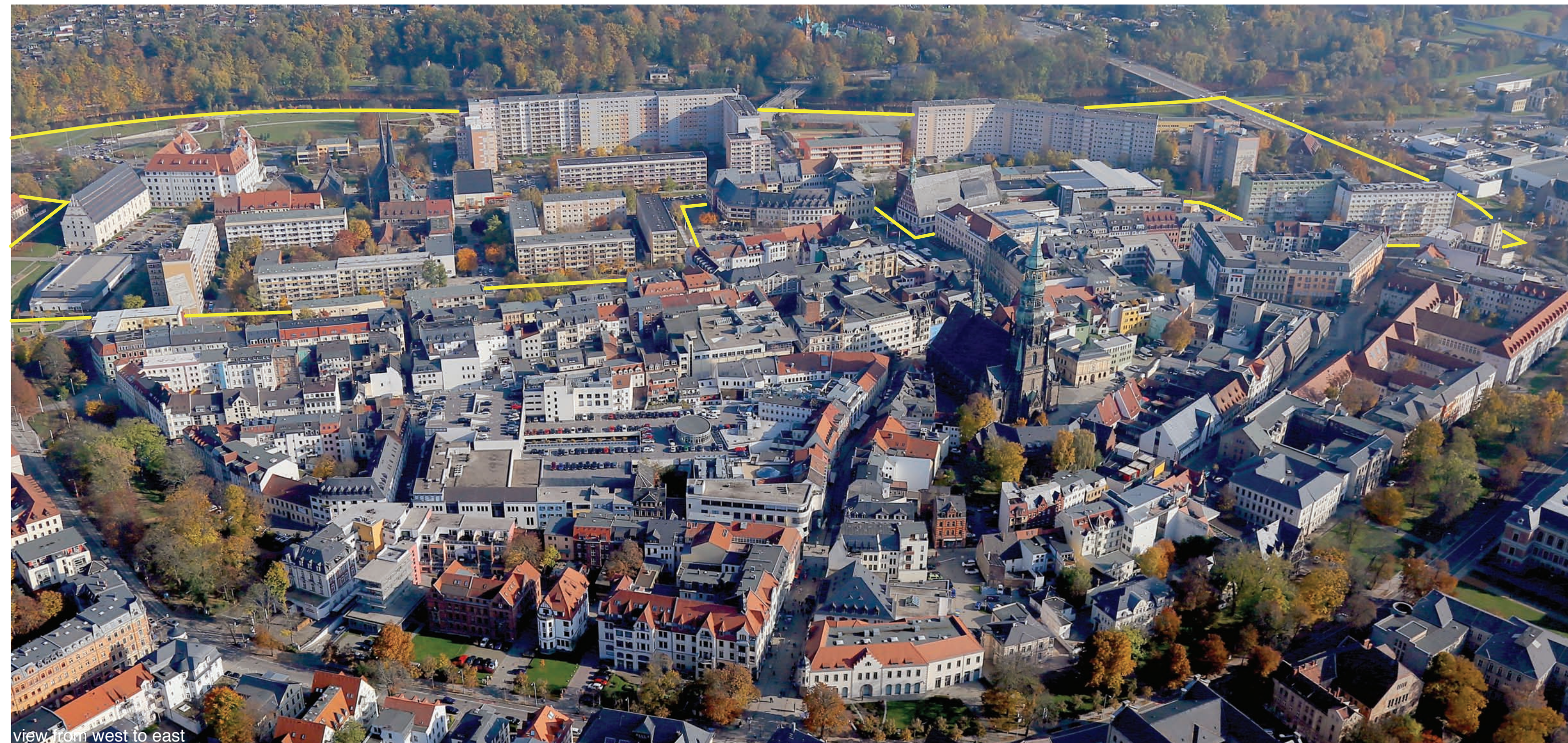
view from west to east