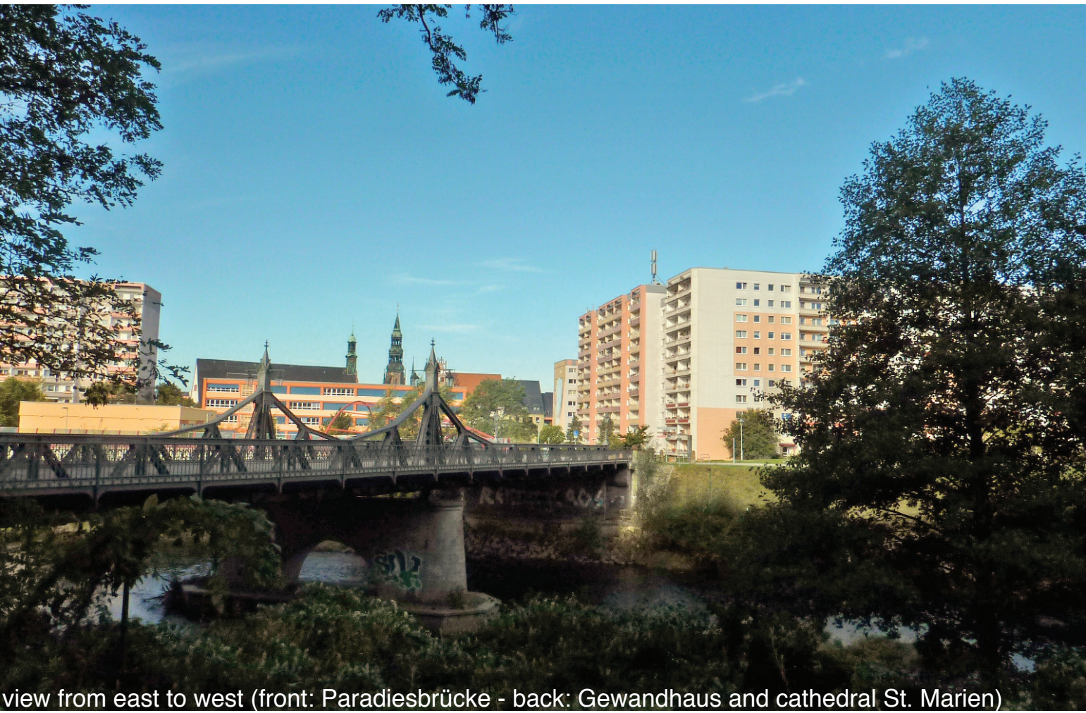
view from east to west (front: Paradiesbrücke - back: Gewandhaus and cathedral St. Marien)