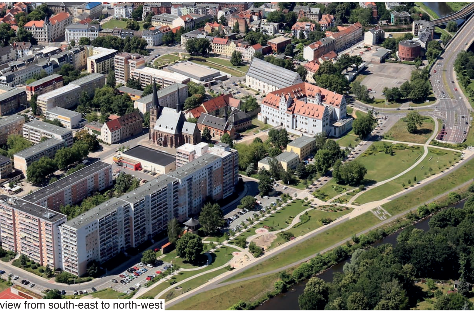
view from south-east to north-west