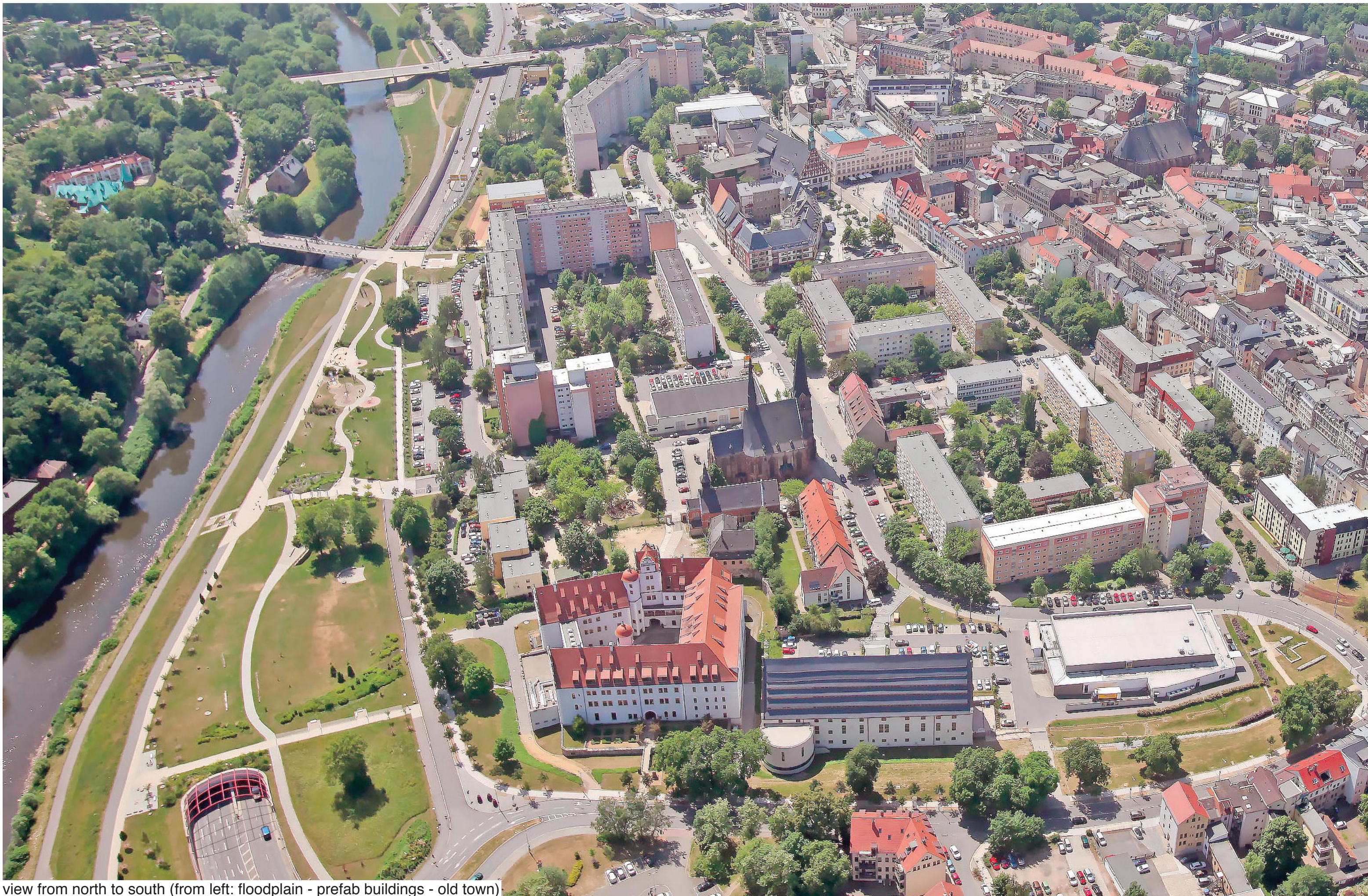
view from north to south (from left: floodplain - prefab buildings - old town)