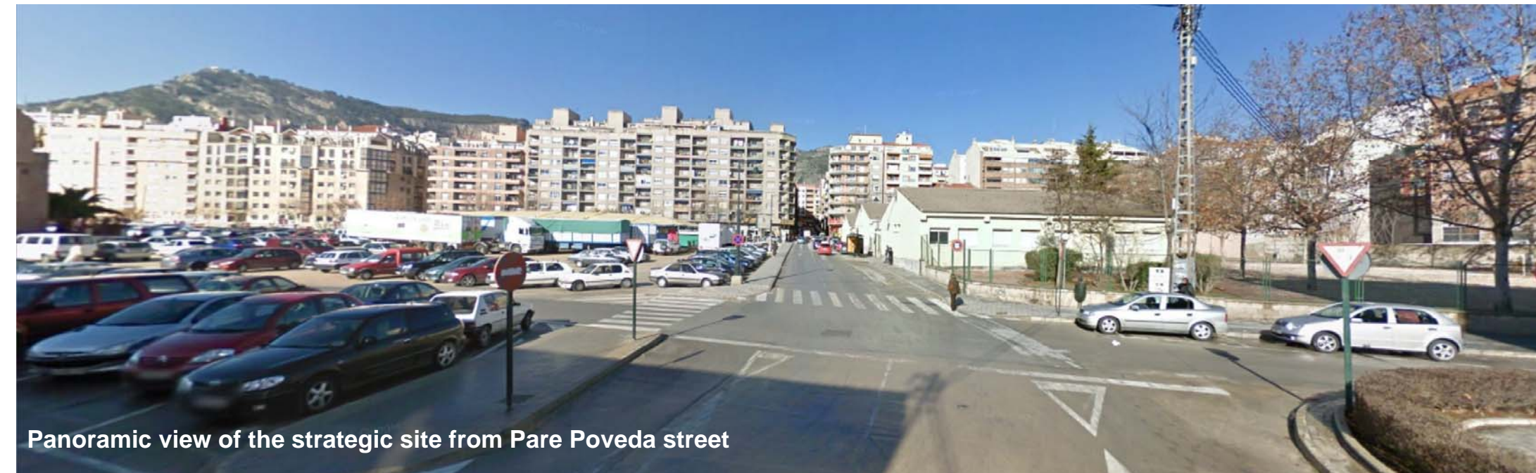
Panoramic view of the strategic site from Pare Poveda street