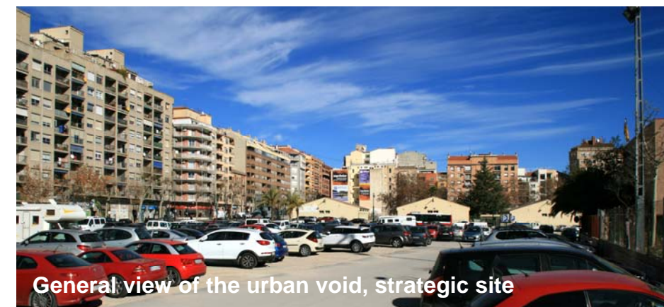
General view of the urban void, strategic site