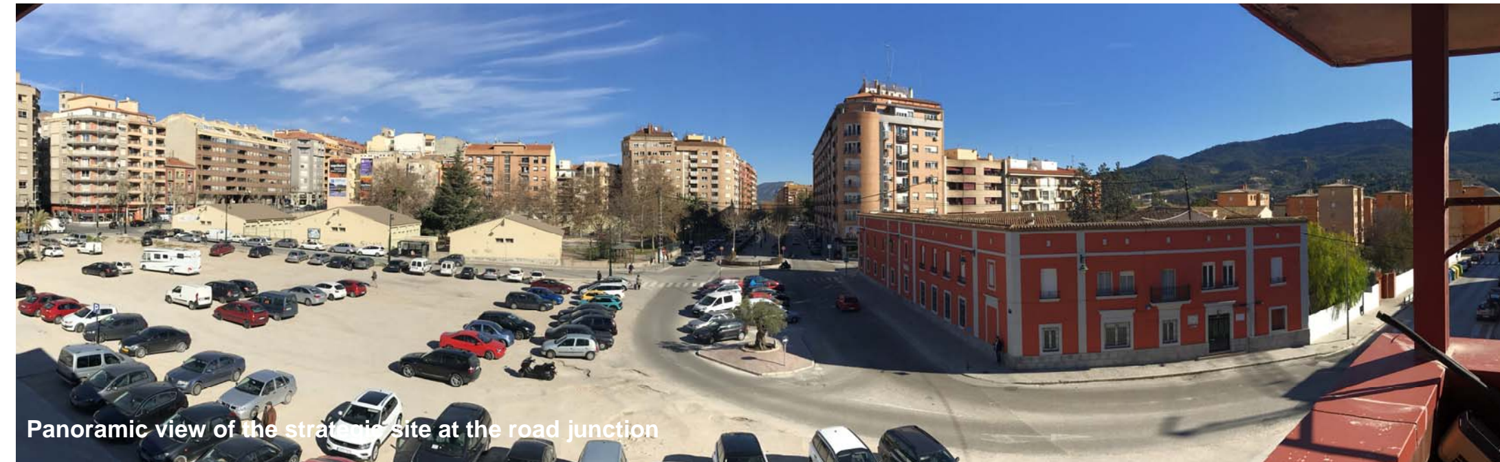
Panoramic view of the strategic site at the road junction