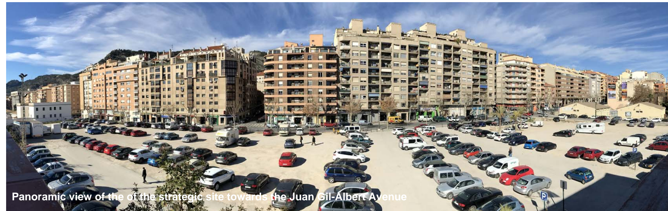
Panoramic view of the of the strategic site towards the Juan Gil-Albert Avenue