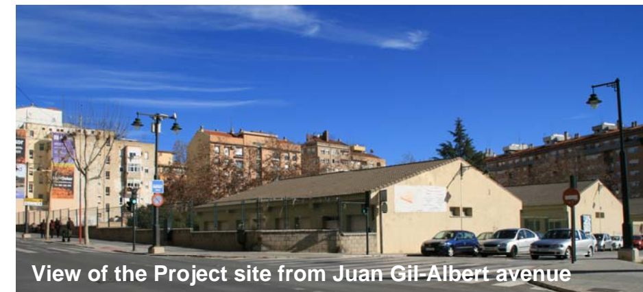
View of the Project site from Juan Gil-Albert avenue