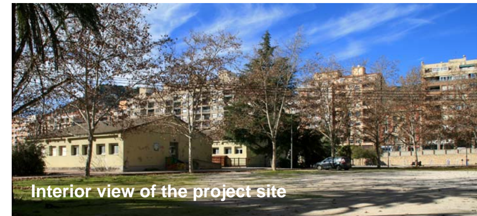
Interior view of the project site