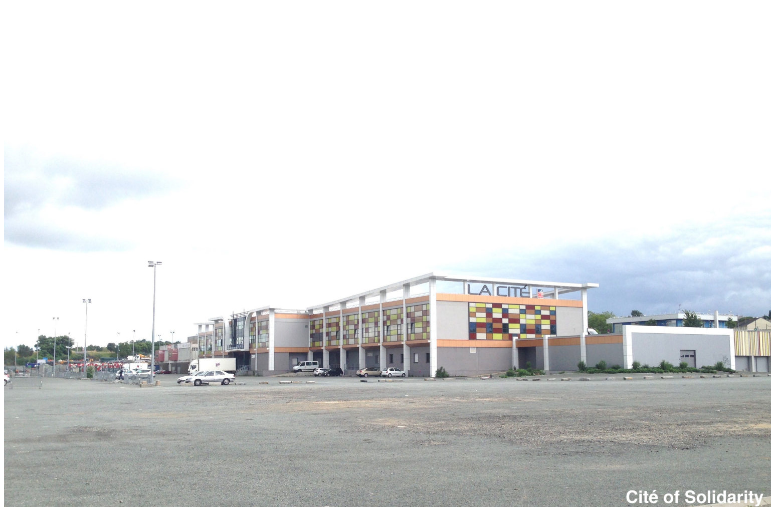
Cité of Solidarity