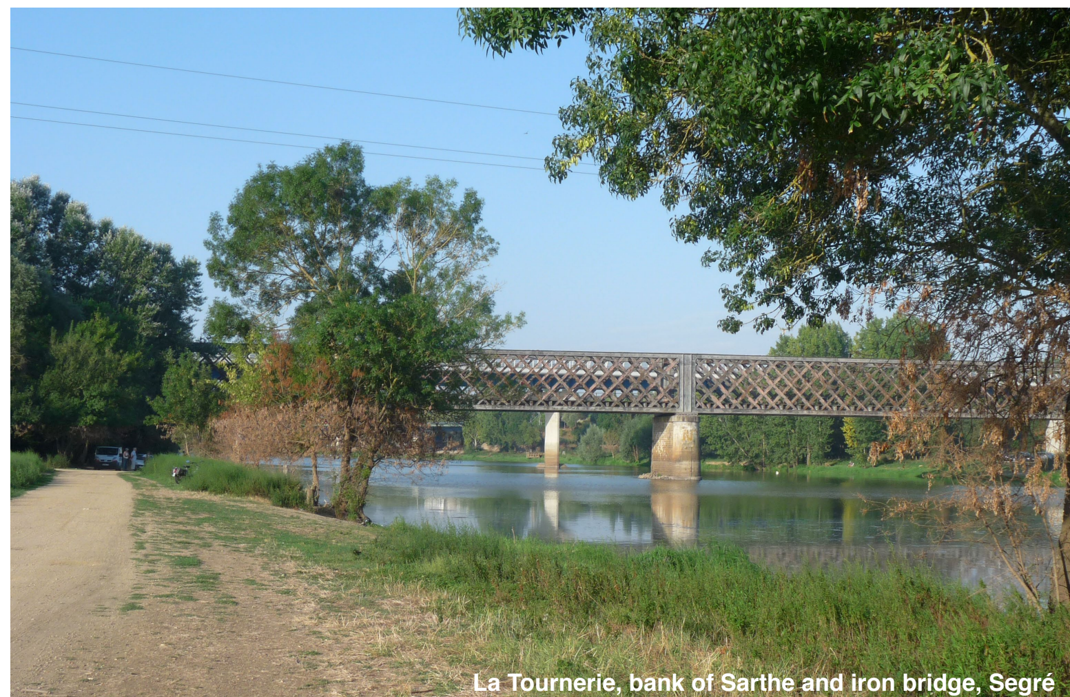
La Tournerie, bank of Sarthe and iron bridge, Segré