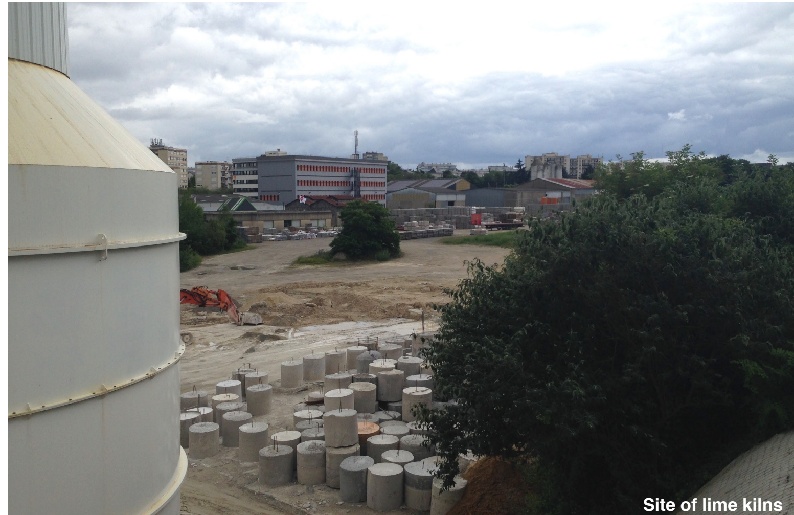
Site of lime kilns