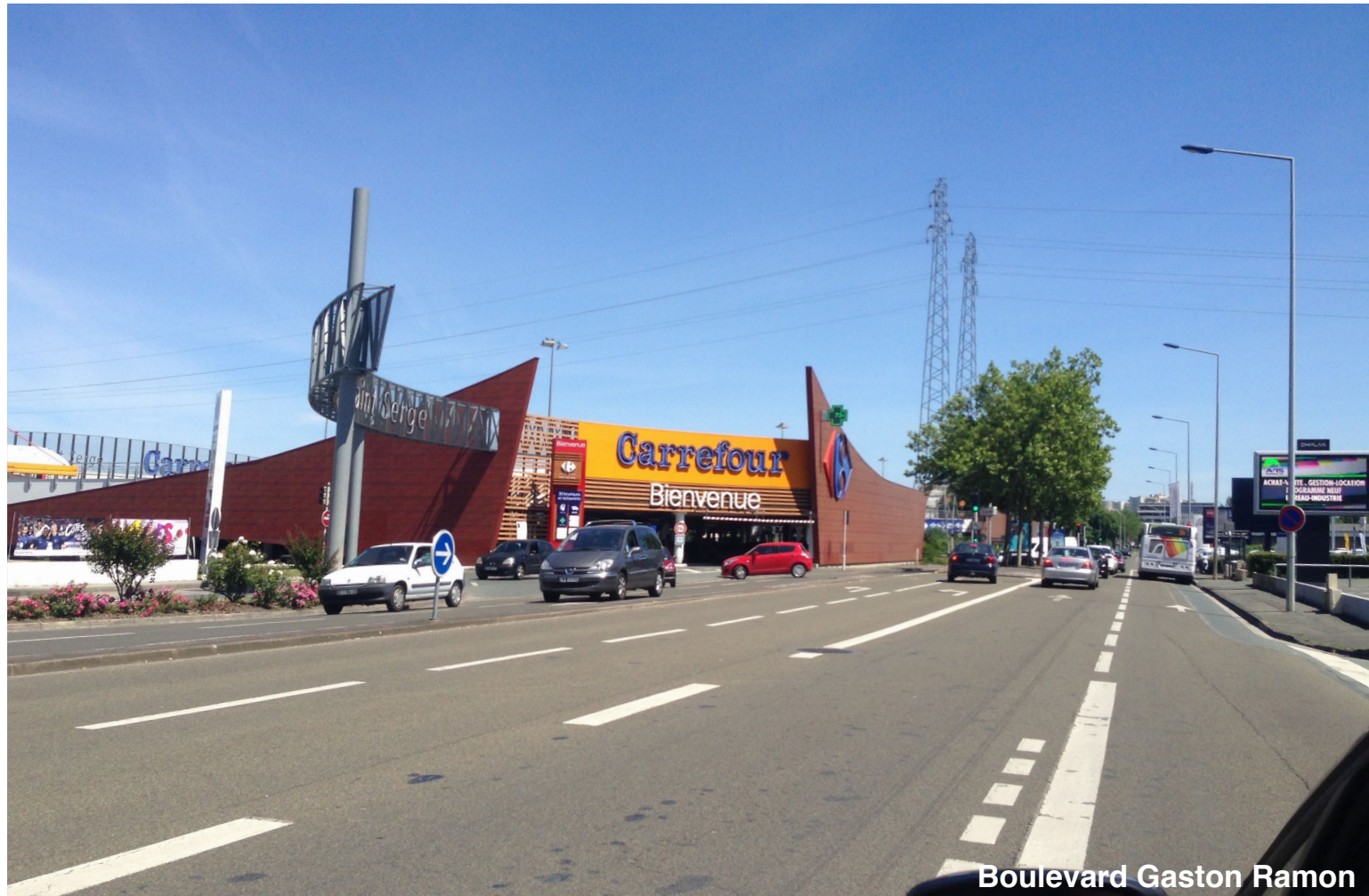
Boulevard Gaston Ramon