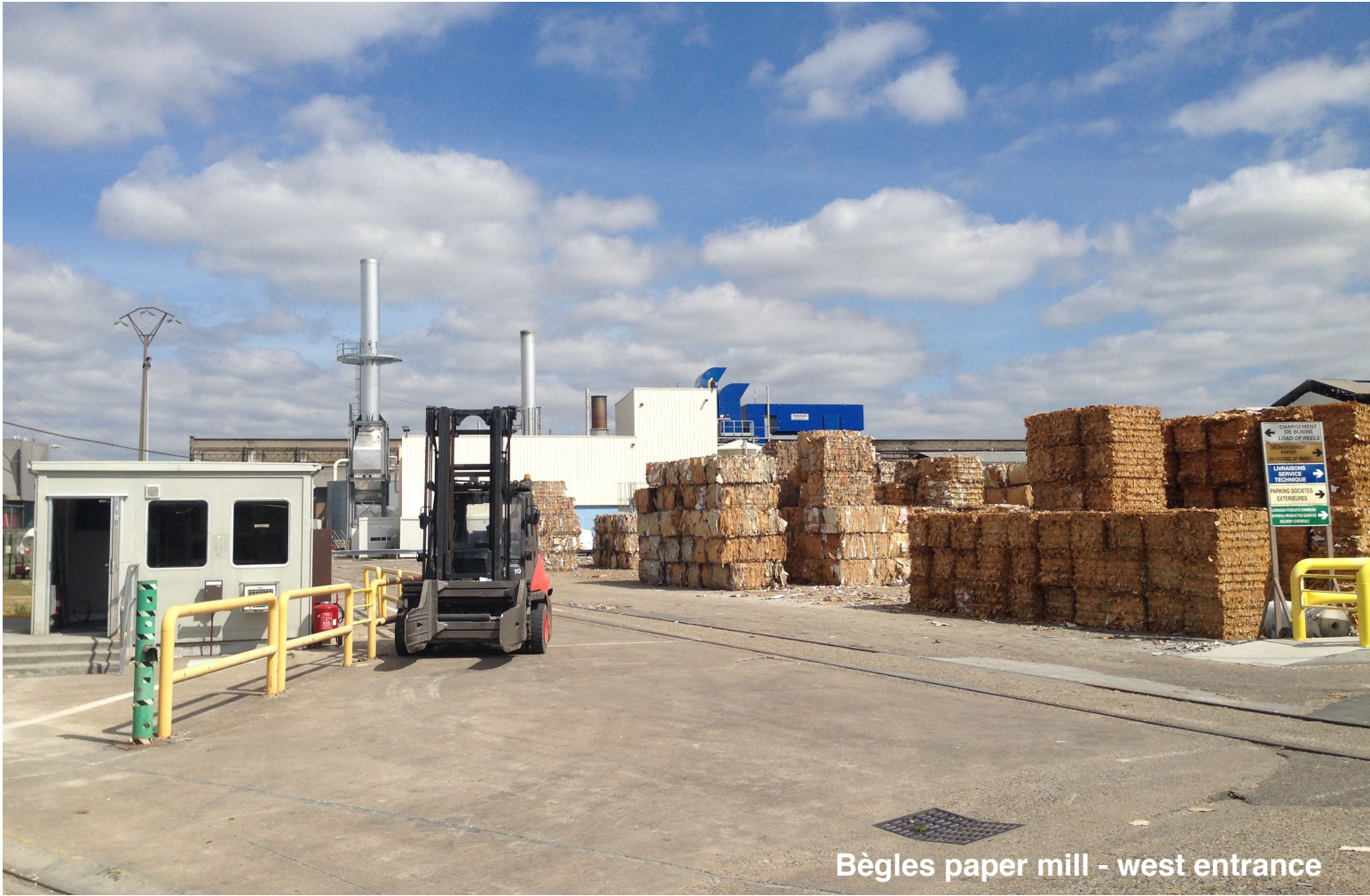
Bègles paper mill - west entrance