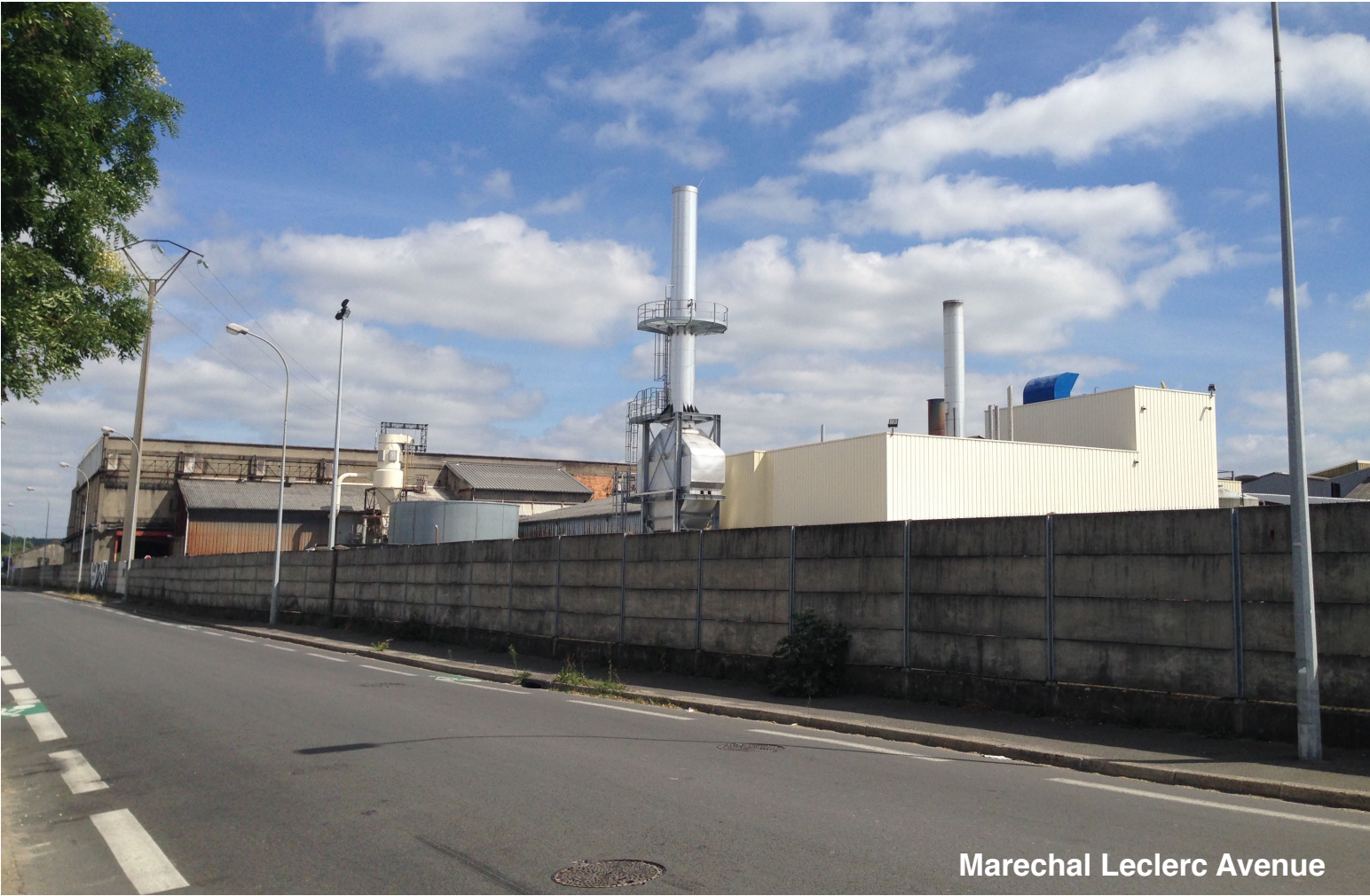
Marechal Leclerc Avenue