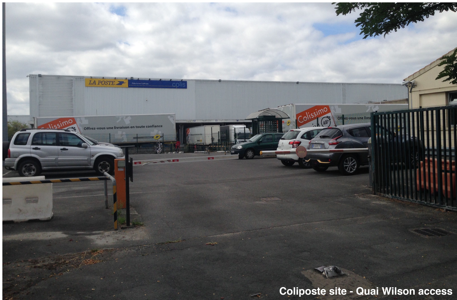
Coliposte site - Quai Wilson access