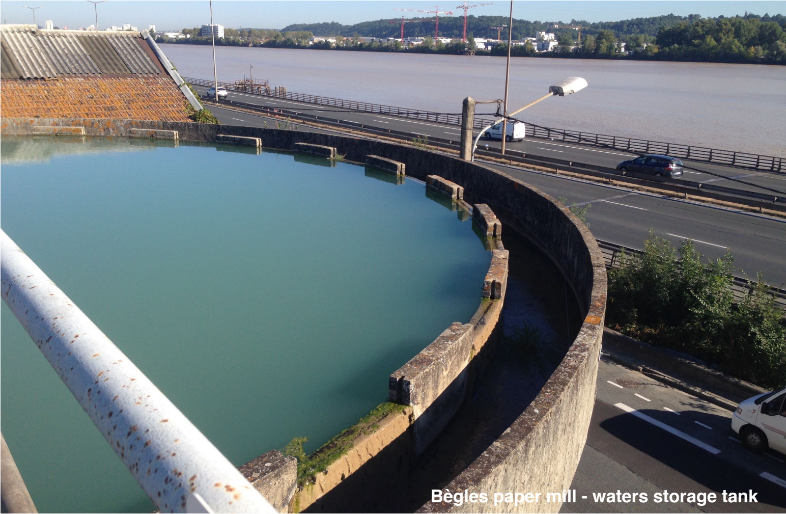
Bègles paper mill - waters storage tank