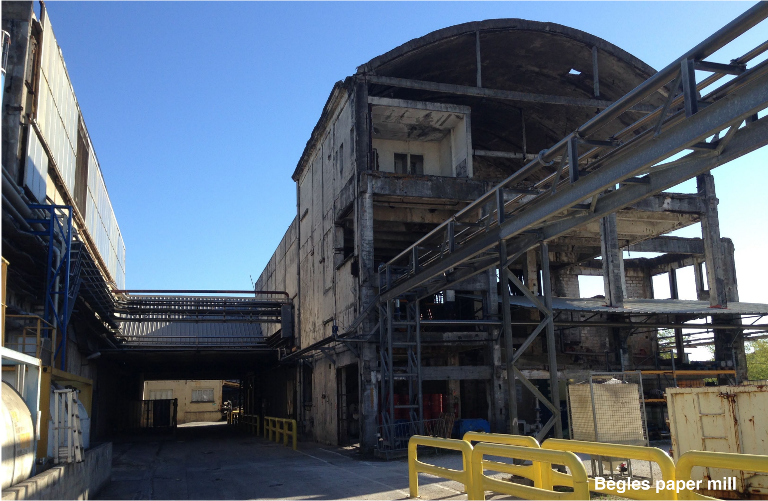
Bègles paper mill