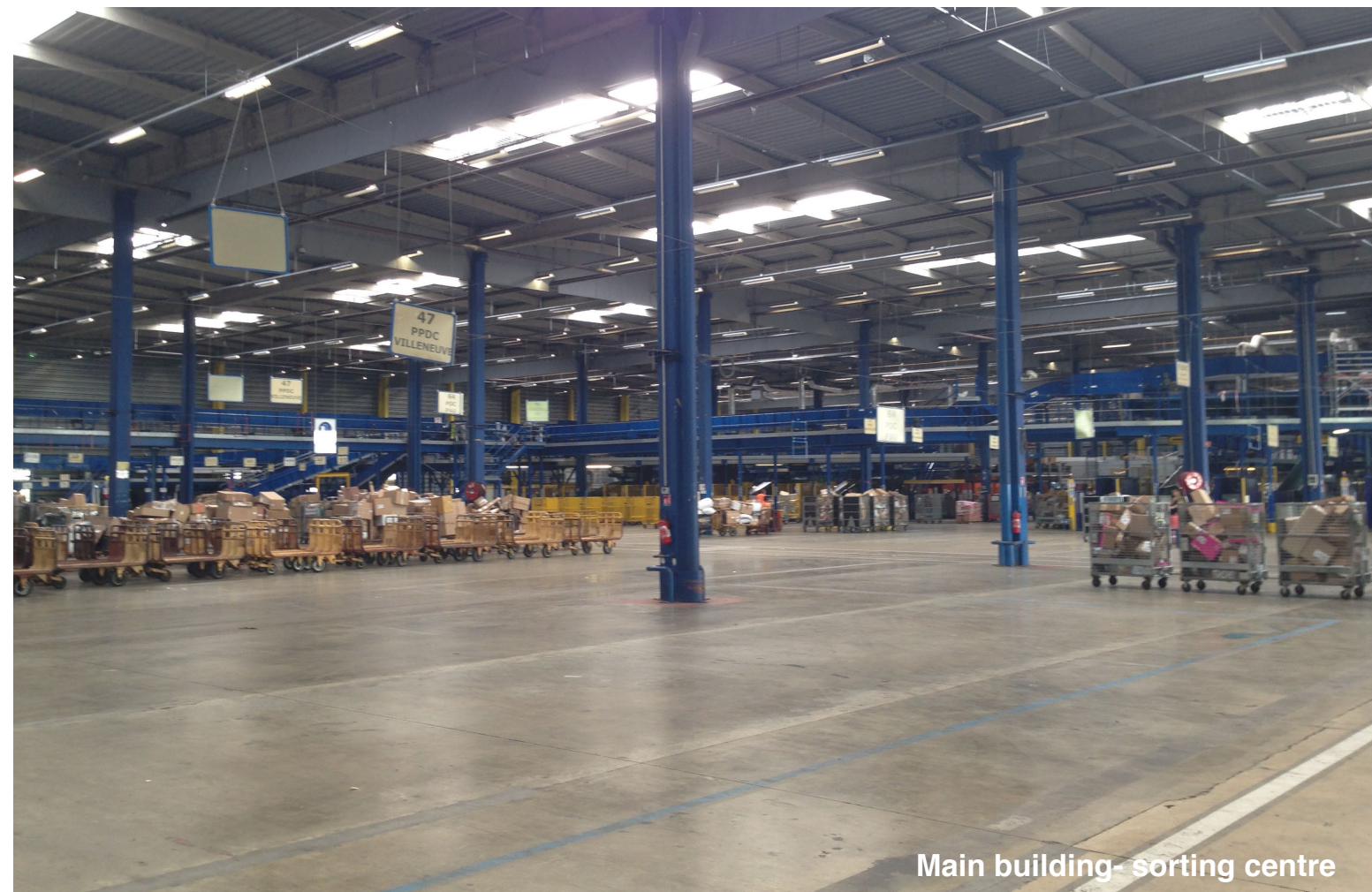
Main building- sorting centre