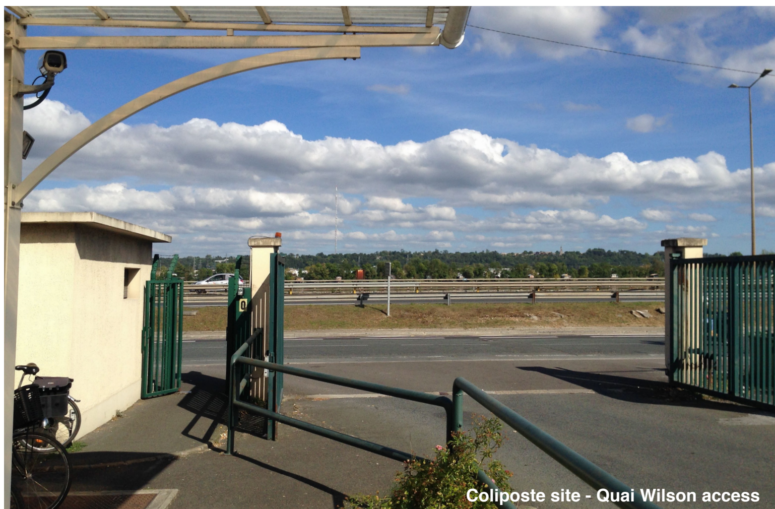
Coliposte site - Quai Wilson access