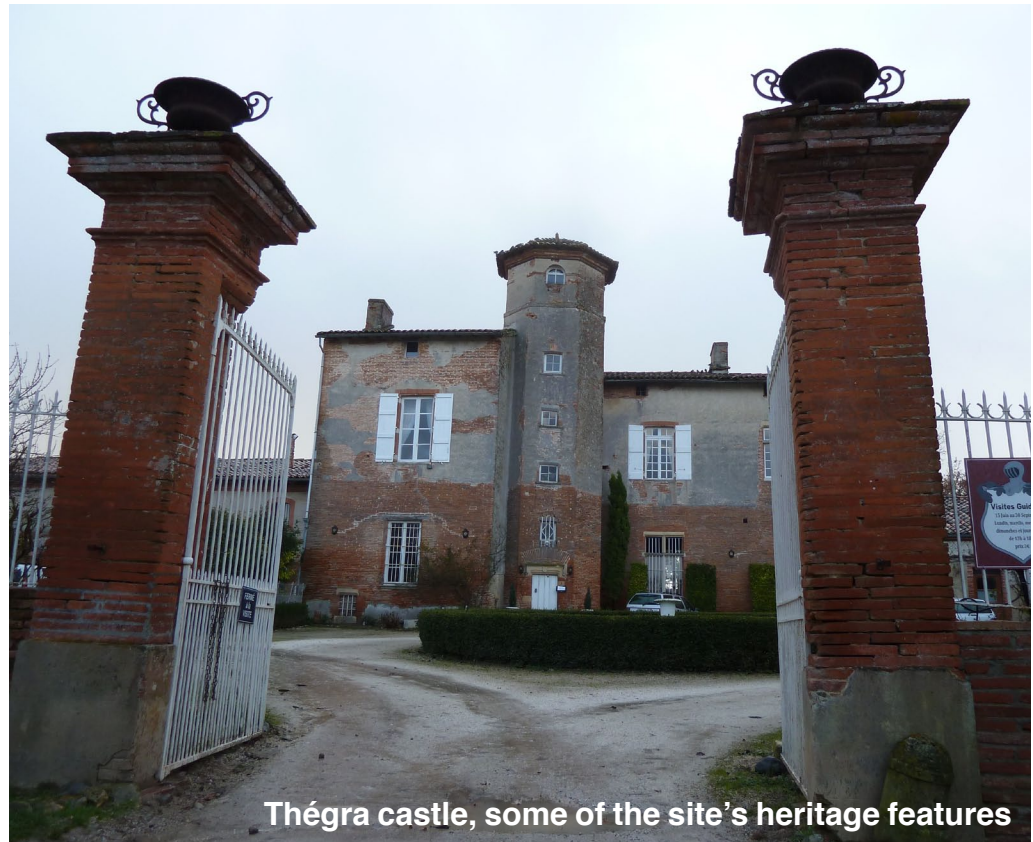
Thégra castle, some of the site's heritage features