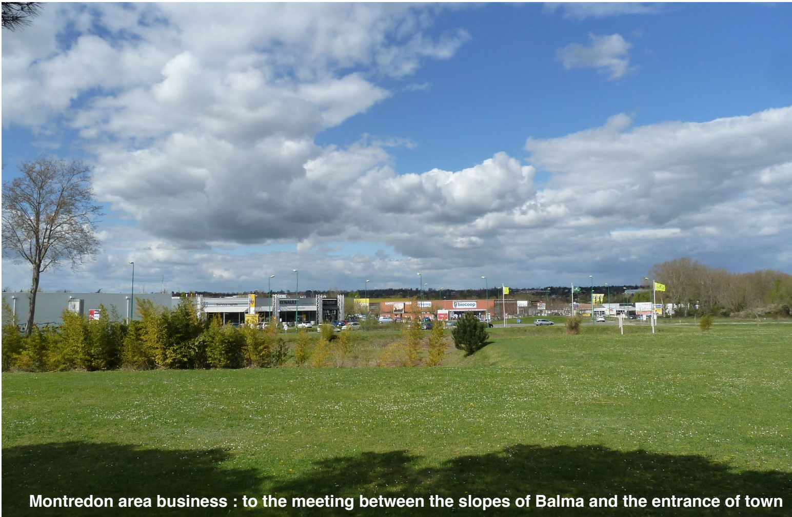
Montredon area business : to the meeting between the slopes of Balma and the entrance of town