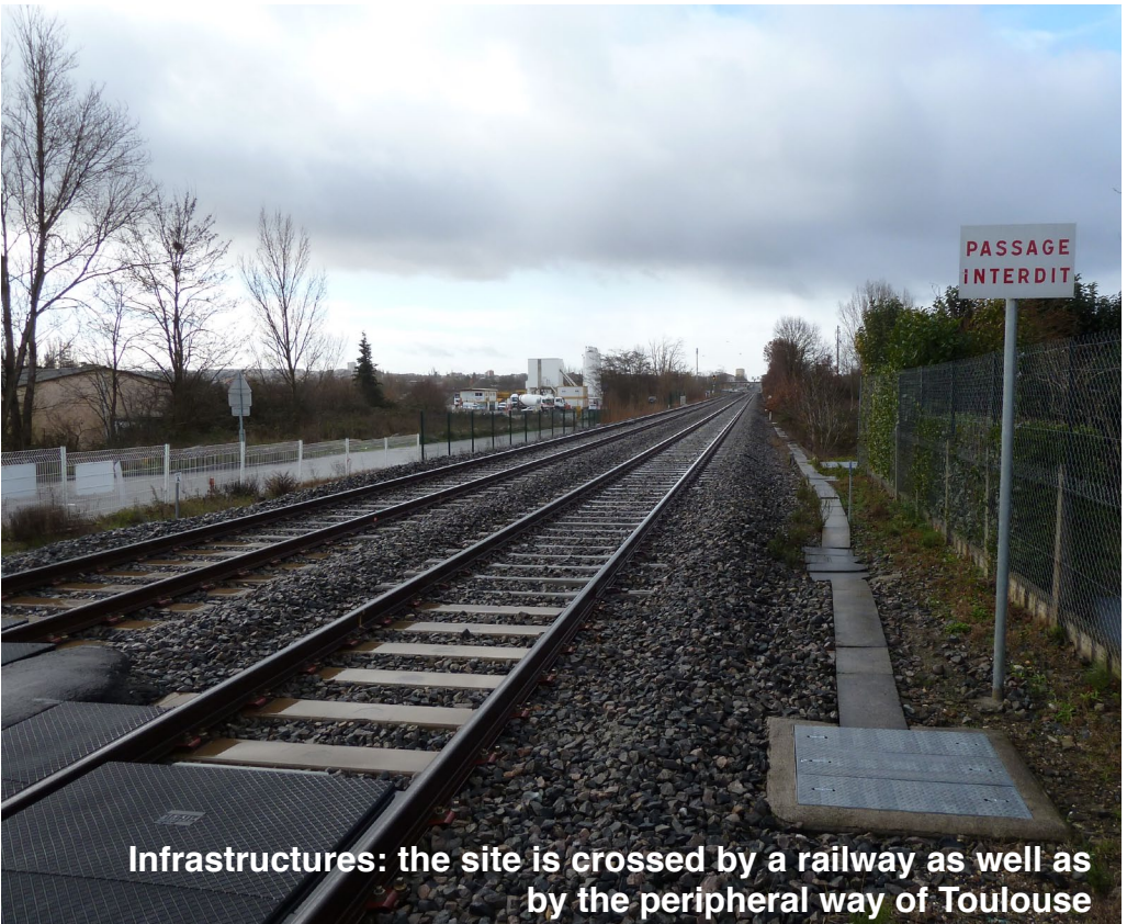
Infrastructures: the site is crossed by a railway as well as by the peripheral way of Toulouse