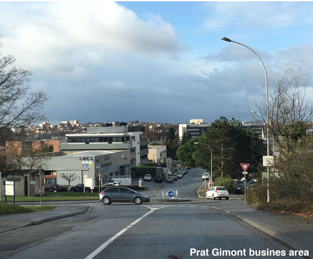
Prat Gimont busines area