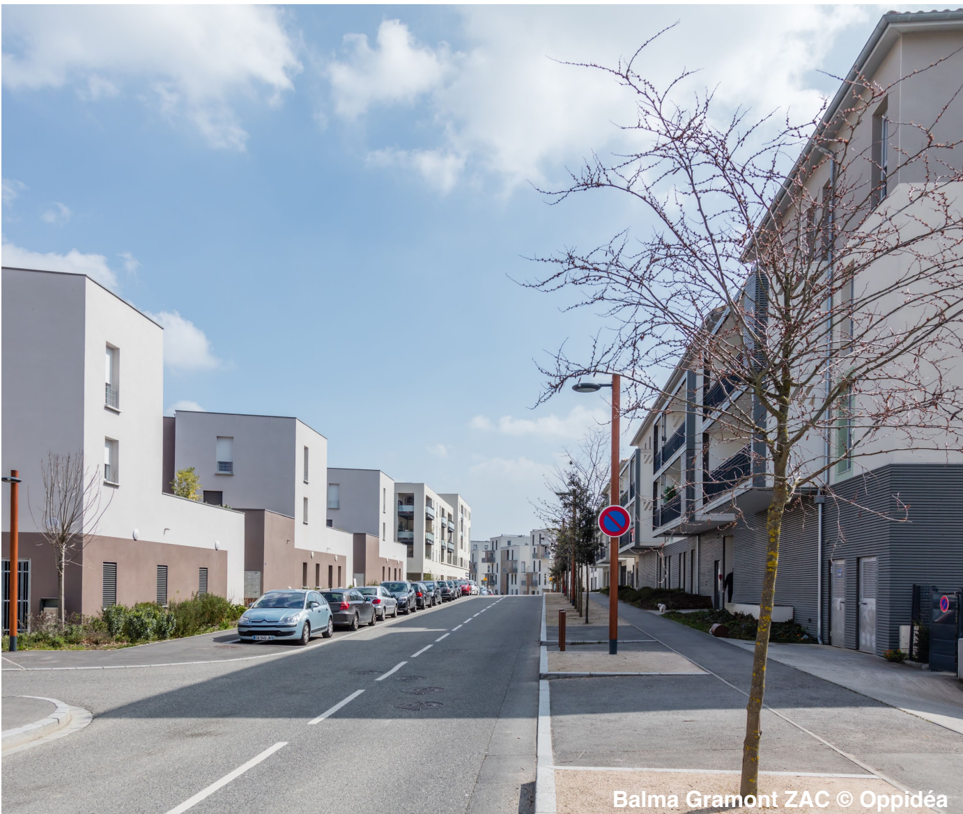
Balma Gramont ZAC