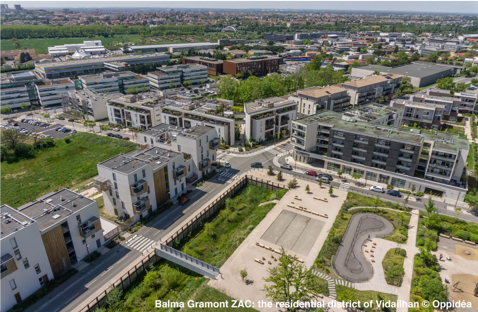
Balma Gramont ZAC: the residential district of Vidailhan