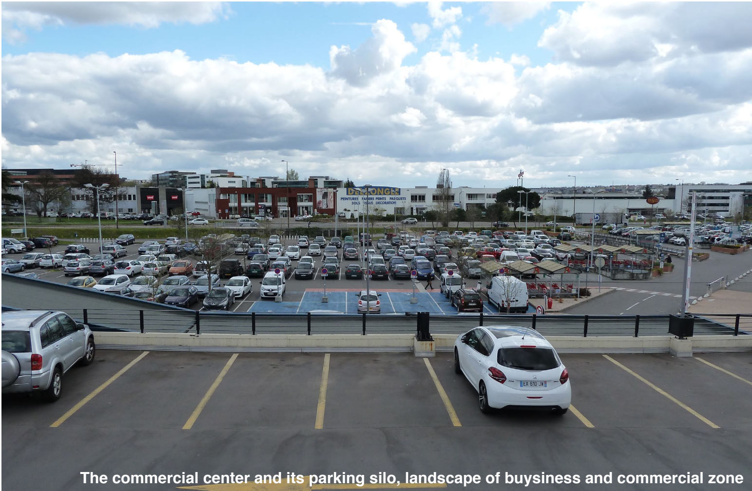
The commercial center and its parking silo, landscape of buysiness and commercial zone