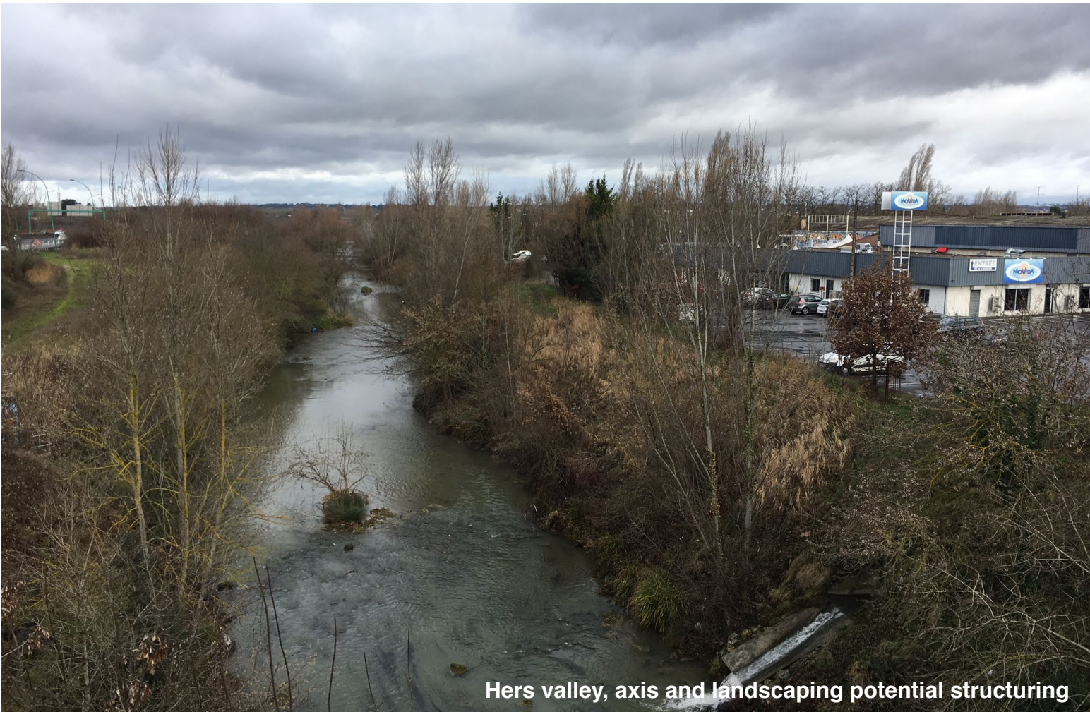
Hers valley, axis and landscaping potential structuring