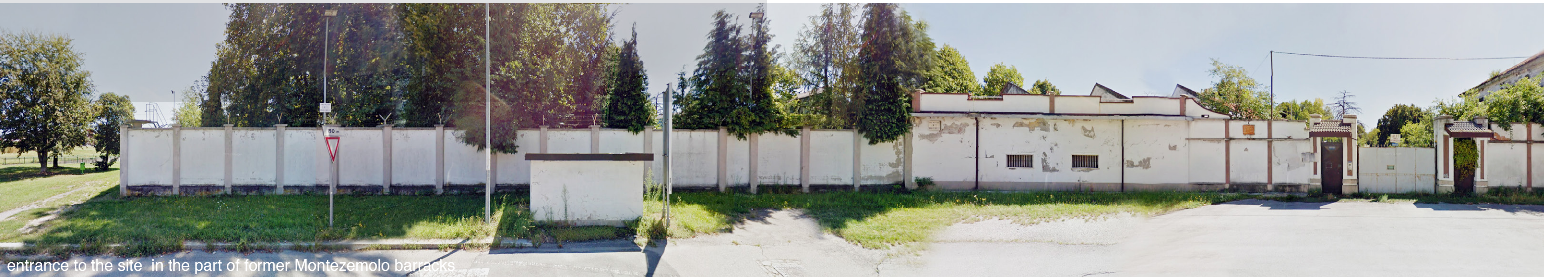
entrance to the site in the part of former Montezemolo barracks