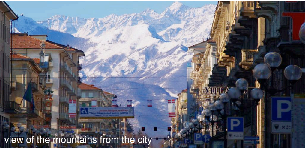
view of the mountains from the city