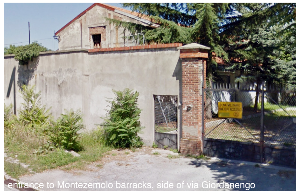
entrance to Montezemolo barracks, side of via Giordanengo