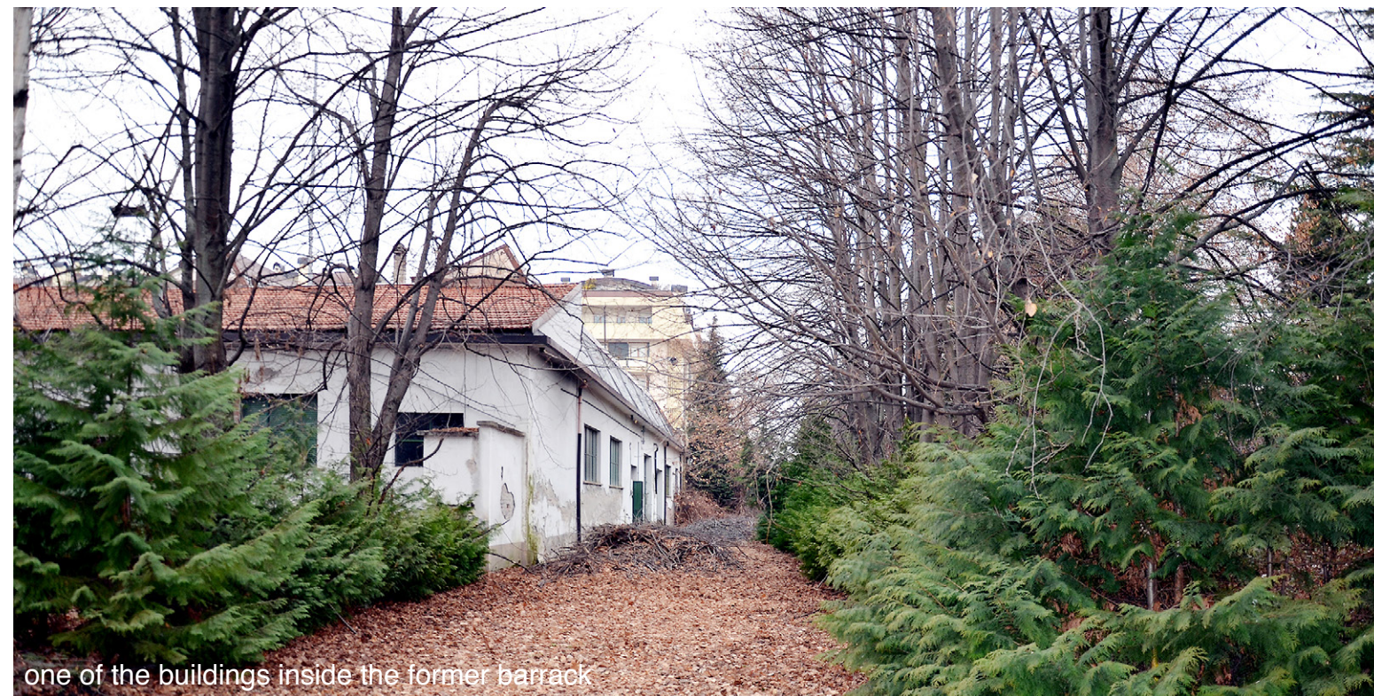
one of the buildings inside the former barracks