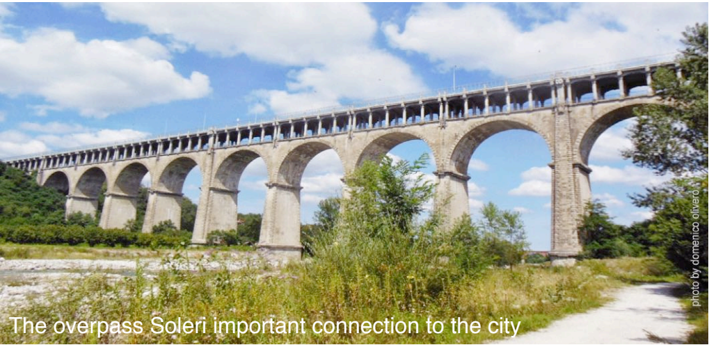
The overpass Soleri important connection to the city