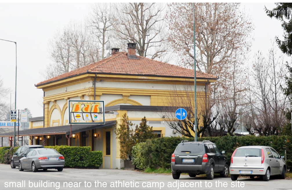
small building near to the athletic camp adjacent to the site