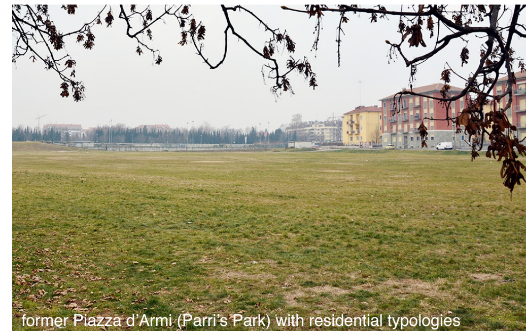
former Piazza d'Armi (Parri's Park) with residential typologies