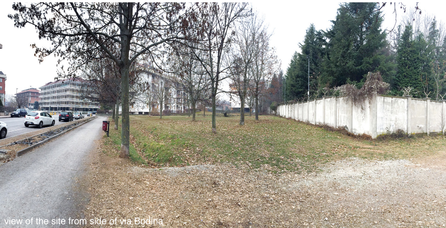
view of the site from side of via Bodina