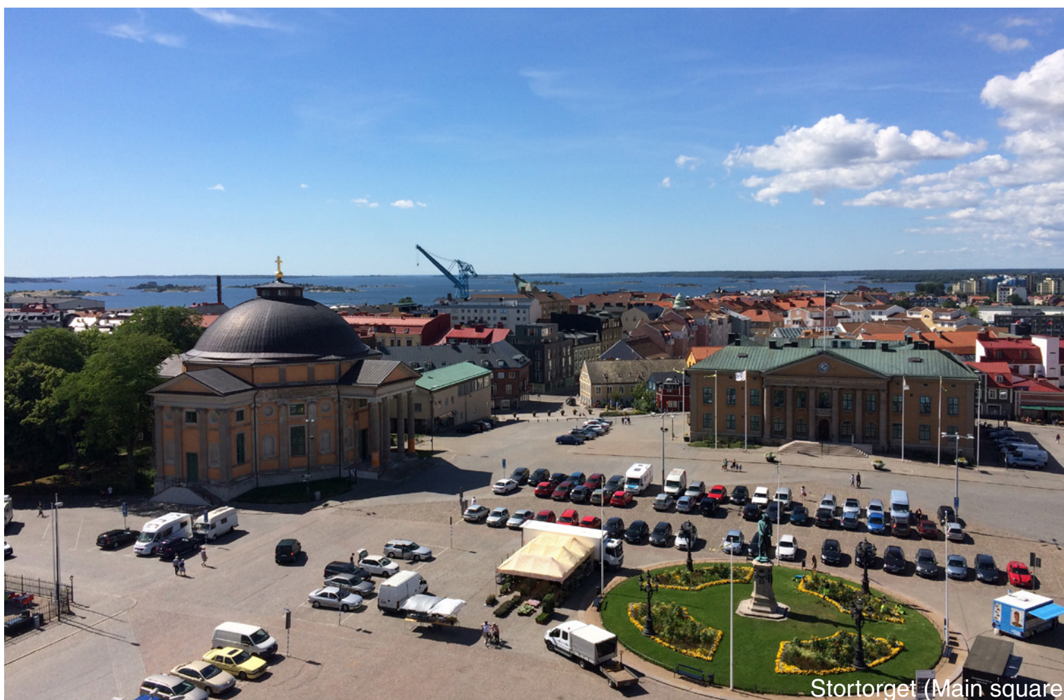
Stortorget (Main square)