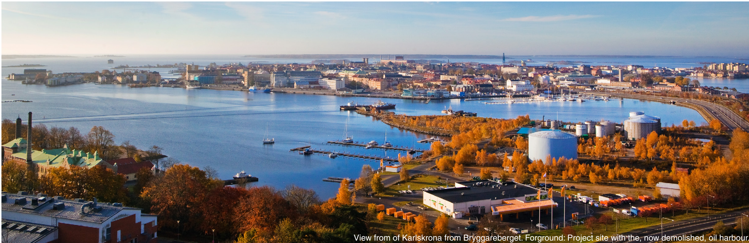
View from of Karlskrona from Bryggareberget. Forground: Project site with the, now demolished, oil harbour.