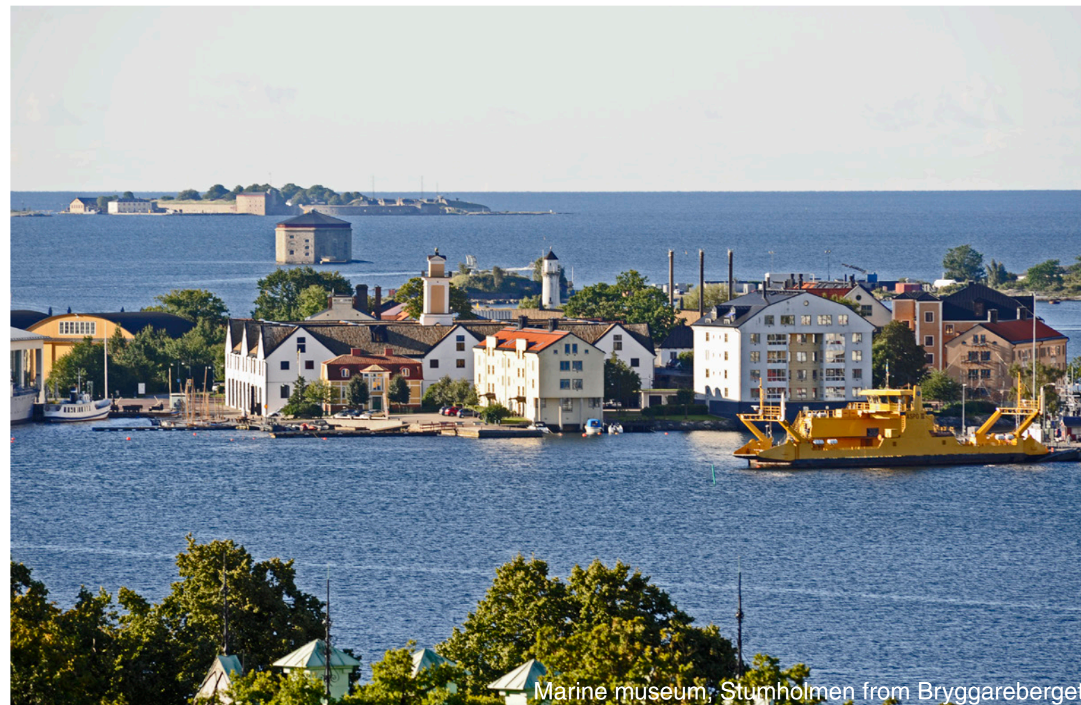
Marine museum, Stumholmen from Bryggareberget