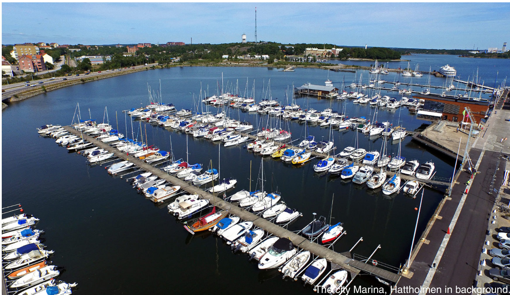
The city Marina, Hattholmen in background.