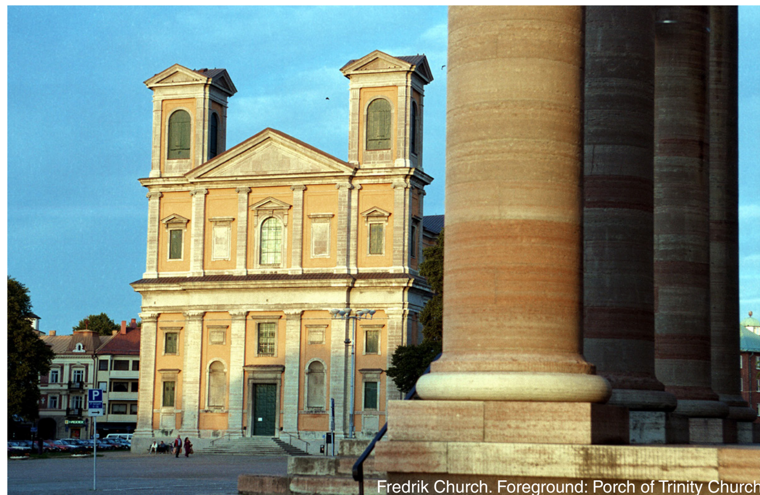
Fredrik Church. Foreground: Porch of Trinity Church