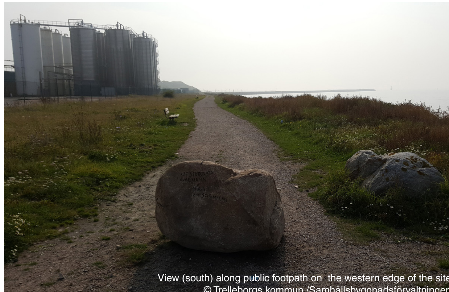
View (south) along public footpath on the western edge of the site