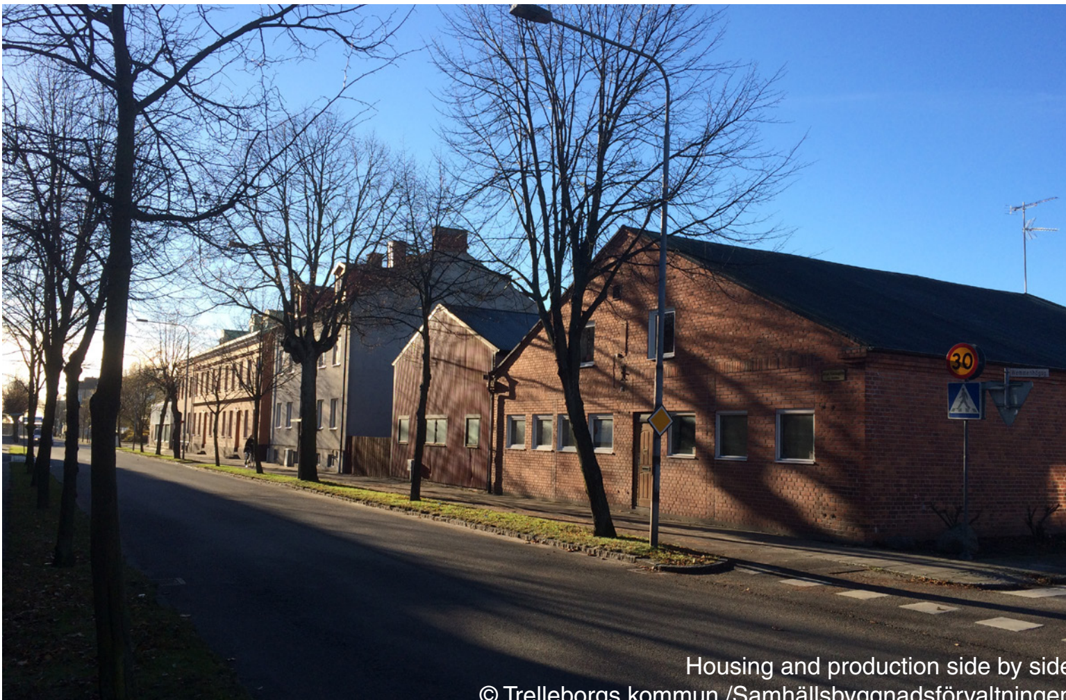
Housing and production side by side