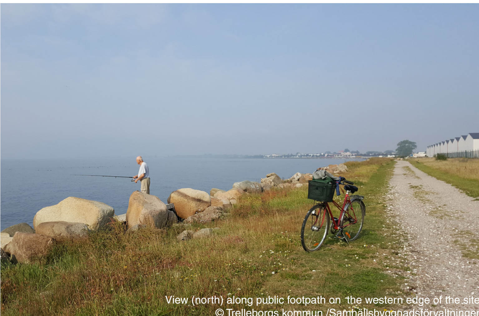
View (north) along public footpath on the western edge of the site.