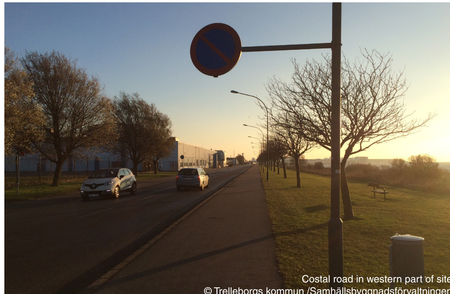
Costal road in western part of site