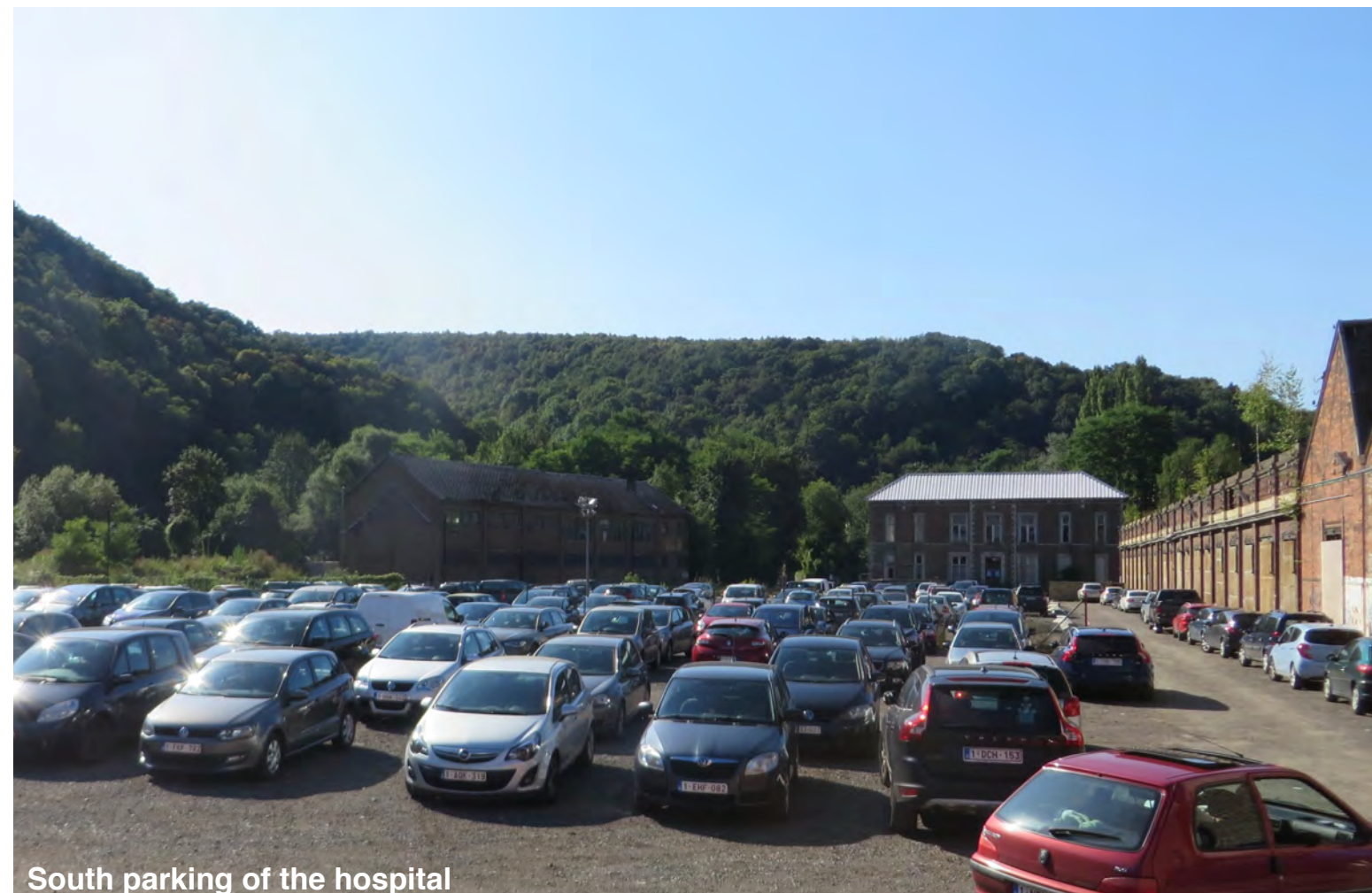
South parking of the hospital