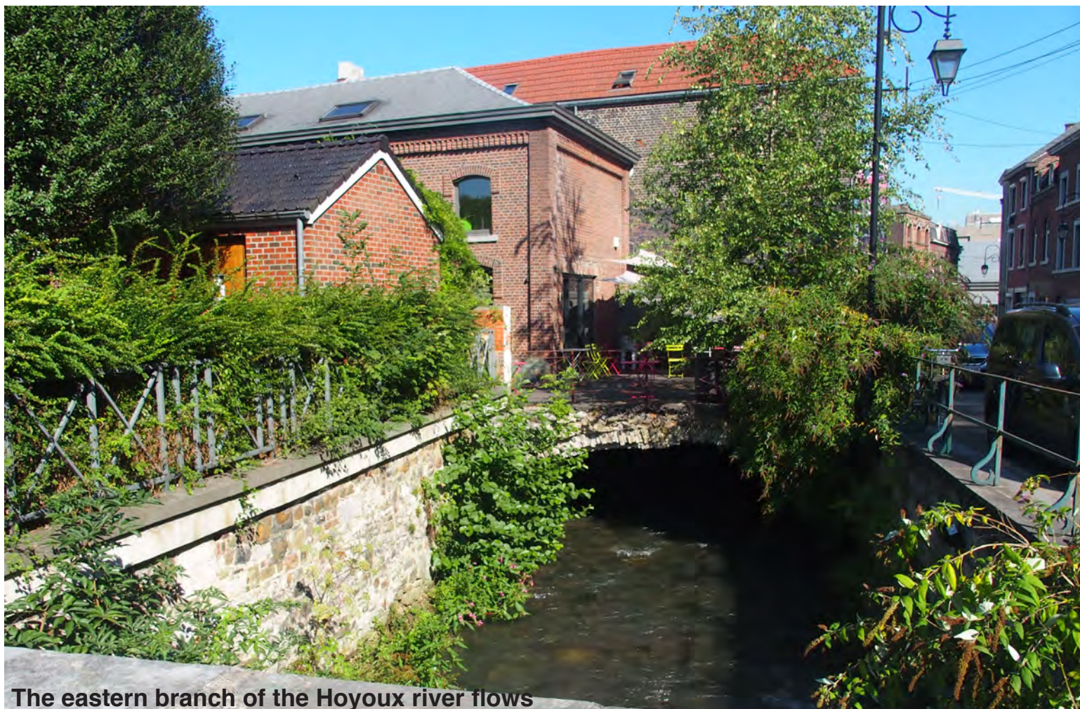
The eastern branch of the Hoyoux river flows