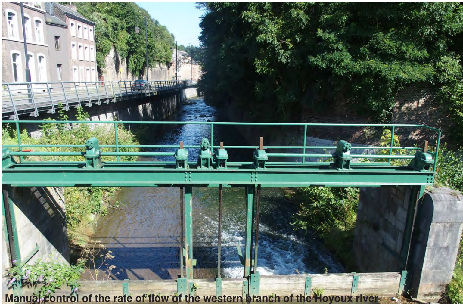
Manual control of the rate of flow of the western branch of the Hoyoux river