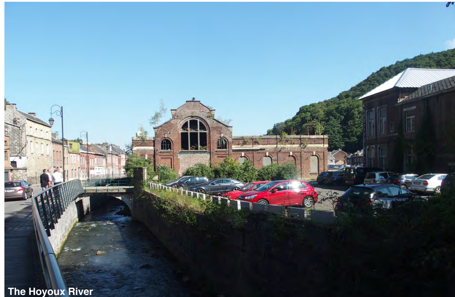
The Hoyoux River