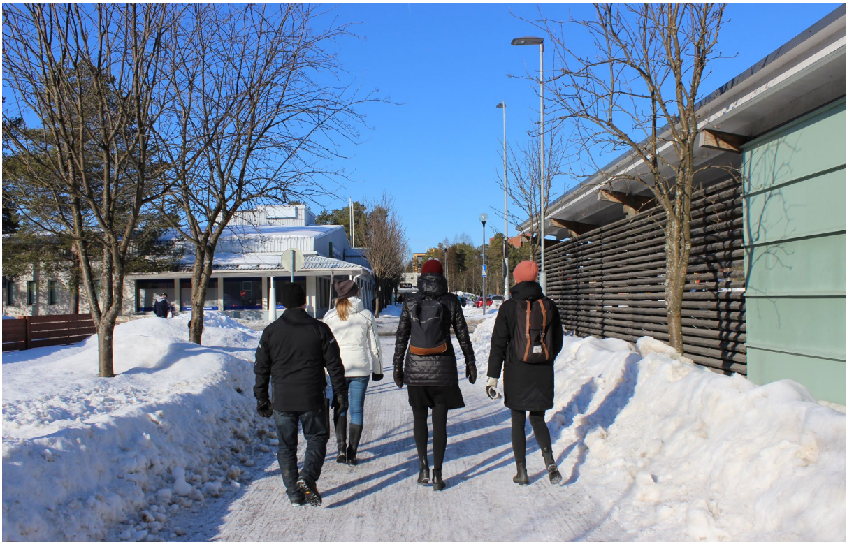
Walking by the Kaijonharju shopping center.

A: Parking and public transportation solutions will be improved. Competitors can propose solutions that differ from the current parking requirements if well presented and justified.