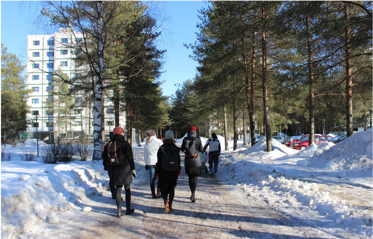
Pedestrian path from Linnanmaa to Kaijonharju.