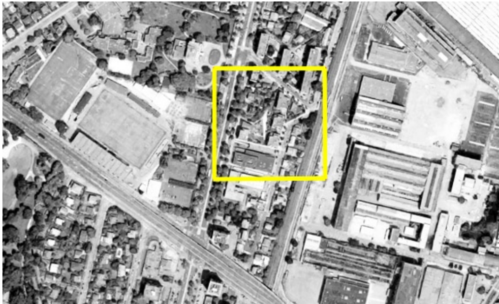
Various road scales along the site

The new site for implementation in Grenoble, between the Drac and the Cours de la Libération