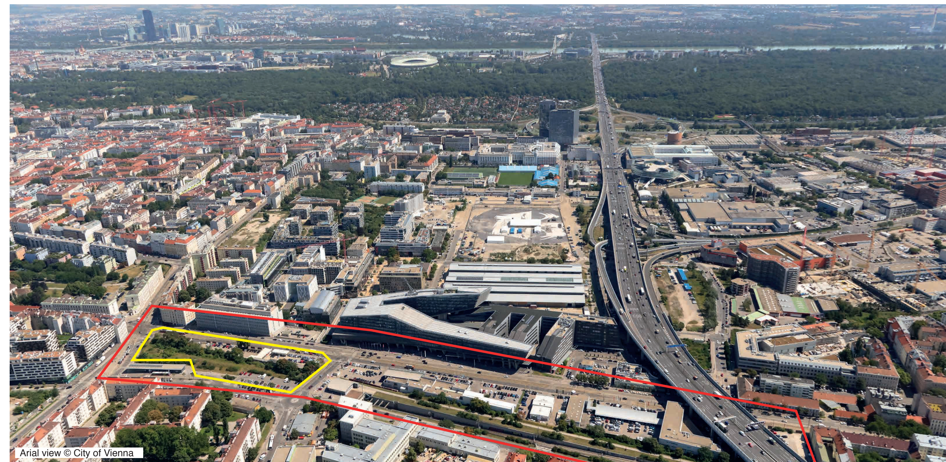
Aerial view © City of Vienna

SCALES: L/S - urban + architecture / architecture + context