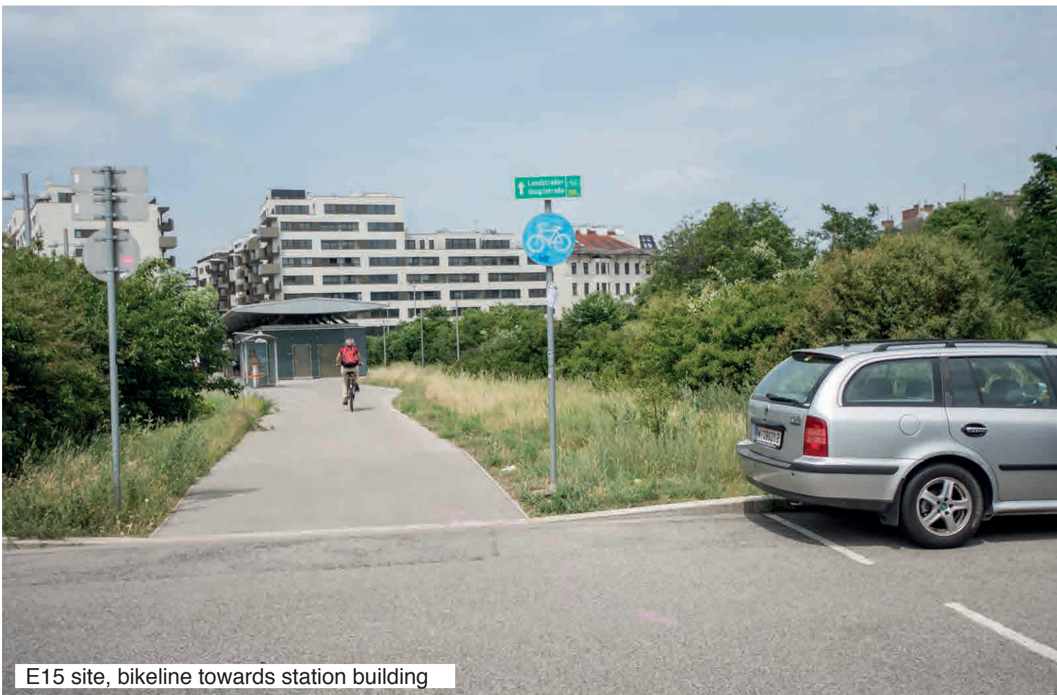
E15 site, bikeline towards station building