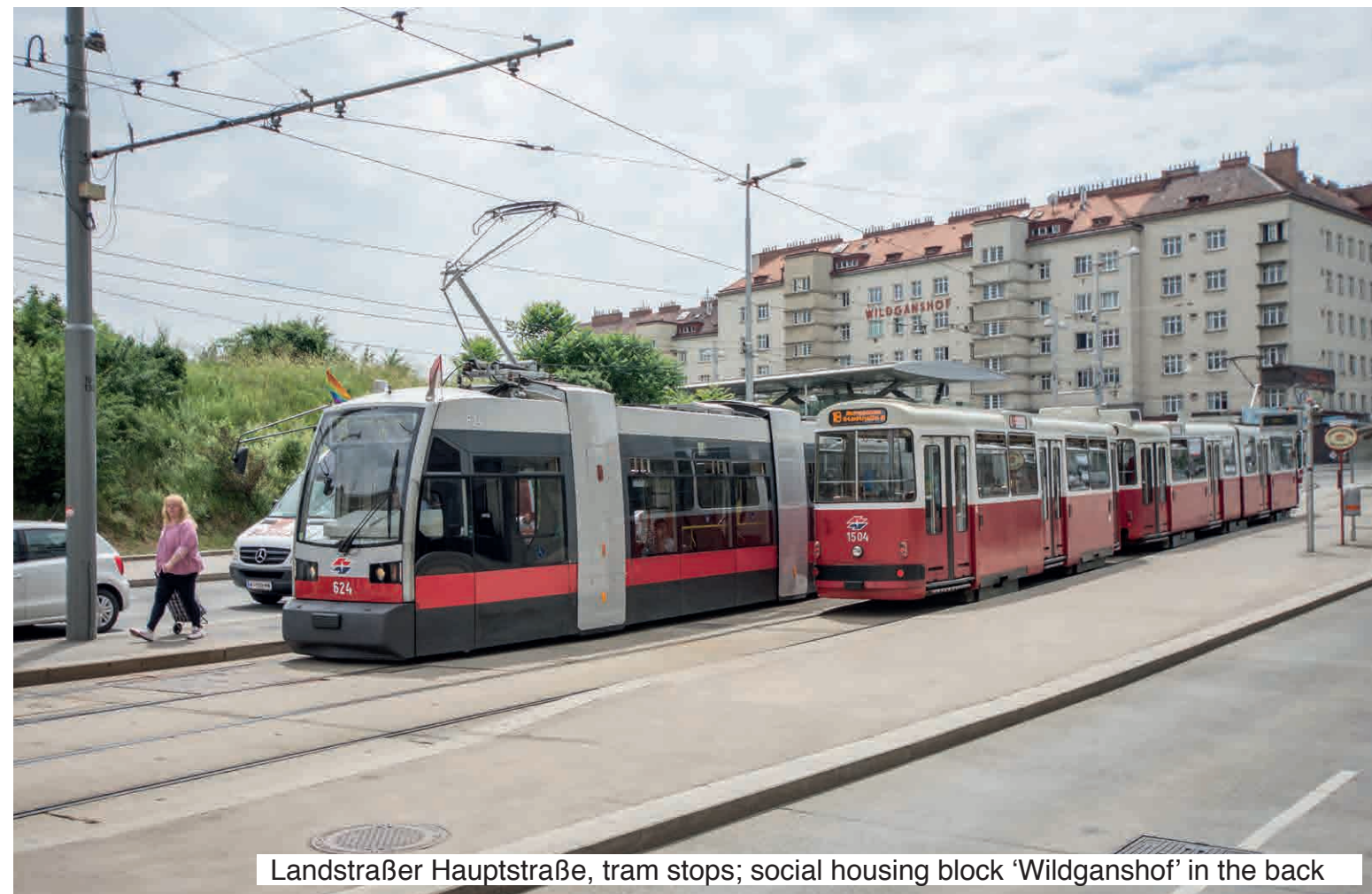
Landstraßer Hauptstraße, tram stops; social housing block 'Wildganshof' in the back