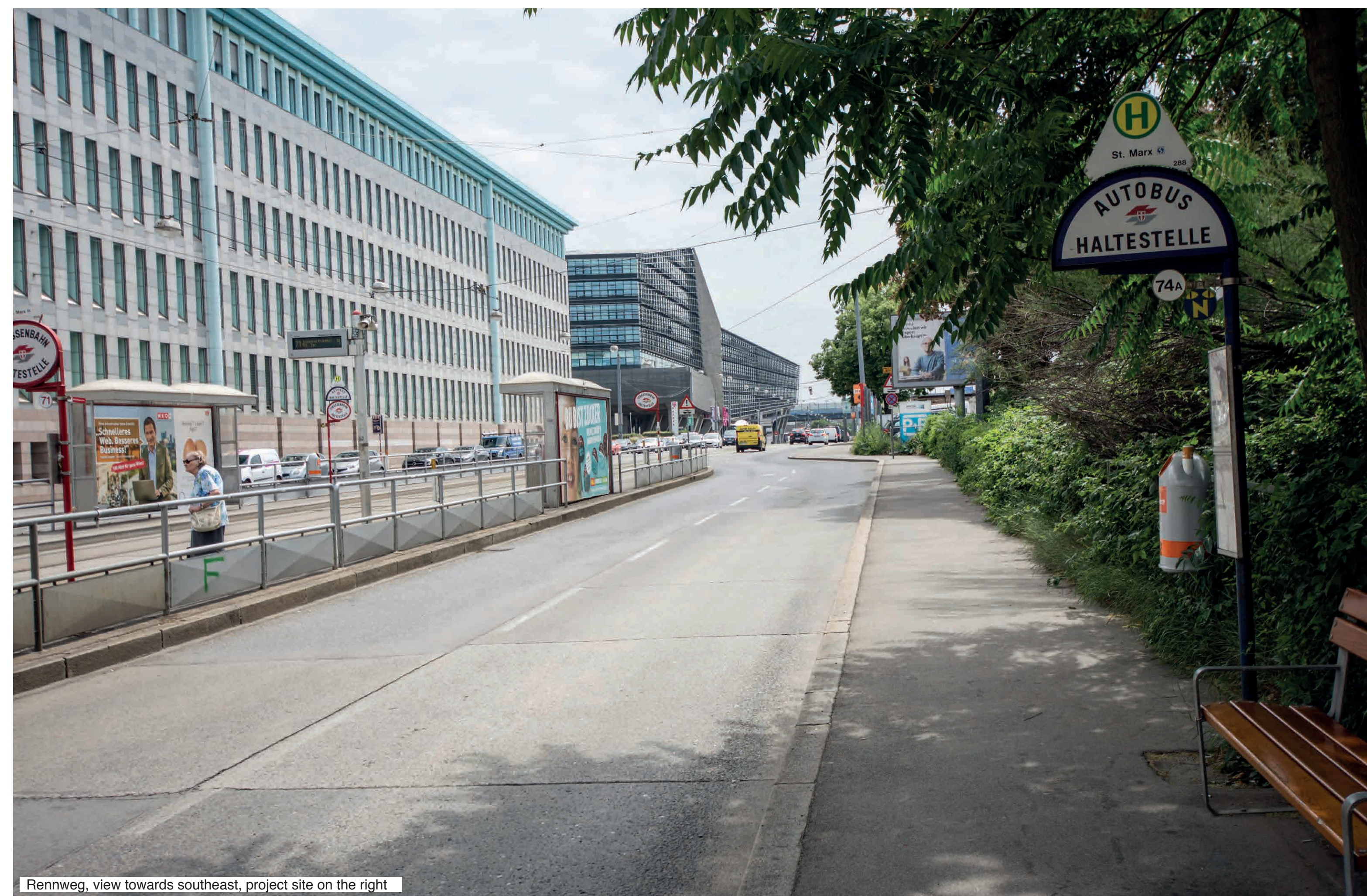
Rennweg, view towards southeast, project site on the right