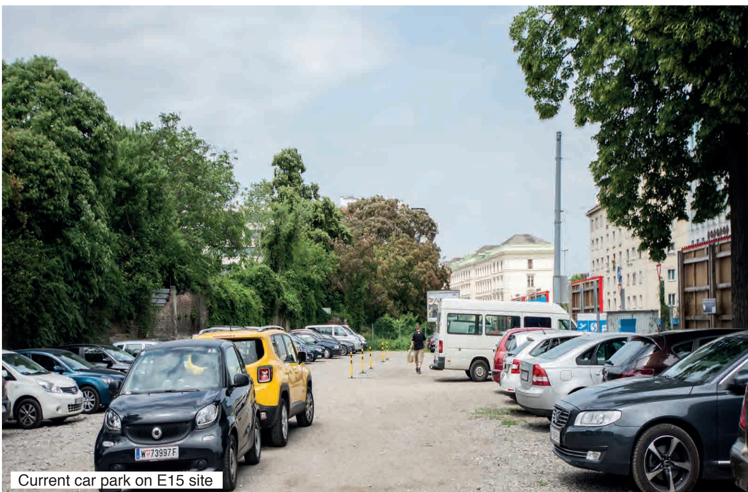
Current car park on E15 site