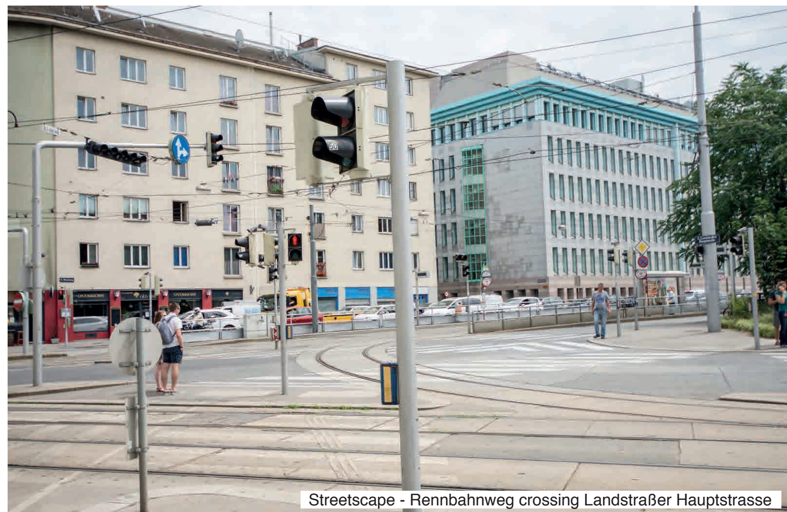
Streetscape - Rennbahnweg crossing Landstraßer Hauptstrasse