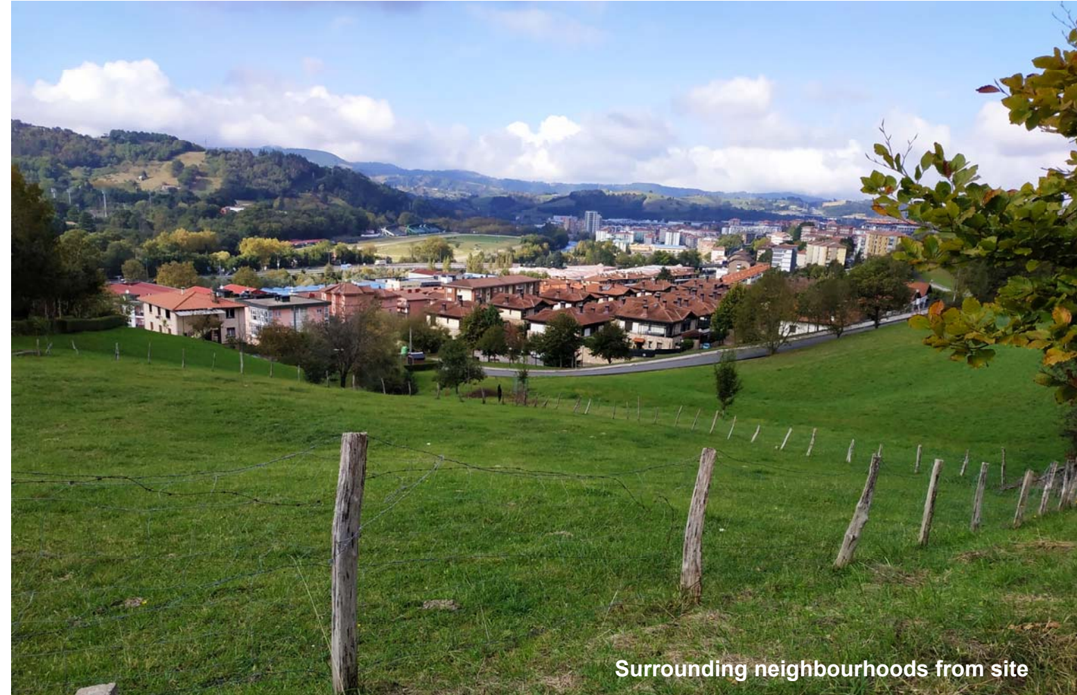
Surrounding neighbourhoods from site