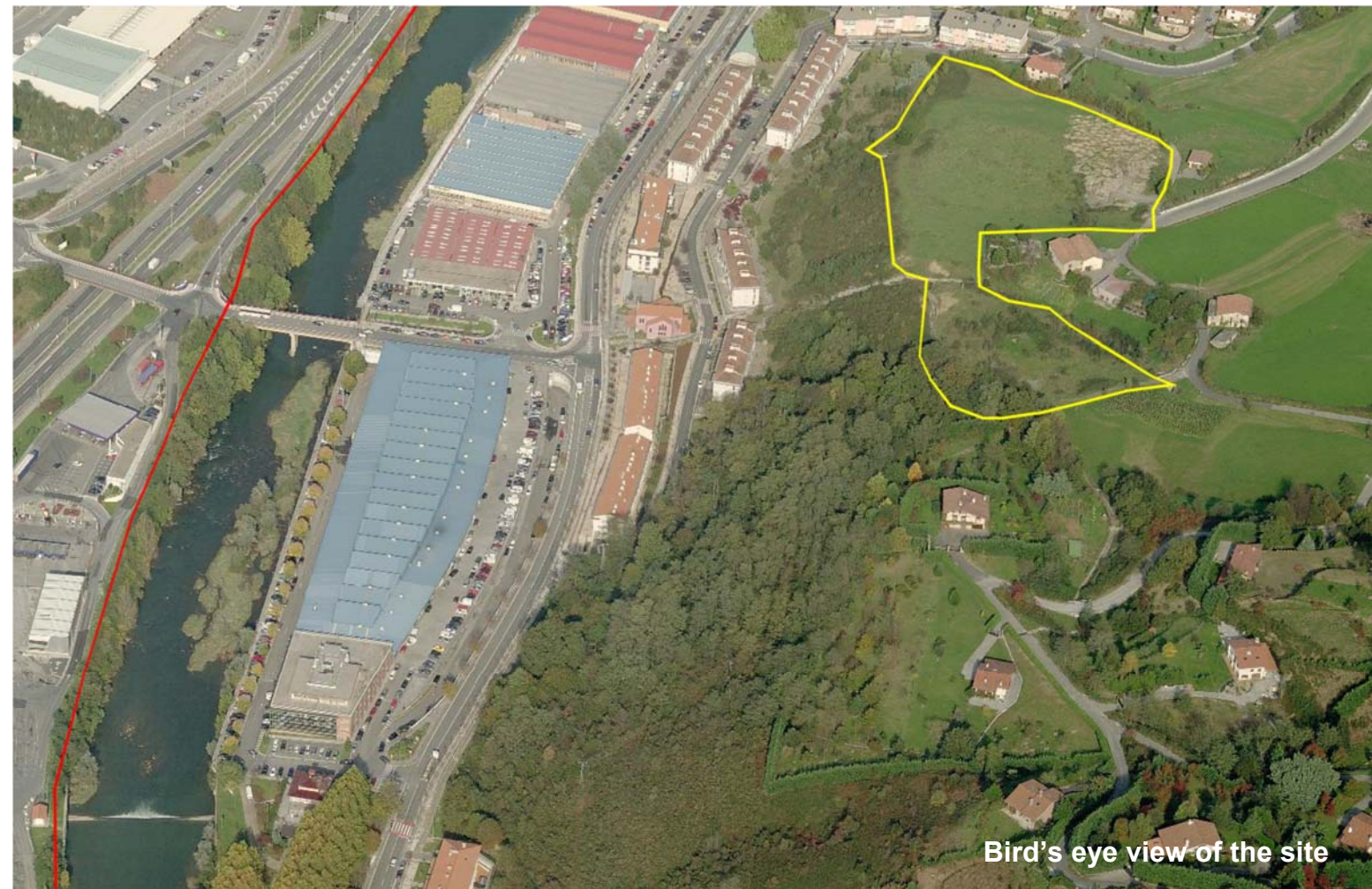
Bird's eye view of the site