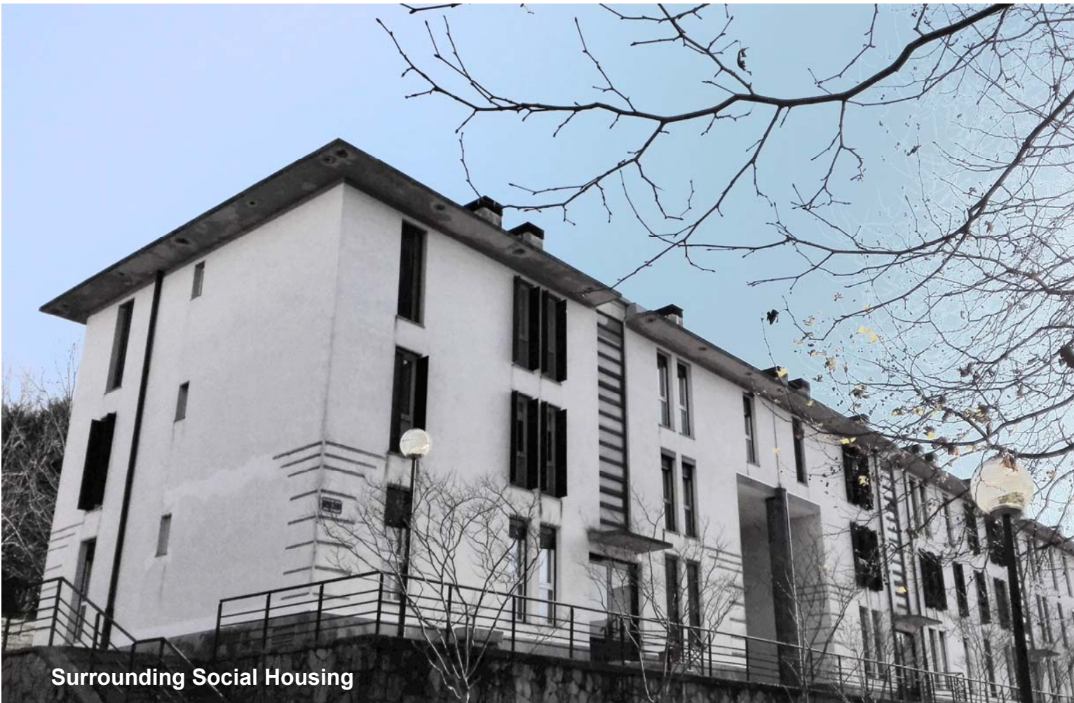
Surrounding Social Housing