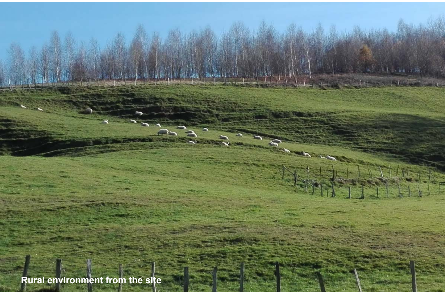
Rural environment from the site