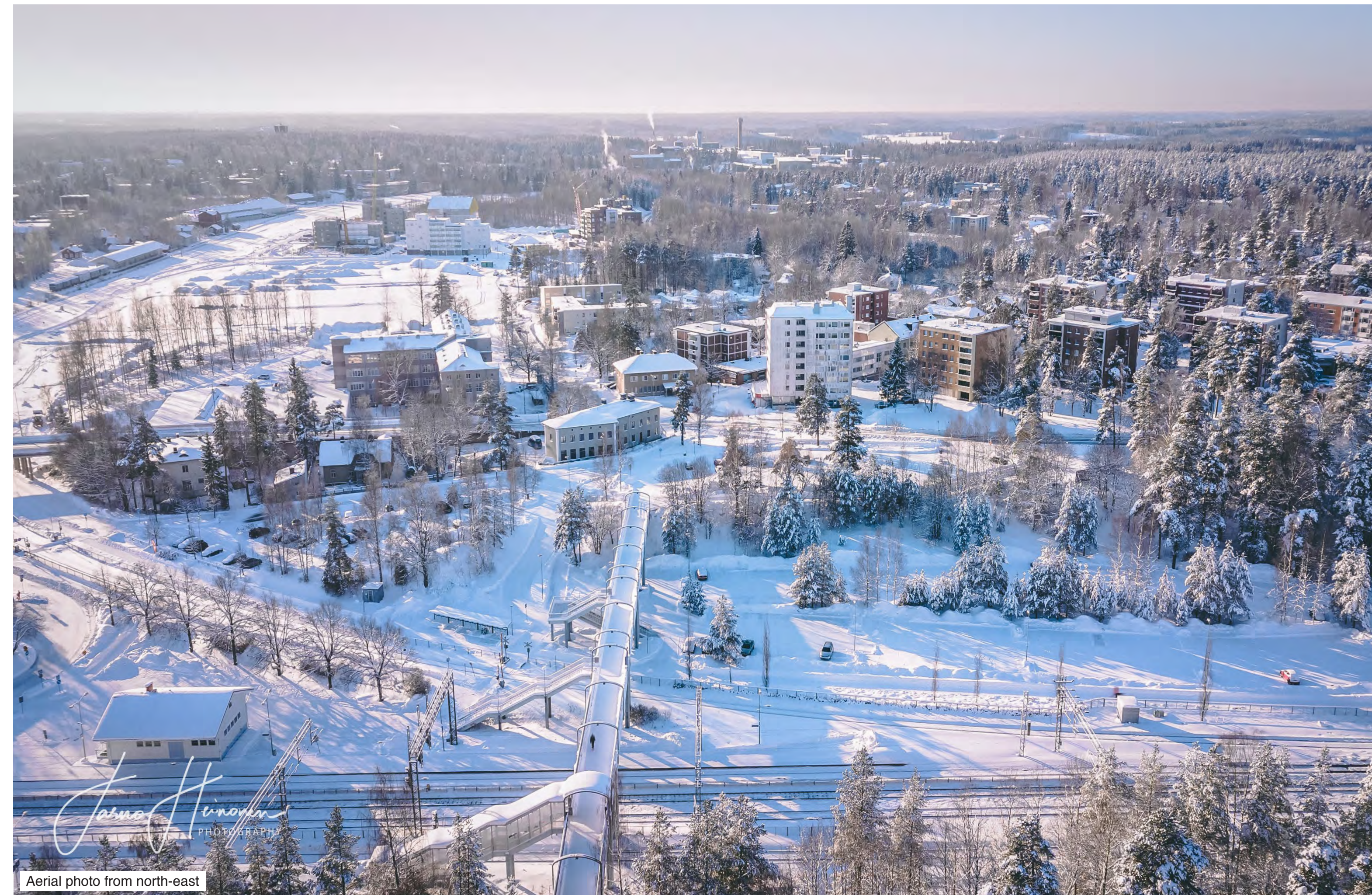
Aerial photo from north-east