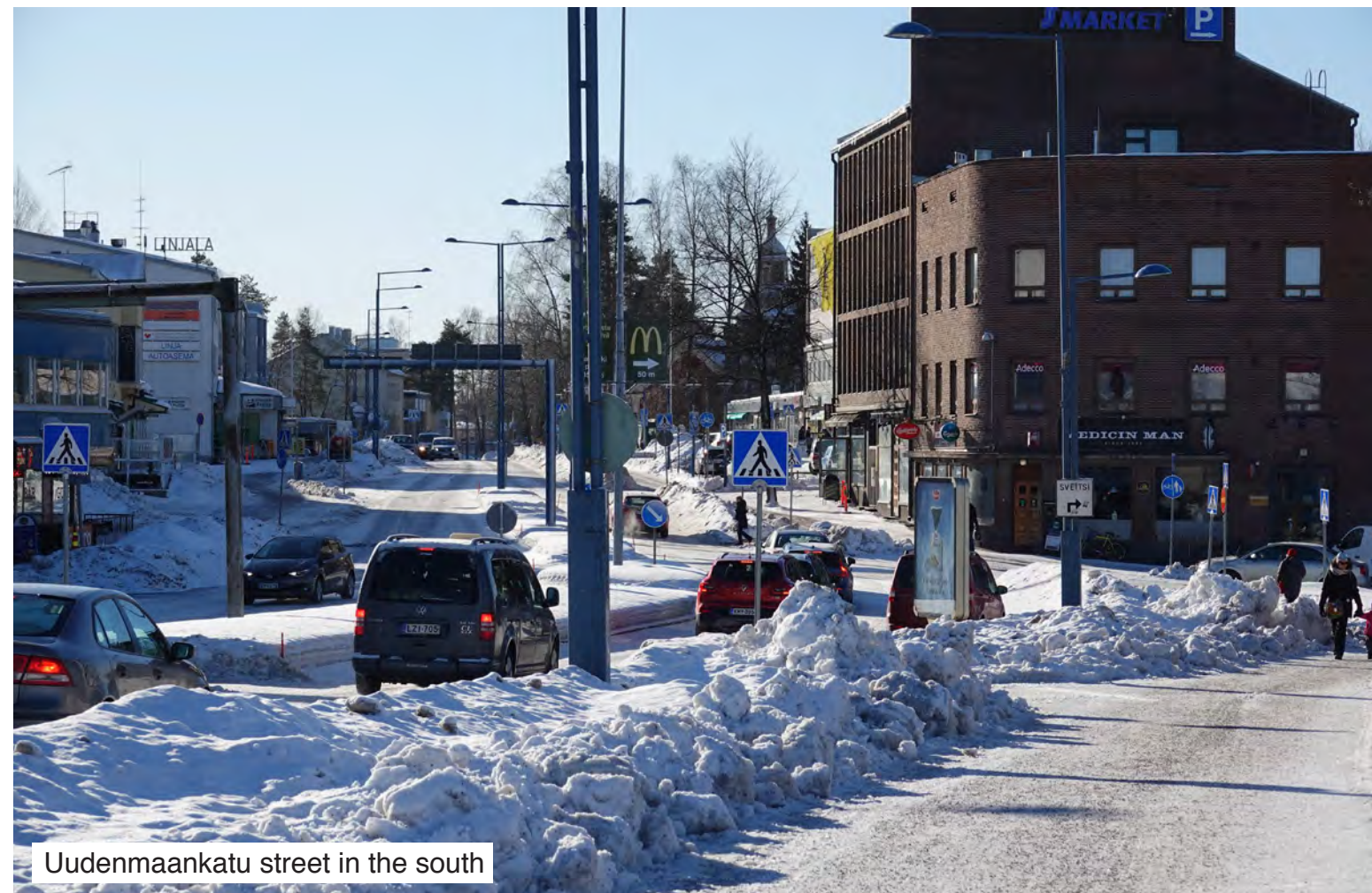
Uudenmaankatu street in the south