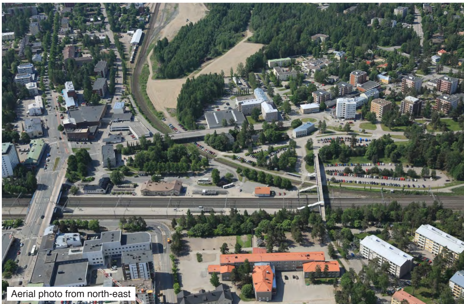
Aerial photo from north-east