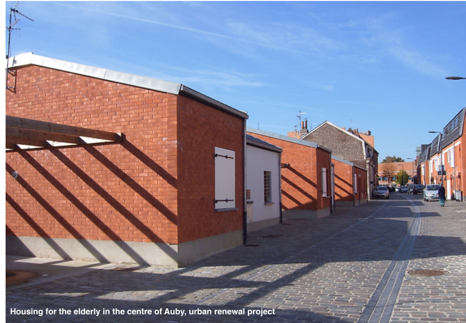
Housing for the elderly in the centre of Aubry, urban renewal project