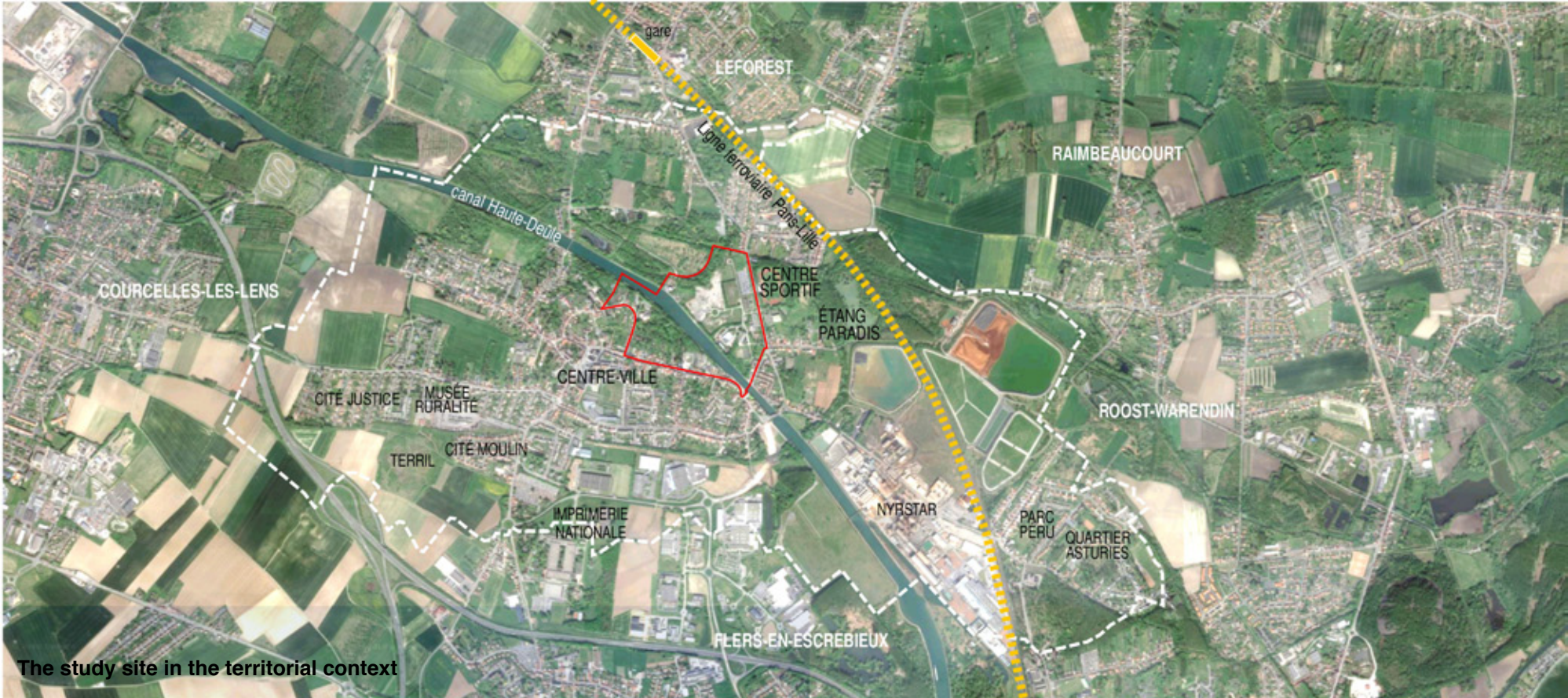
The study site in the territorial context