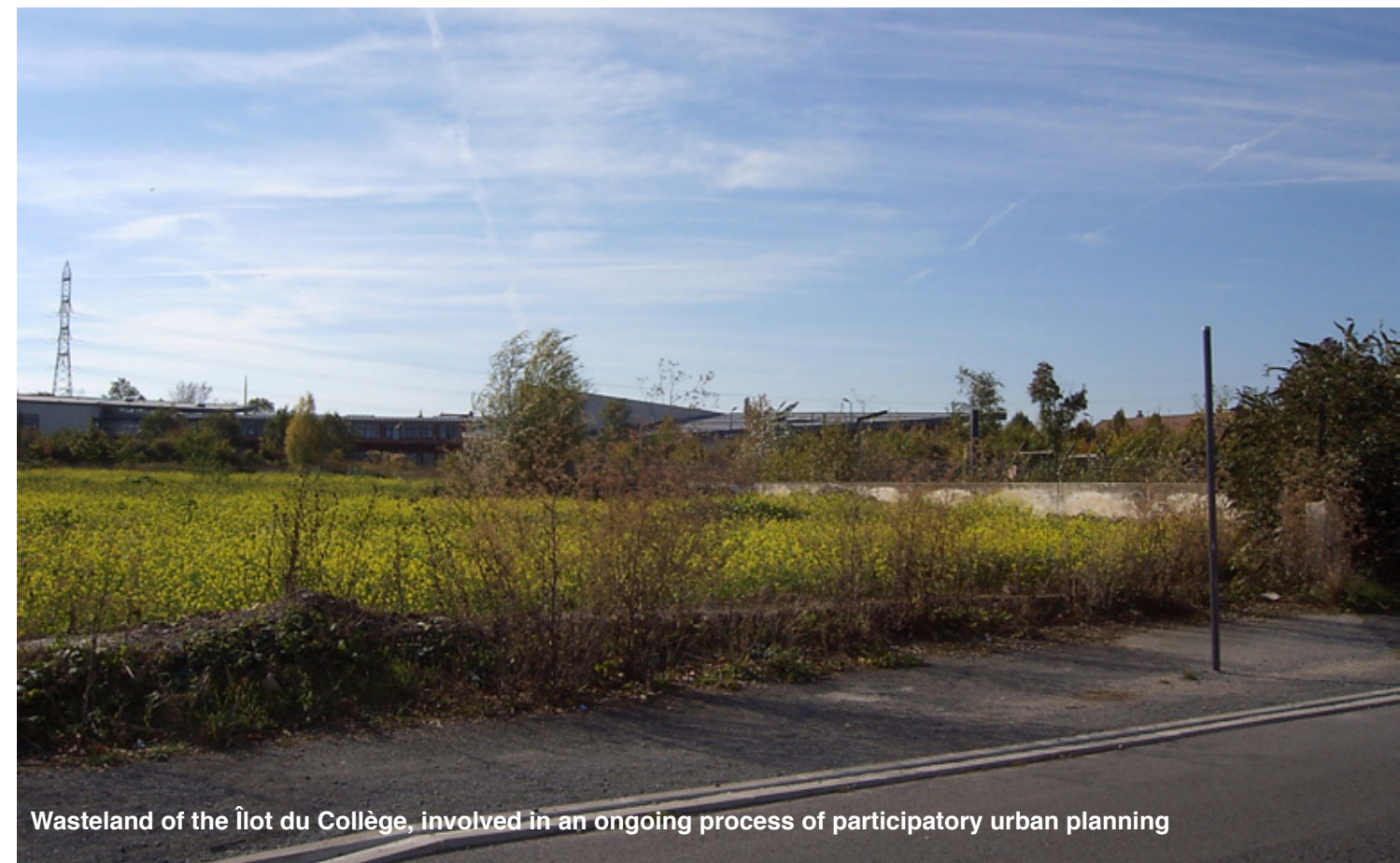
Wasteland of the Îlot du Collège, involved in an ongoing process of participatory urban planning