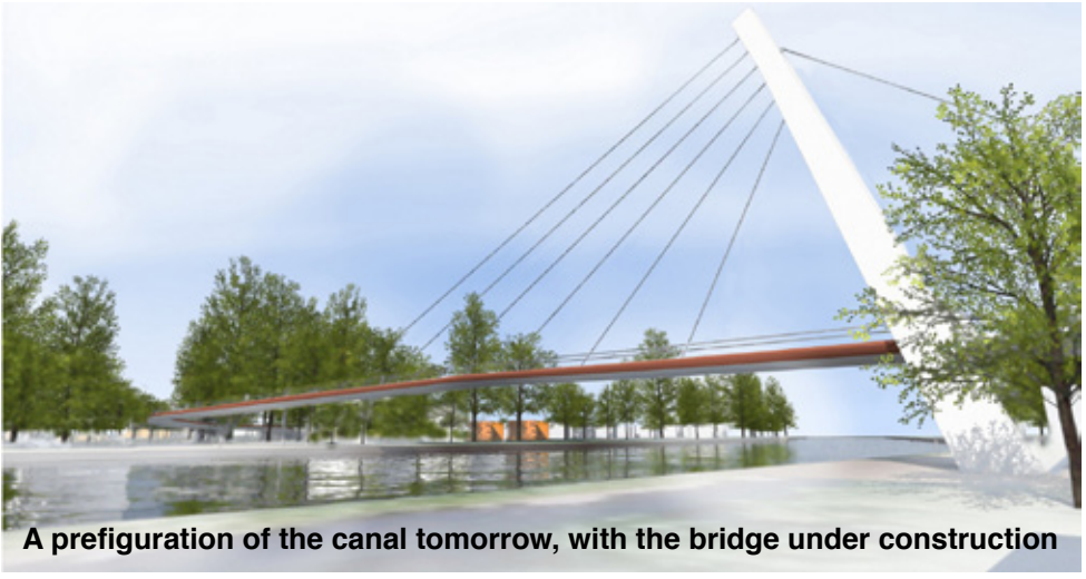
A prefiguration of the canal tomorrow, with the bridge under construction

SCALES: L/S - urban + architecture / architecture + context TEAM REPRESENTATIVE: Urbanist / architect / landscaper SITE FAMILY: MAKING PROXIMITIES - Interfaces and short cycles LOCATION: City of Auby, Douaisis agglo, Nord-Pas de Calais Mining Basin POPULATION: 7,600 inhabitants STRATEGIC SITE: 26 ha PROJECT SITE: 2.5 ha SITE PROPOSED BY: City of Auby ACTORS INVOLVED: City of Auby, Nord council of architecture, urban planning and the environment (CAUE), Nord-Pas de Calais Mining Basin, Douaisis agglo, SCot du Grand Douaisis OWNERS OF THE SITE: City of Auby COMMISSION AFTER COMPETITION: Urban studies, urban and / or architectural mastery projects