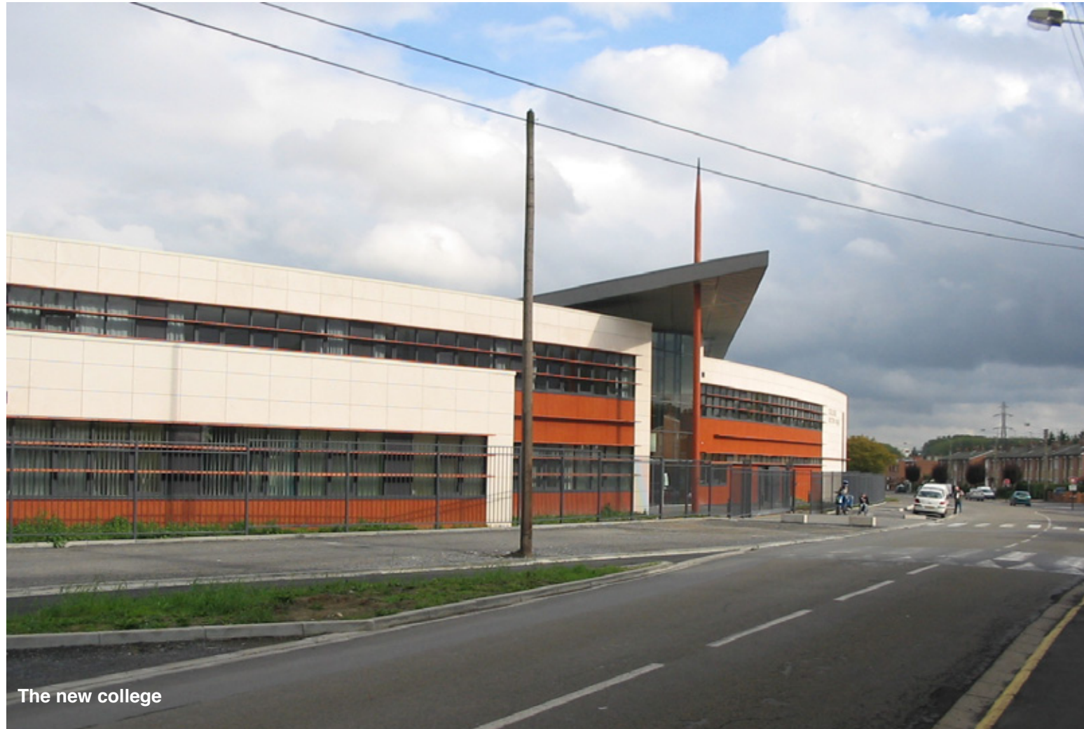
The new college