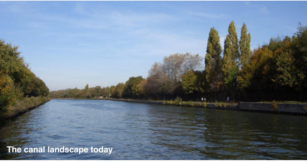
The canal landscape today