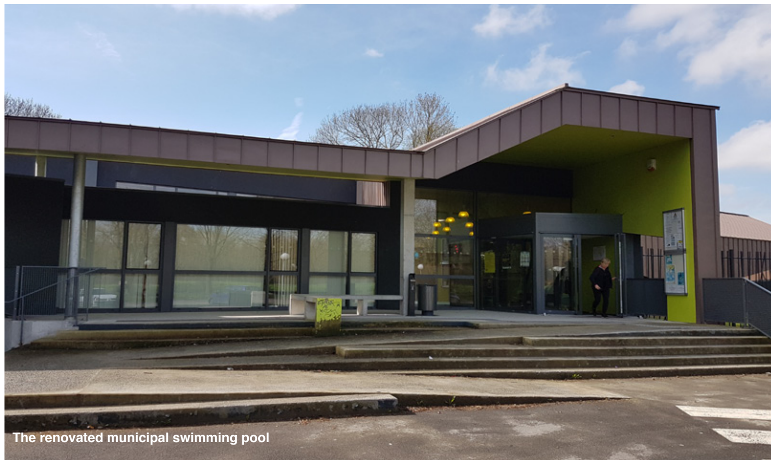
The renovated municipal swimming pool