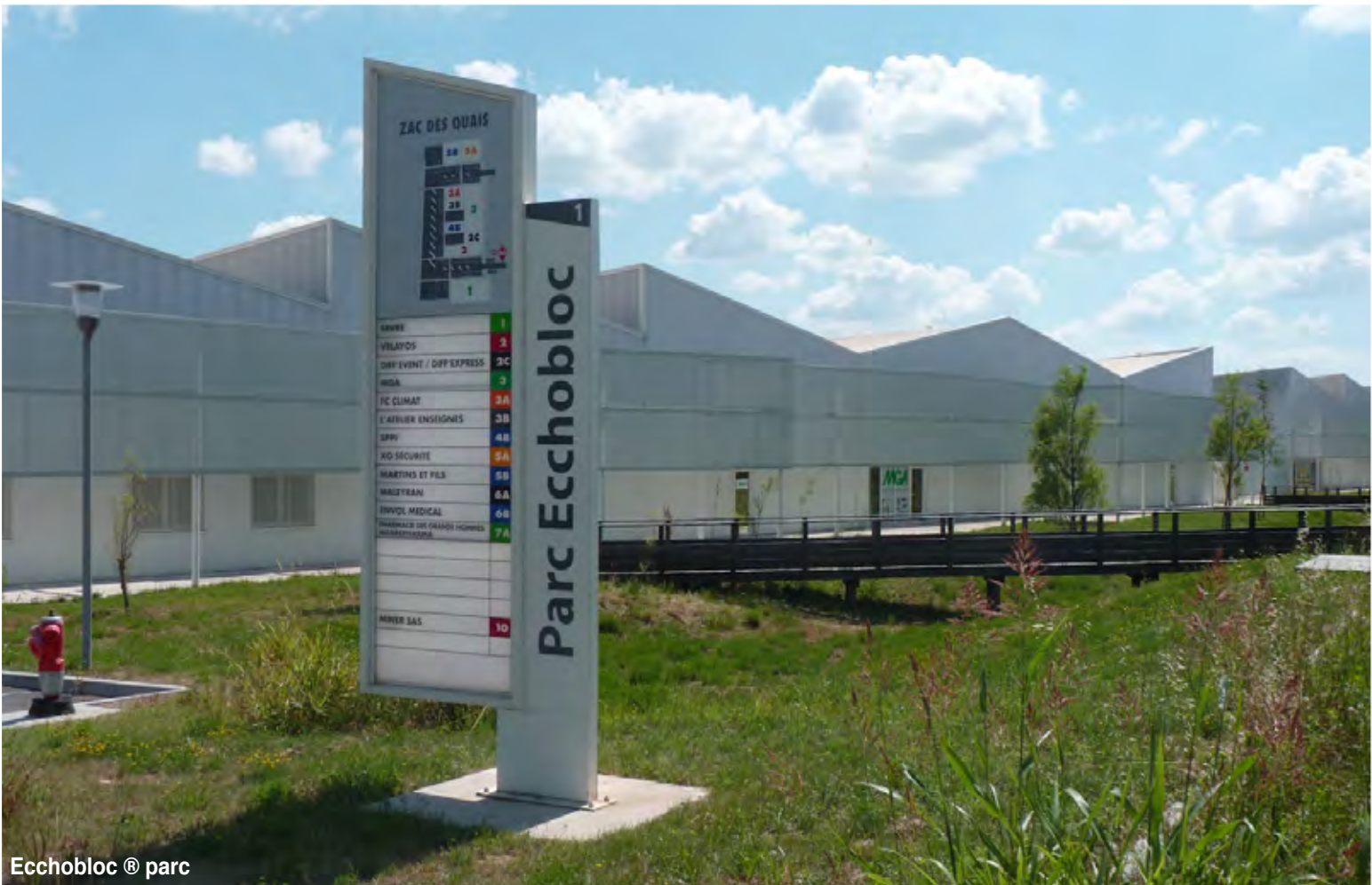
Ecchobloc ® parc