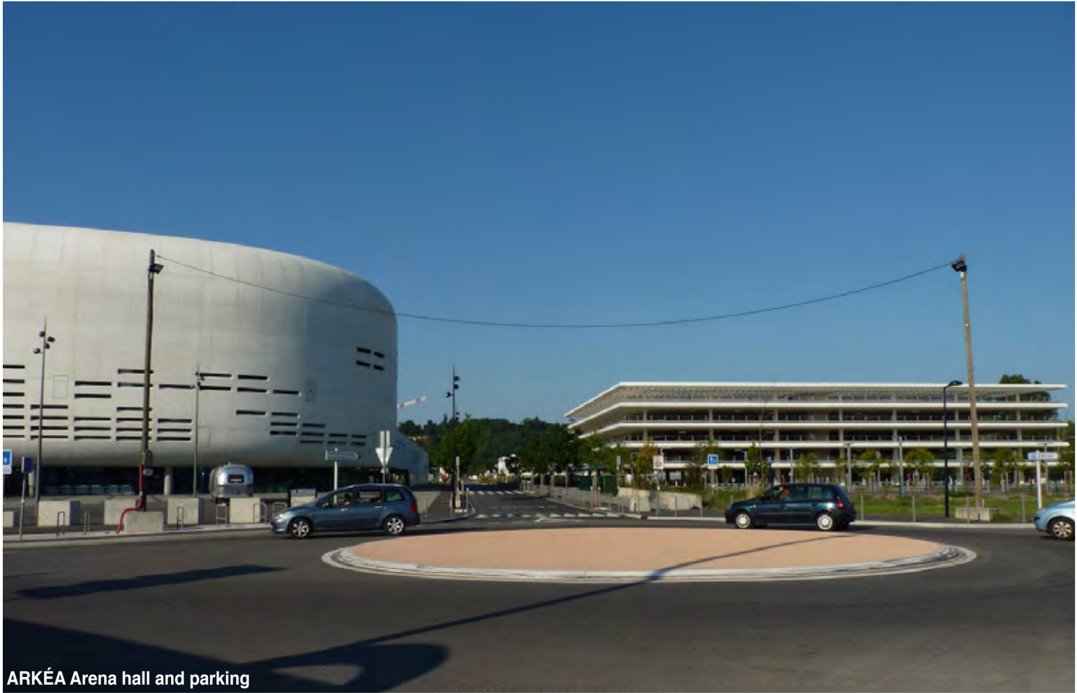
ARKÉA Arena hall and parking