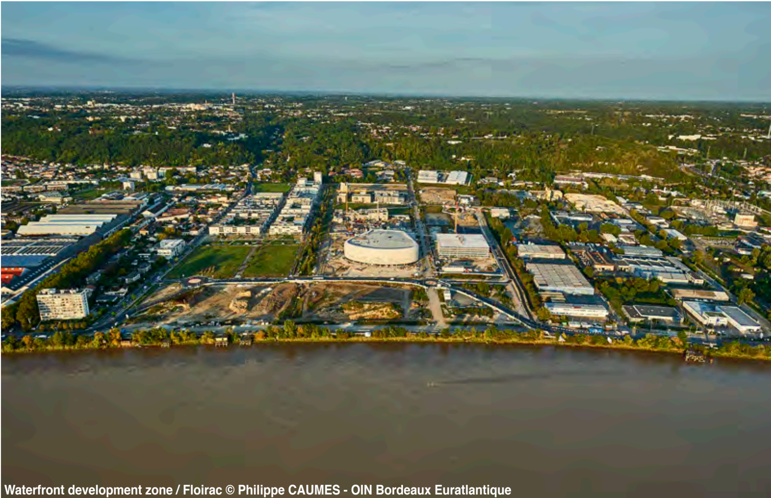
Waterfront development zone / Floirac