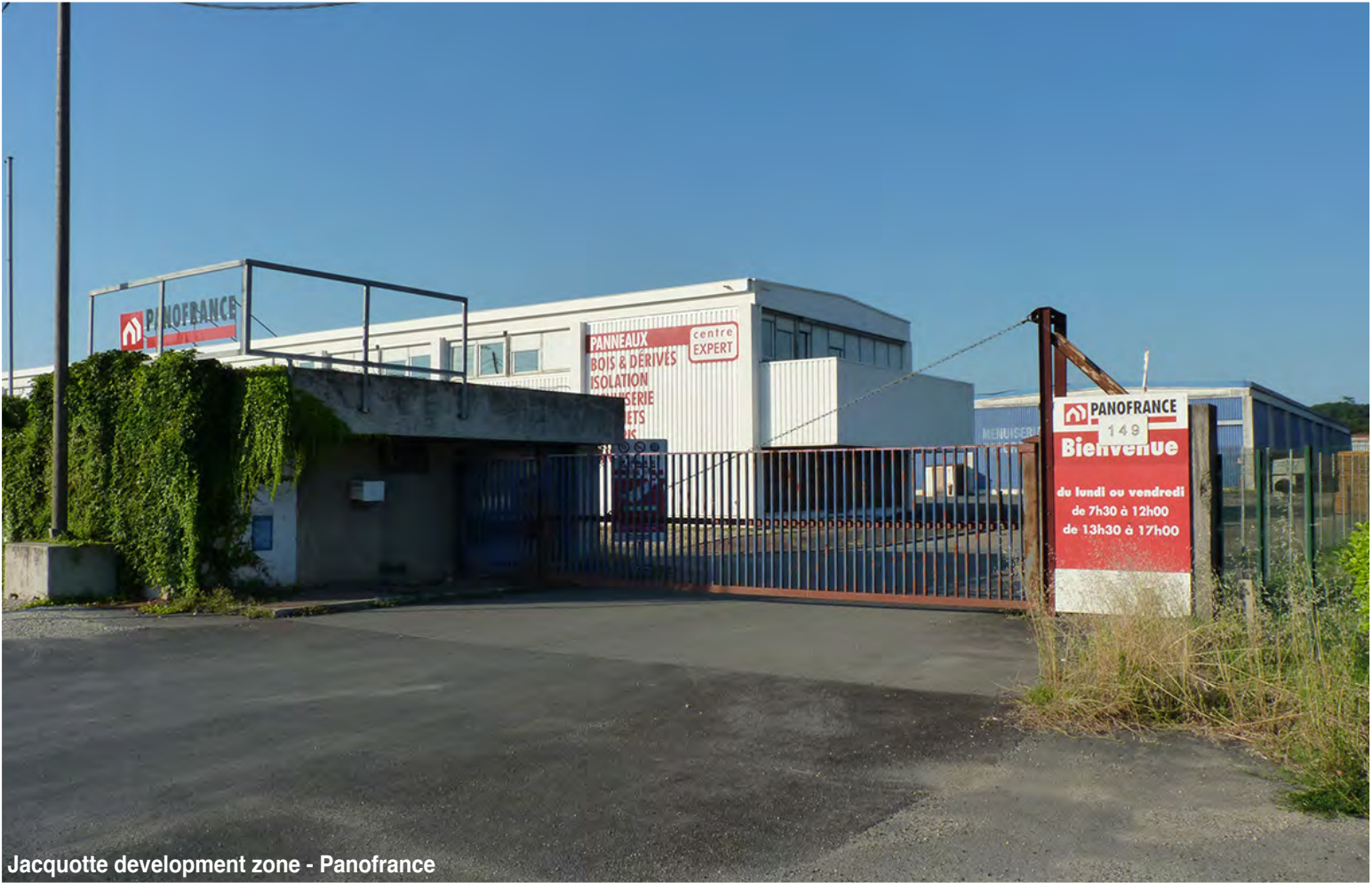
Jacquotte development zone - PanoFrance