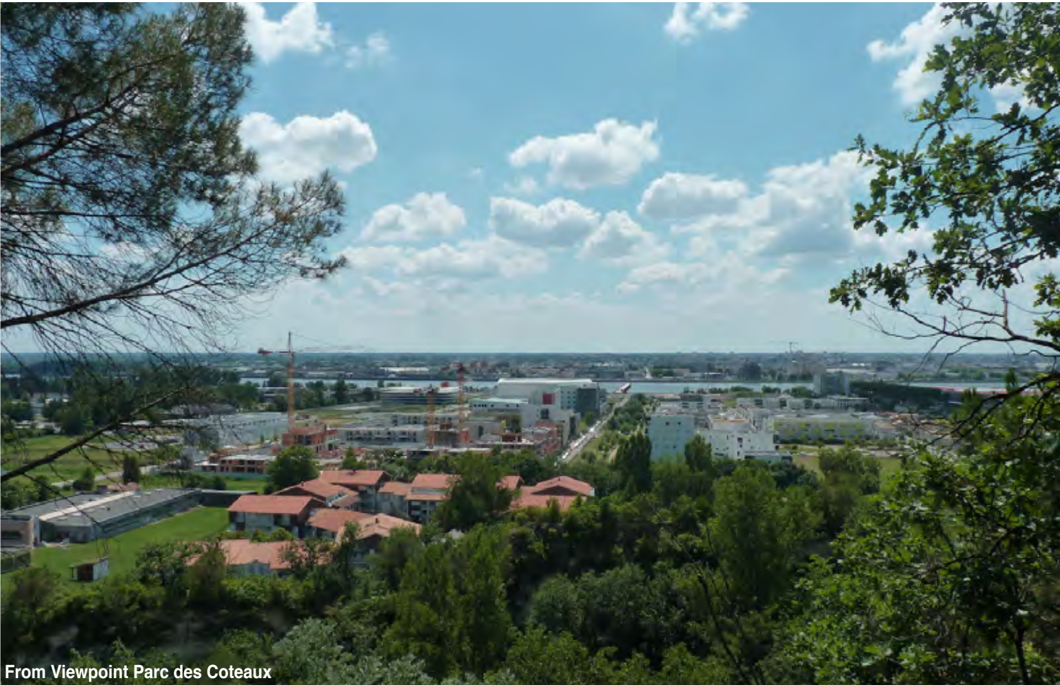
From Viewpoint Parc des Coteaux