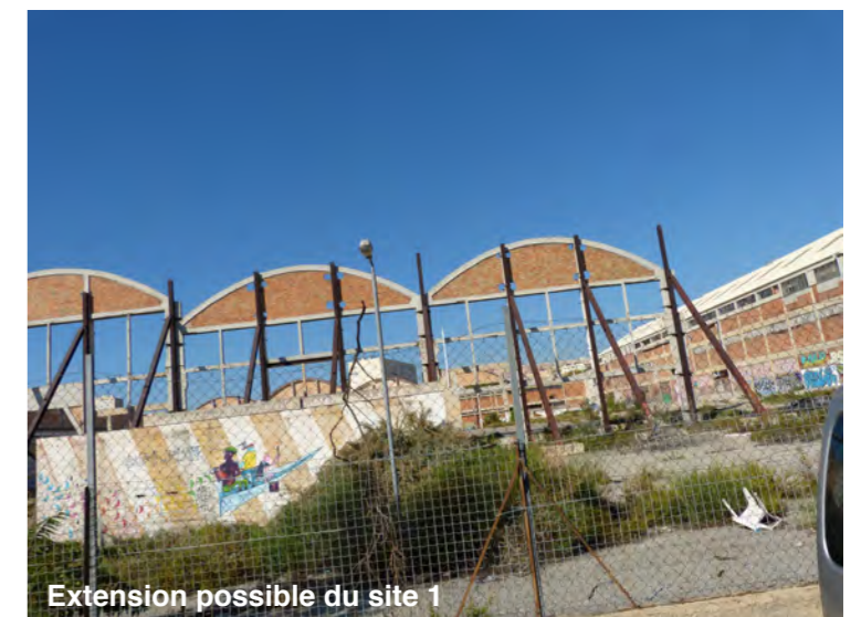
Extension possible du site 1