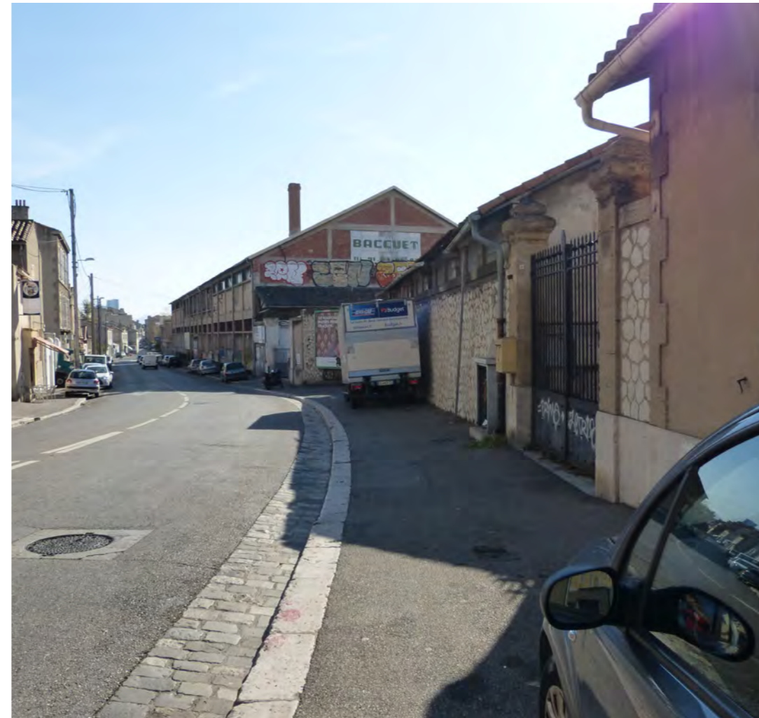
Warehouses, city of Marseille Madrague-Plan