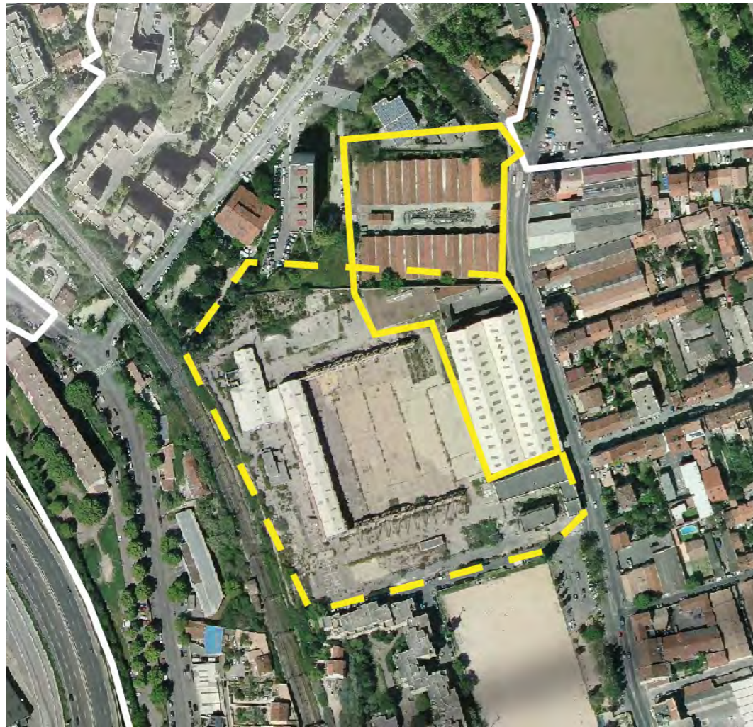
Project site 1 : Warehouses, city of Marseille Madrague-Plan