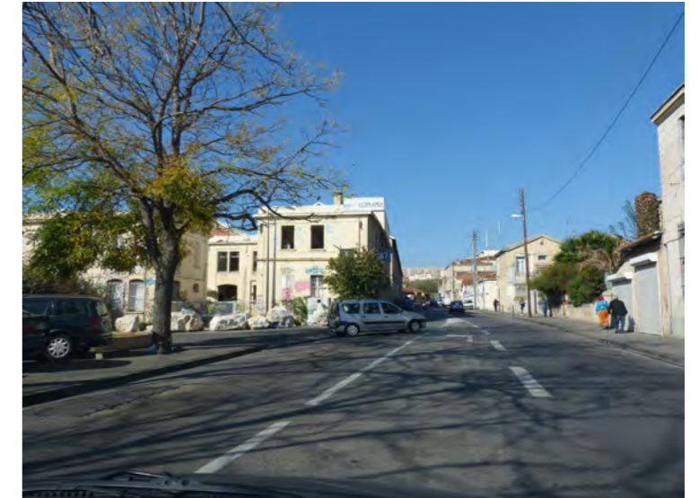
Views from the Madrague-Plan on the Cofrapex site