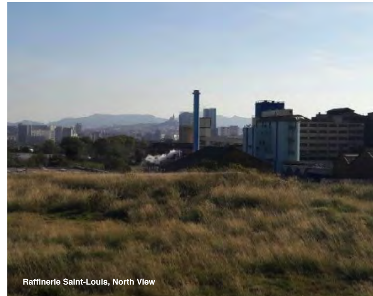
Raffinerie Saint-Louis, North View