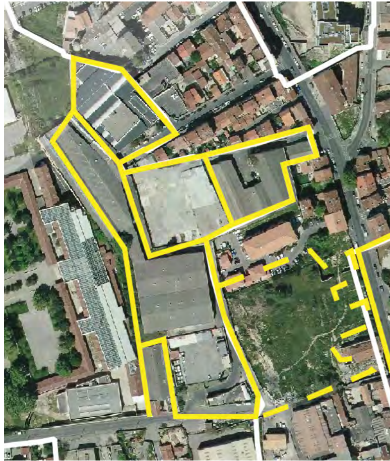
Site de projet 2 : Warehouses City North of Mardirossian