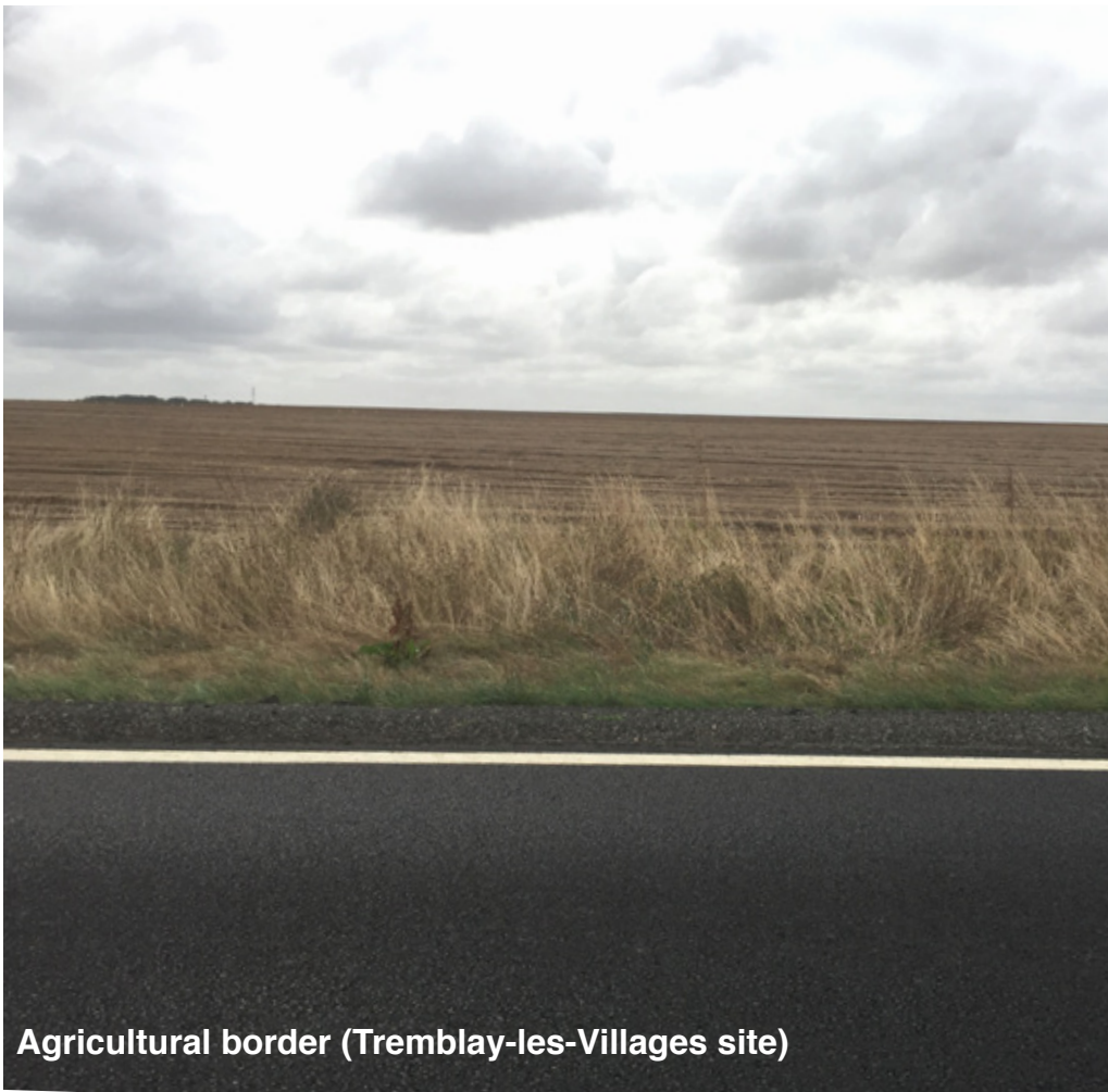
Agricultural border (Tremblay-les-Villages site)