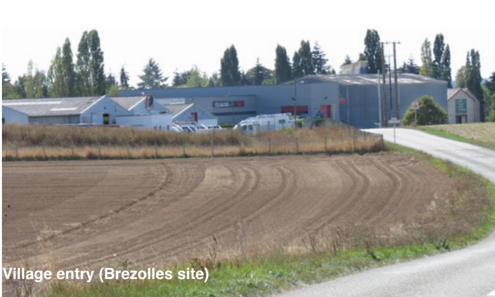
Village entry (Brezolles site)