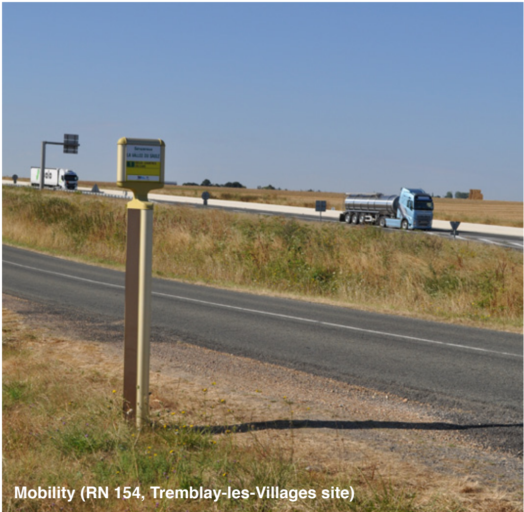
Mobility (RN 154, Tremblay-les-Villages site)