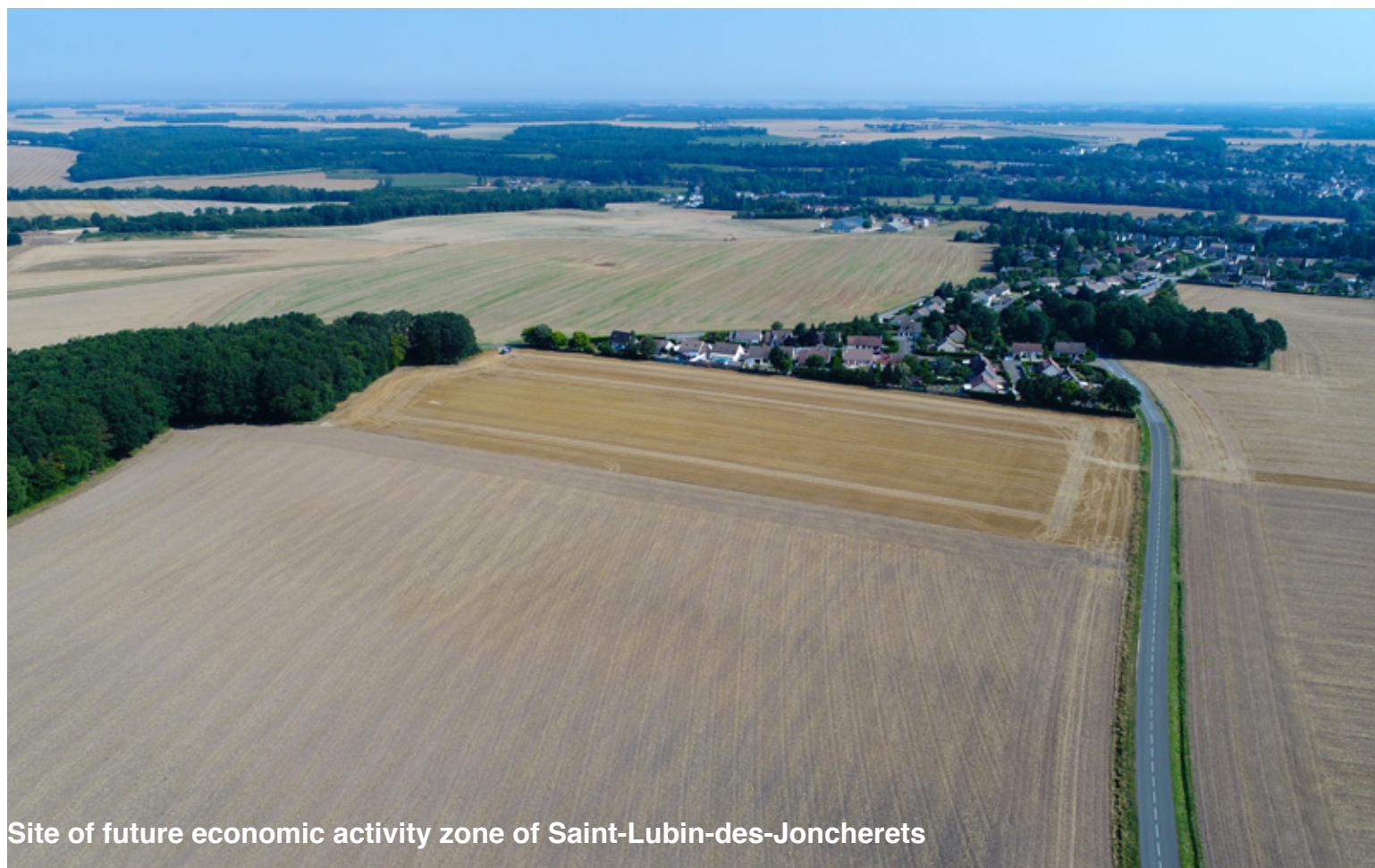
Site of future economic activity zone of Saint-Lubin-des-Joncherets