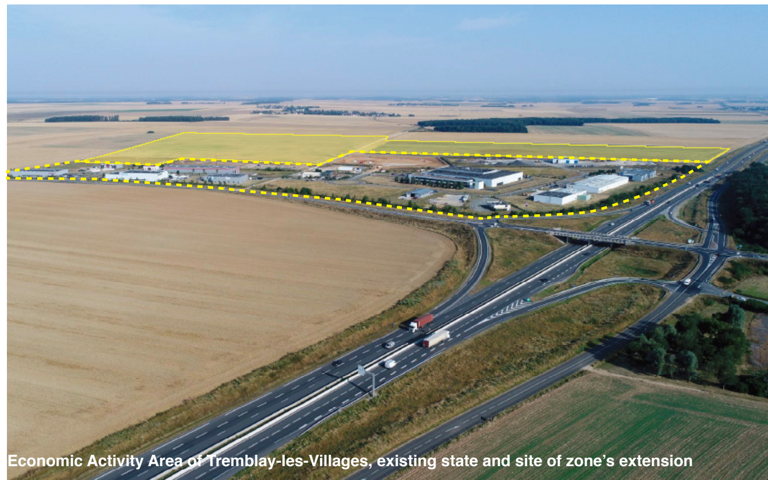
Economic Activity Area of Tremblay-les-Villages, existing state and site of zone's extension