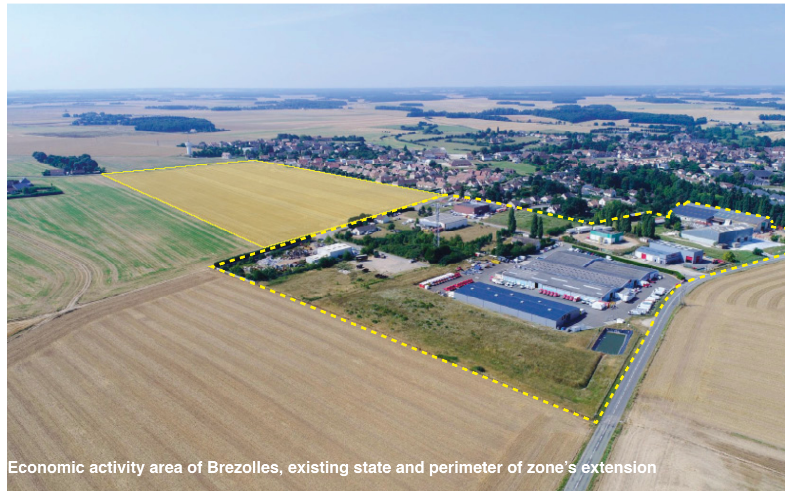
Economic activity area of Brezolles, existing state and perimeter of zone's extension