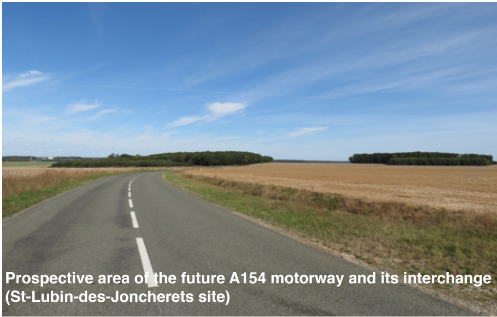
Prospective area of the future A154 motorway and its interchange (St-Lubin-des-Joncherets site)