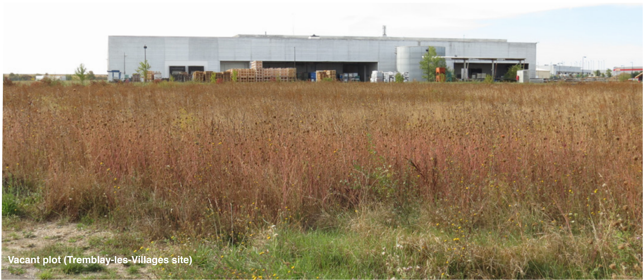
Vacant plot (Tremblay-les-Villages site)