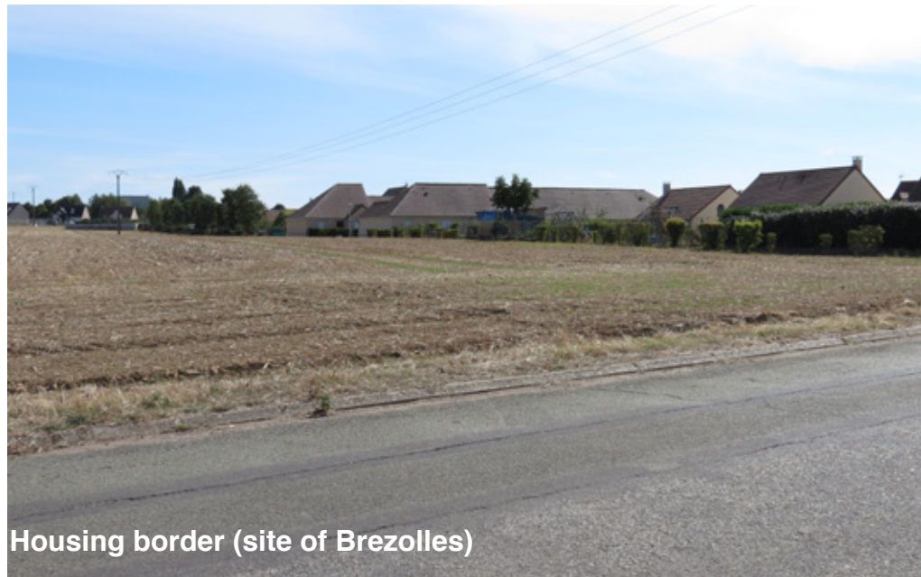
Housing border (site of Brezolles)