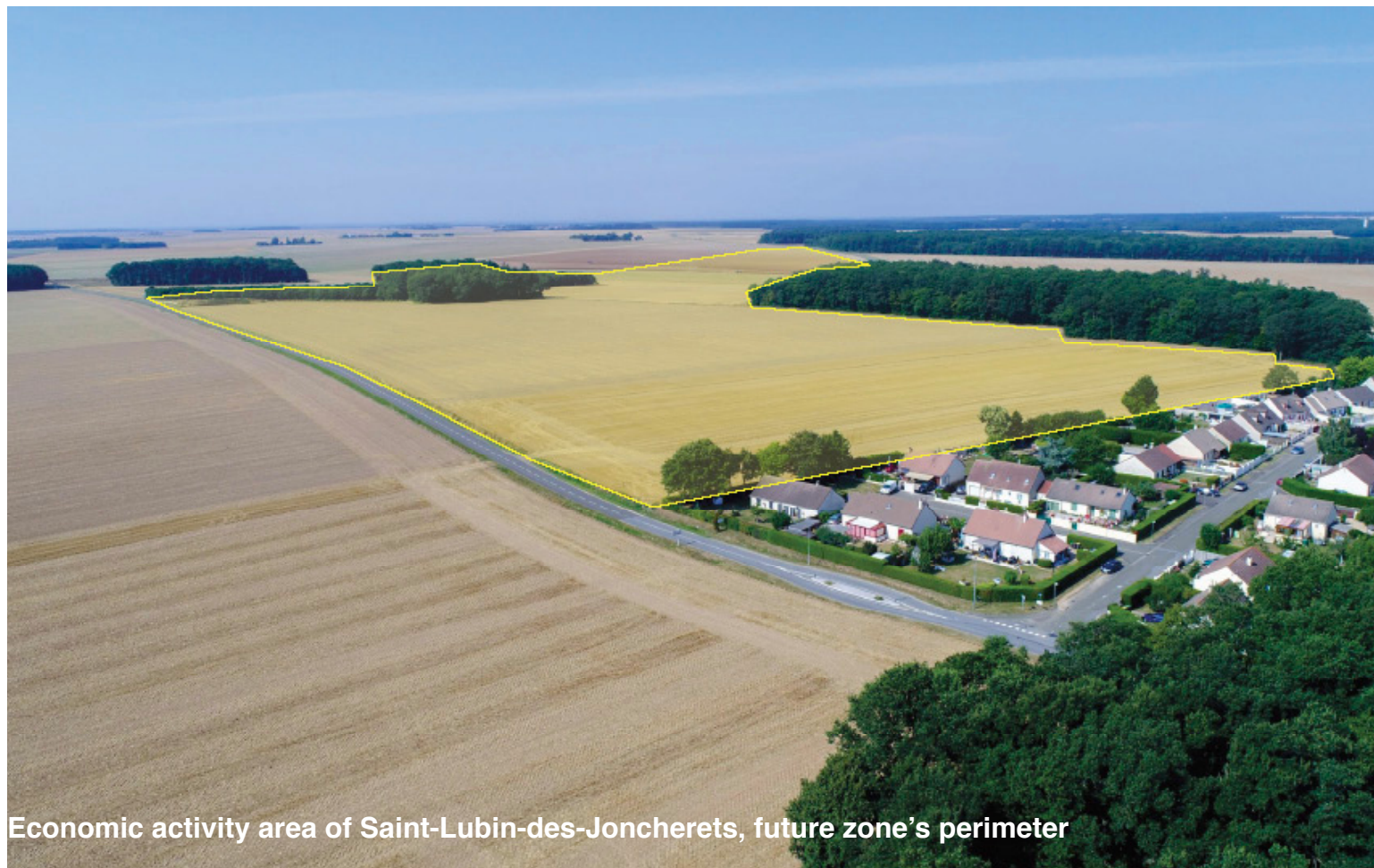
Economic activity area of Saint-Lubin-des-Joncherets, future zone's perimeter