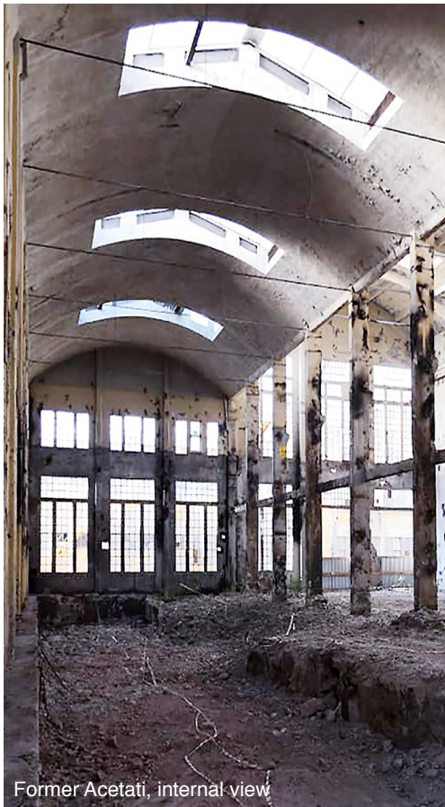
Former Acetati, internal view