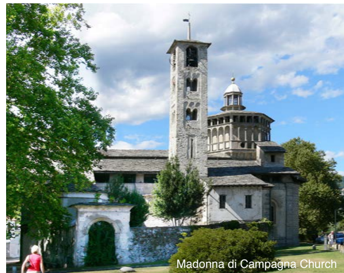
Madonna di Campagna Church