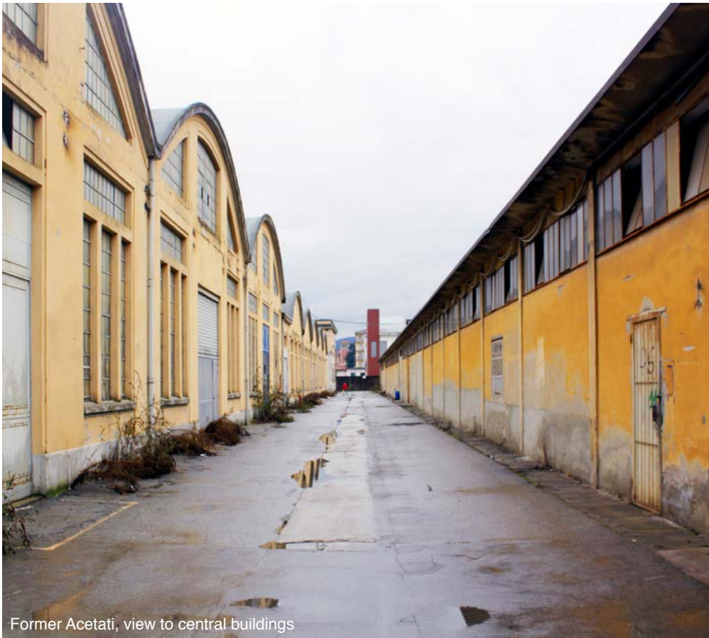
Former Acetati, view to central buildings