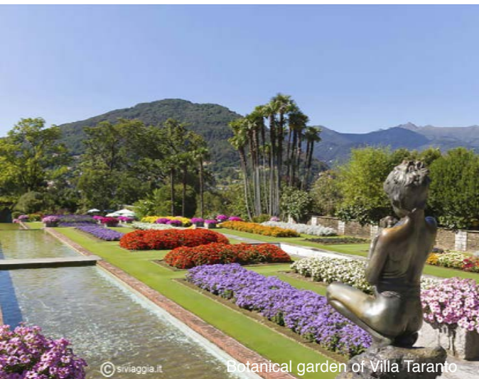
Botanical garden of Villa Taranto