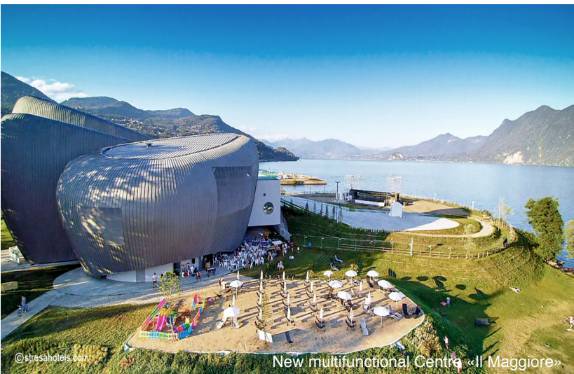
New multifunctional Centre «Il Maggiore»