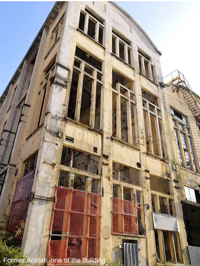
Former Acetati, one of the building