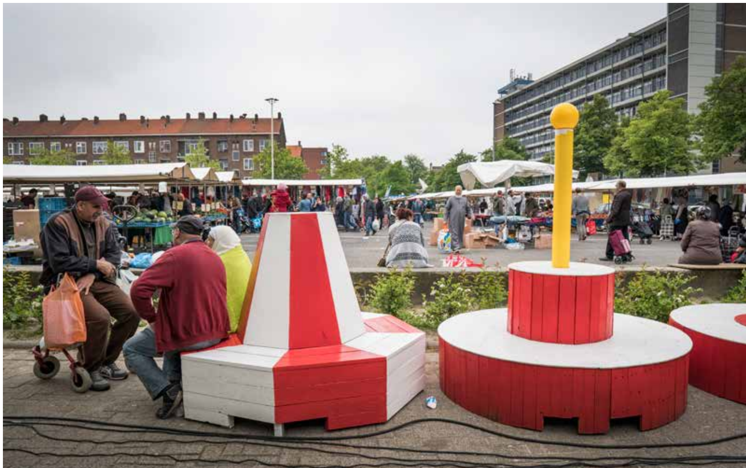
The Visserijplein on market days