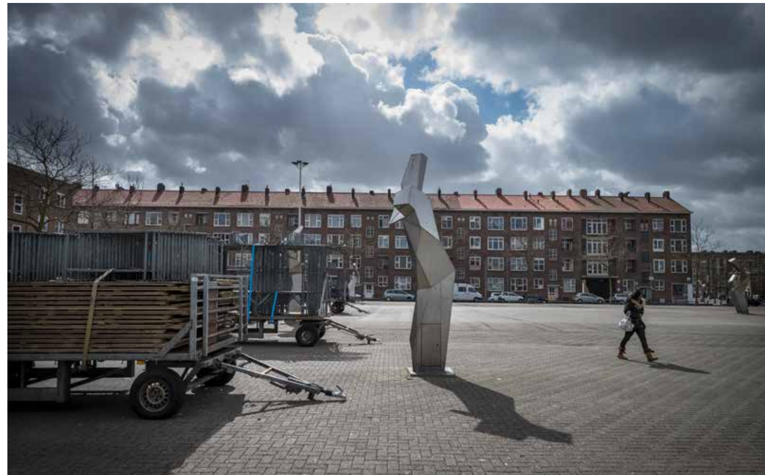
The Visserijplein on regular days