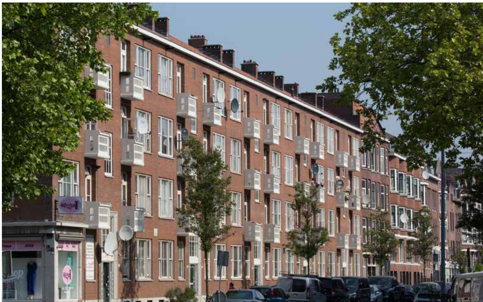
Typical architecture in the neighbourhood, with small shops on the ground floor