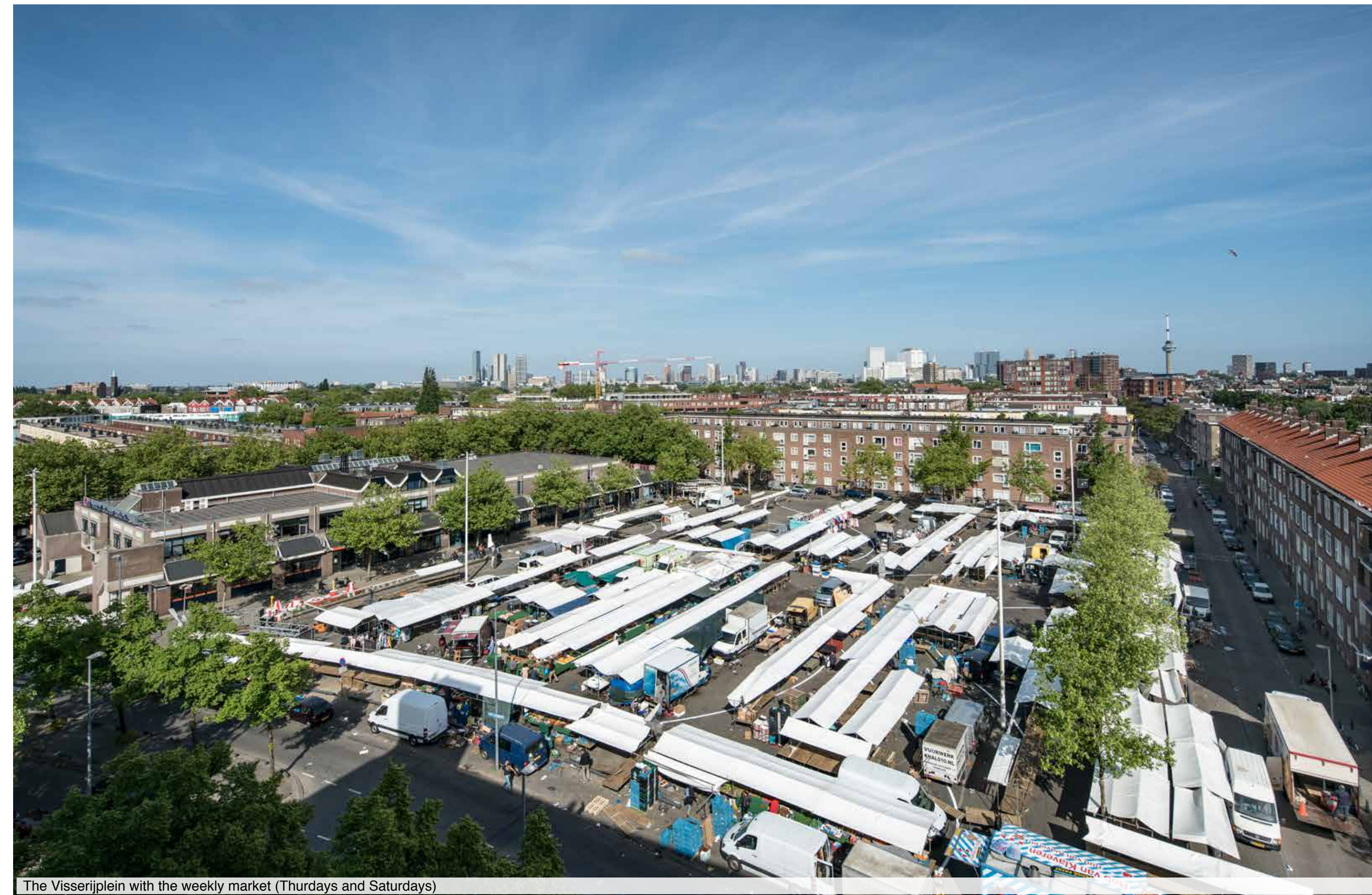
The Visserijplein with the weekly market (Thursdays and Saturdays)