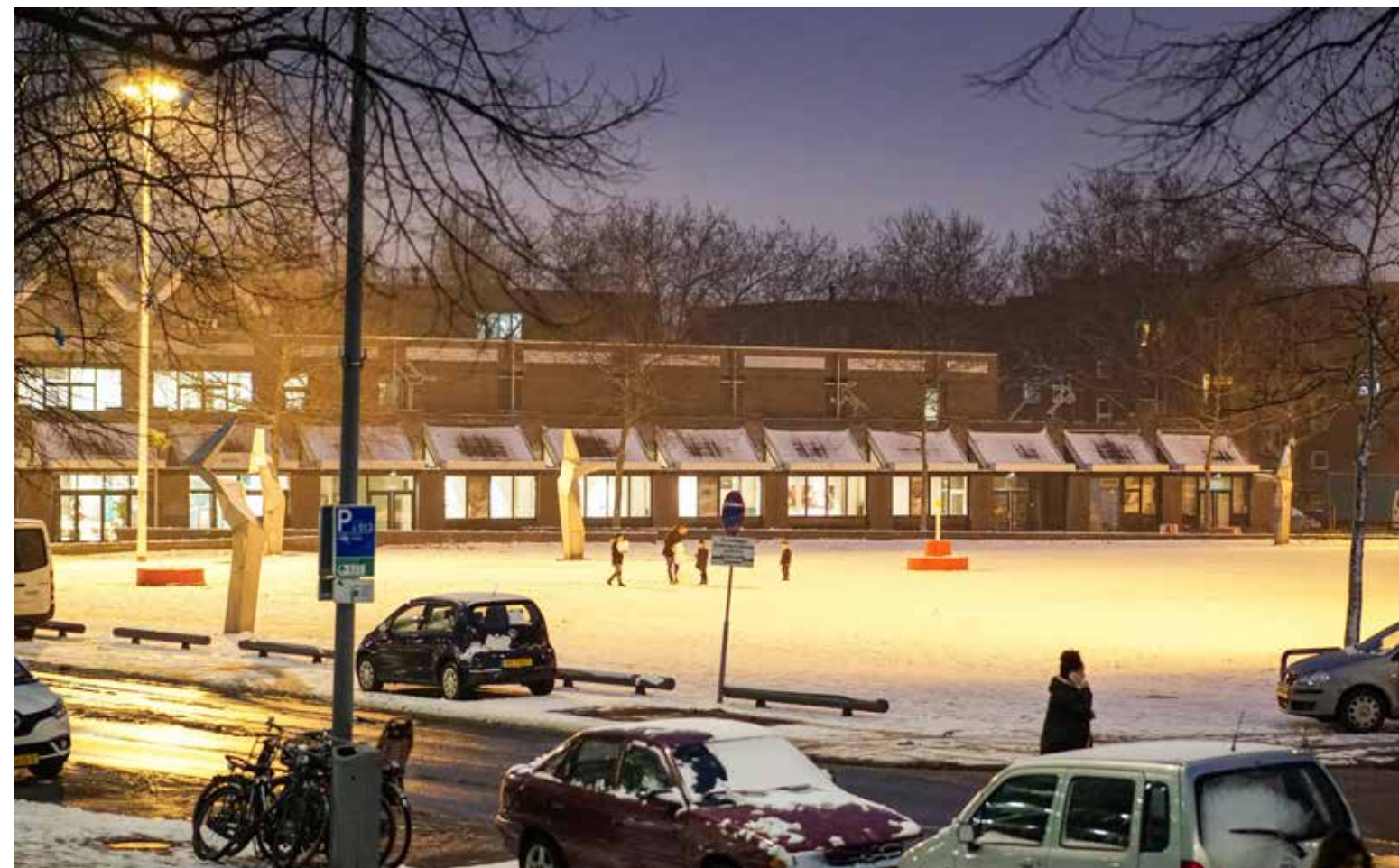
Community centre 'Pier 80' next to the Visserijplein