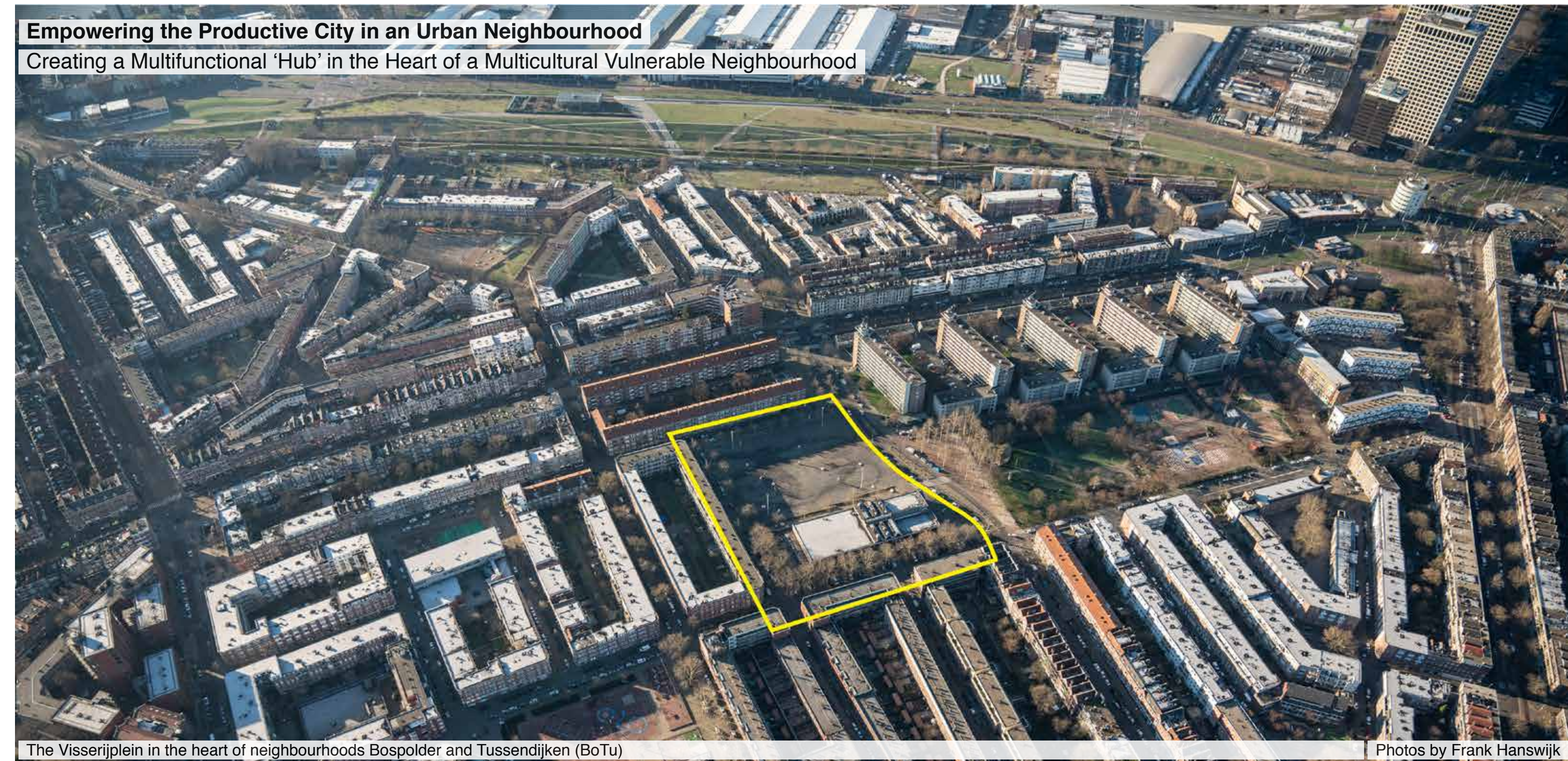
The Visserijplein in the heart of neighbourhoods Bospolder and Tussendijken (BoTu)

Creating a Multifunctional 'Hub' in the Heart of a Multicultural Vulnerable Neighbourhood