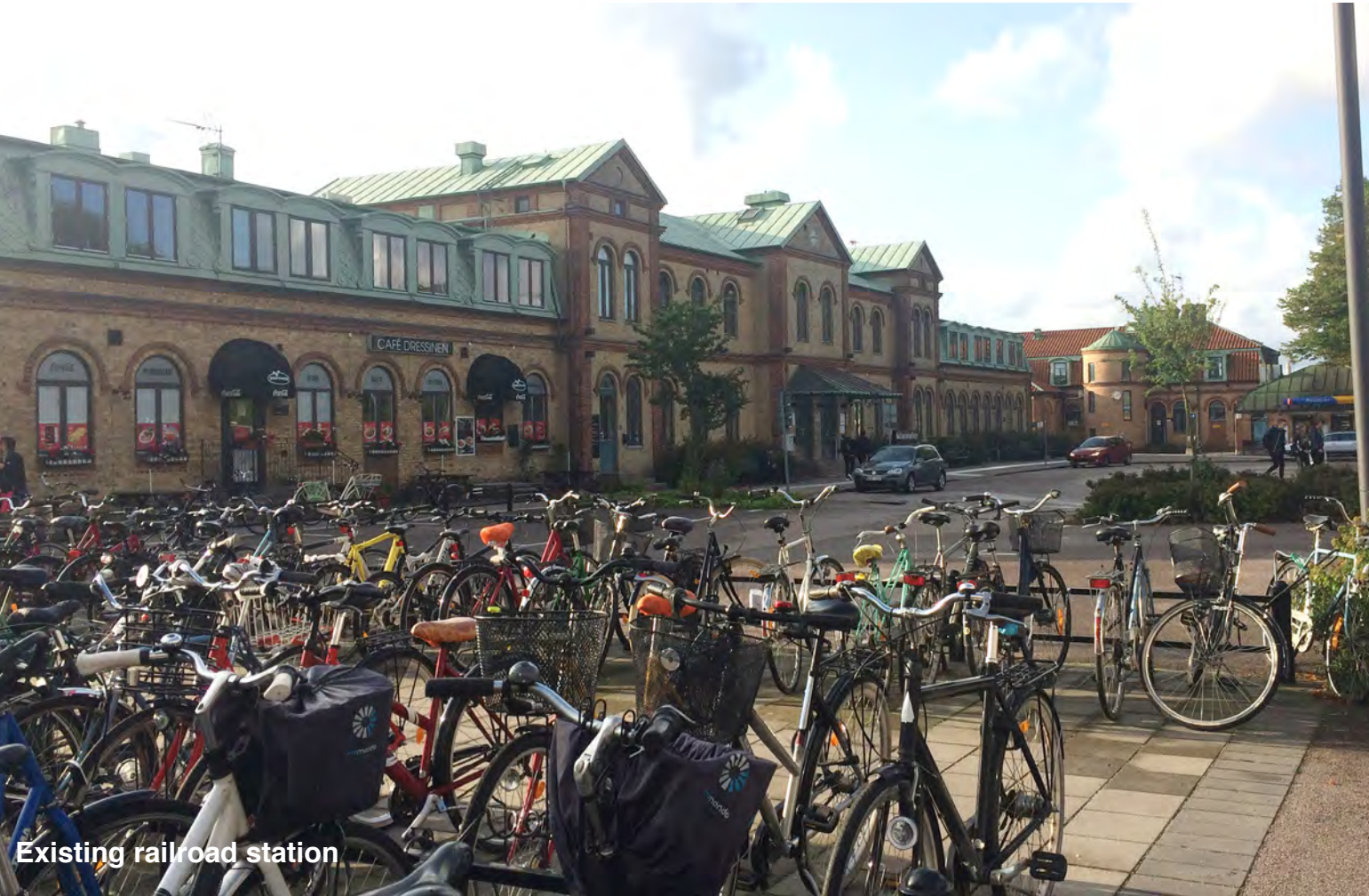
Existing railroad station