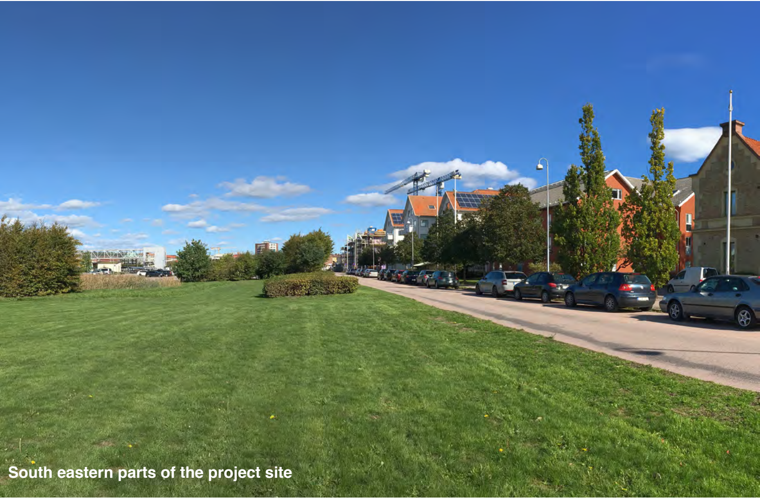
South eastern parts of the project site