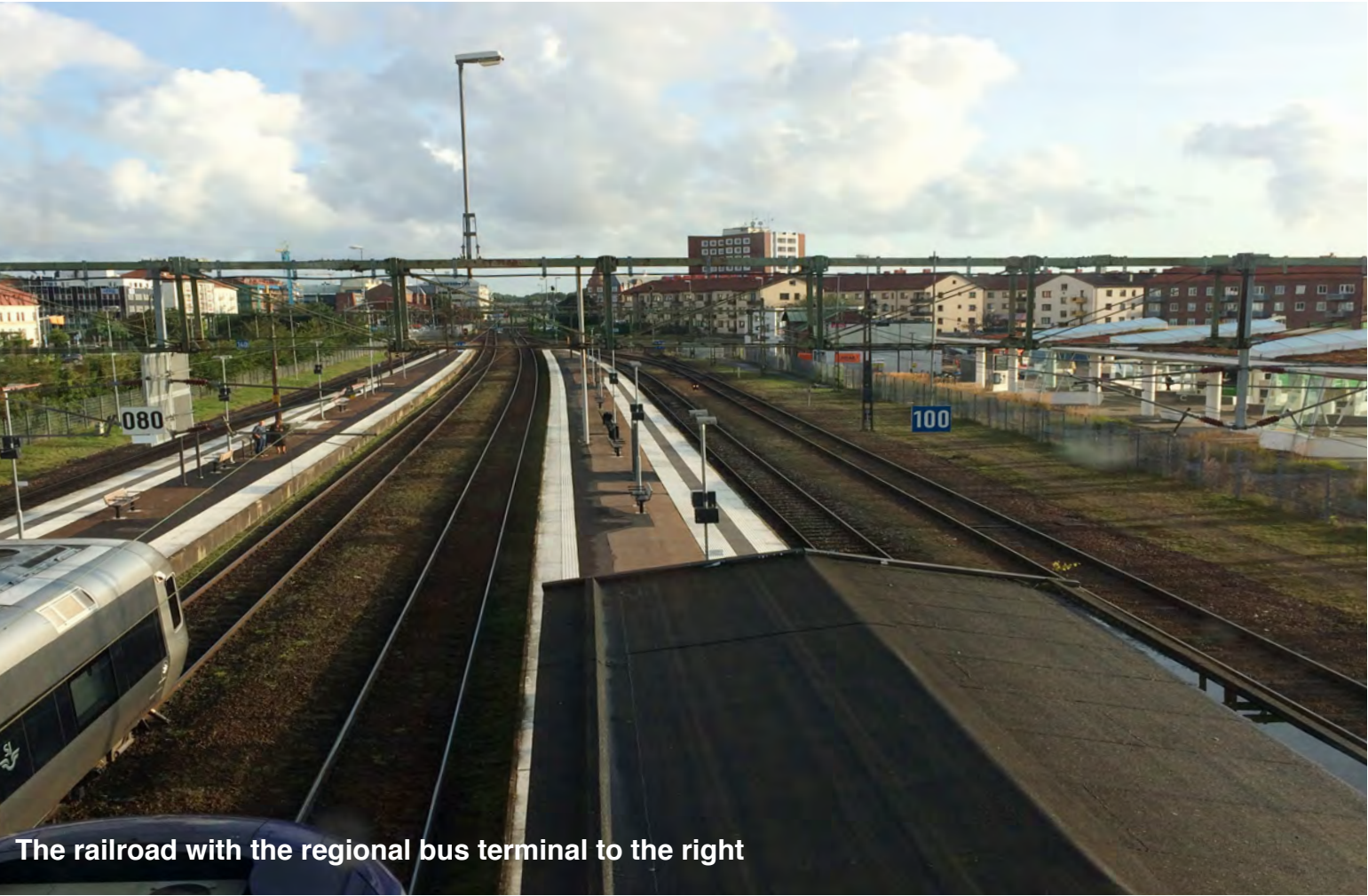
The railroad with the regional bus terminal to the right