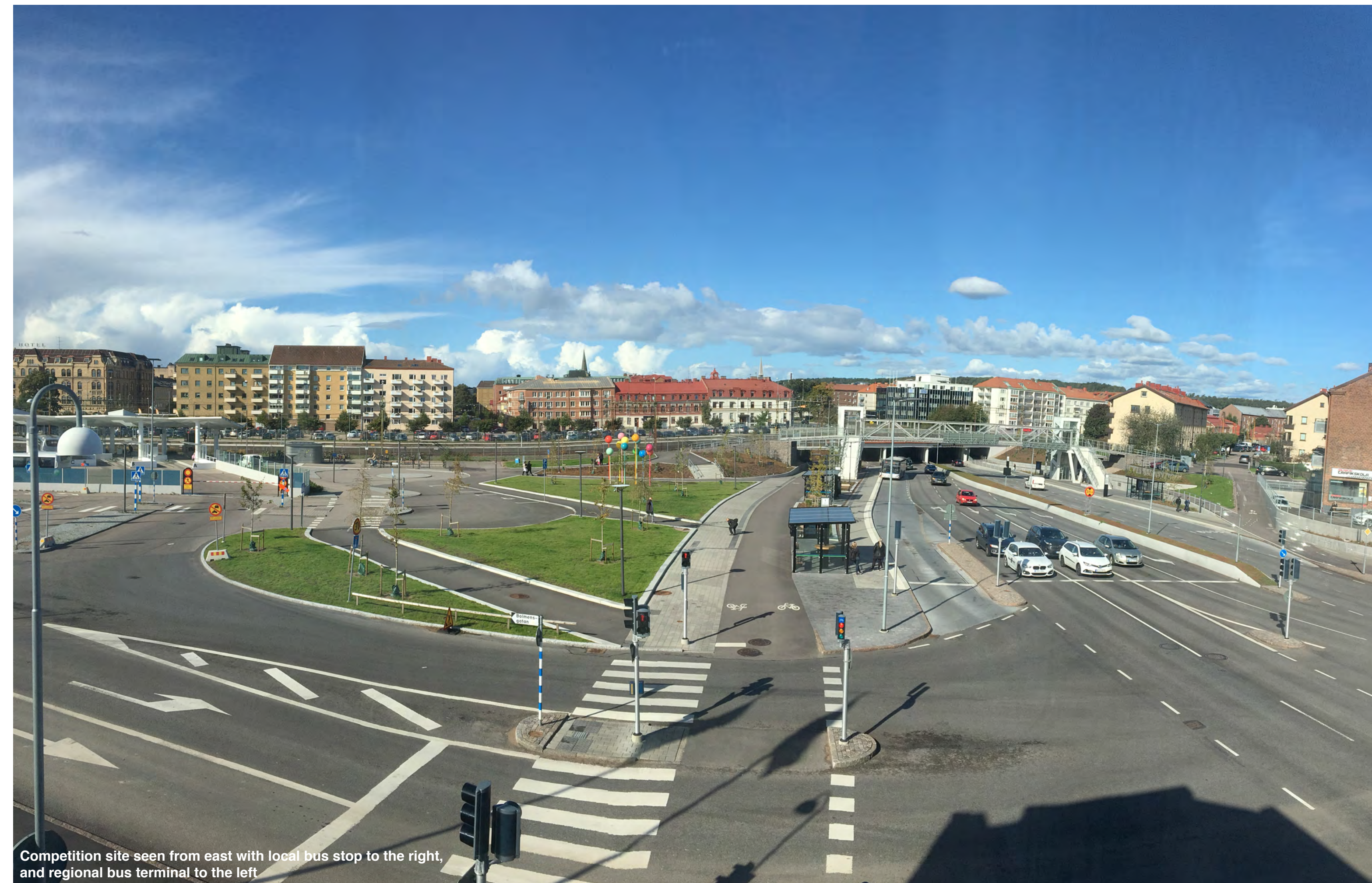
Competition site seen from east with local bus stop to the right, and regional bus terminal to the left