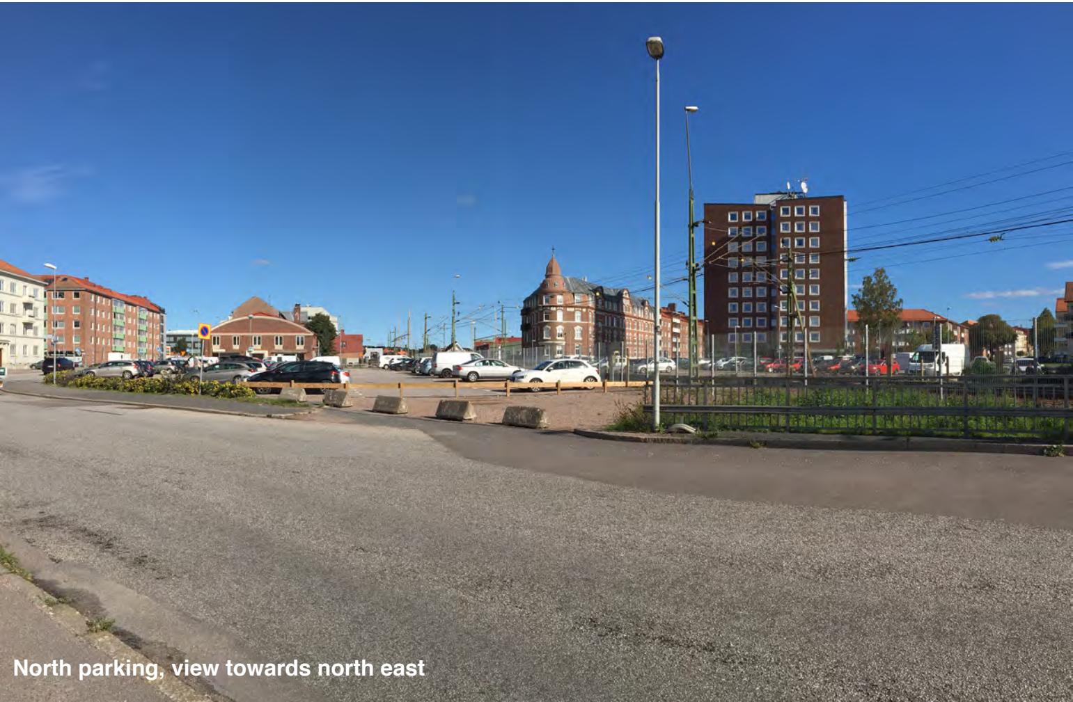
North parking, view towards north east