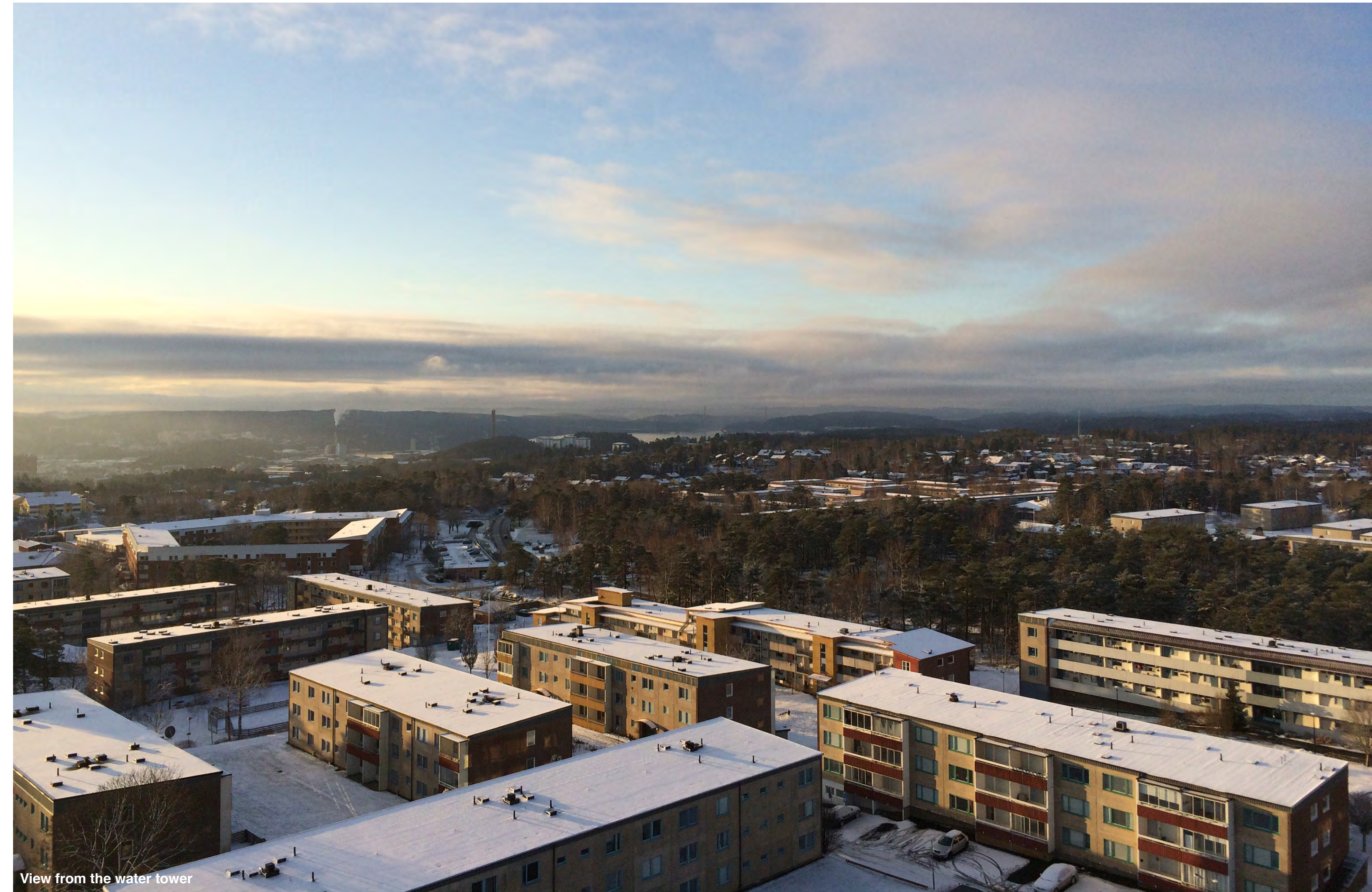
View from the water tower