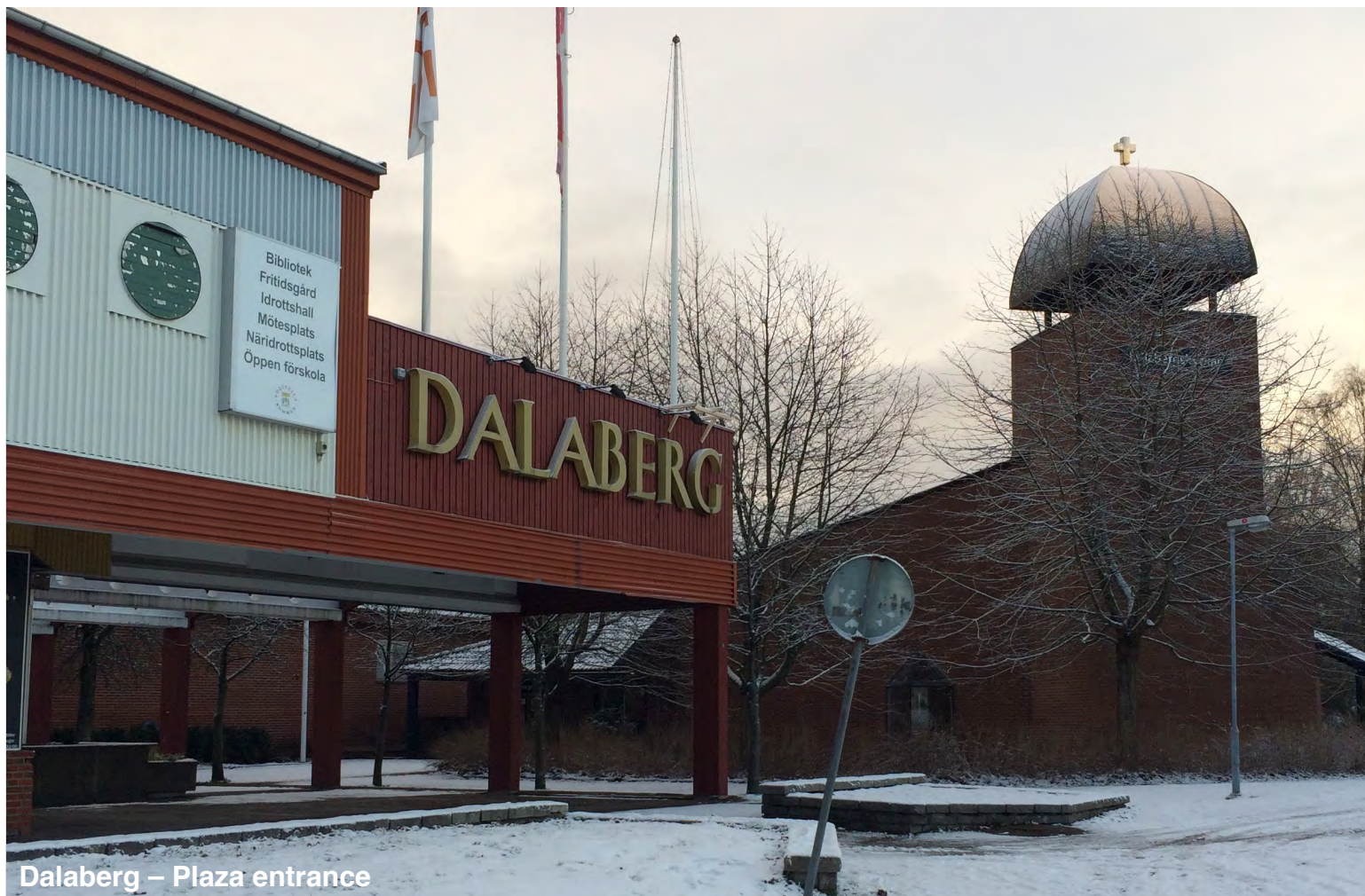
Dalaberg – Plaza entrance