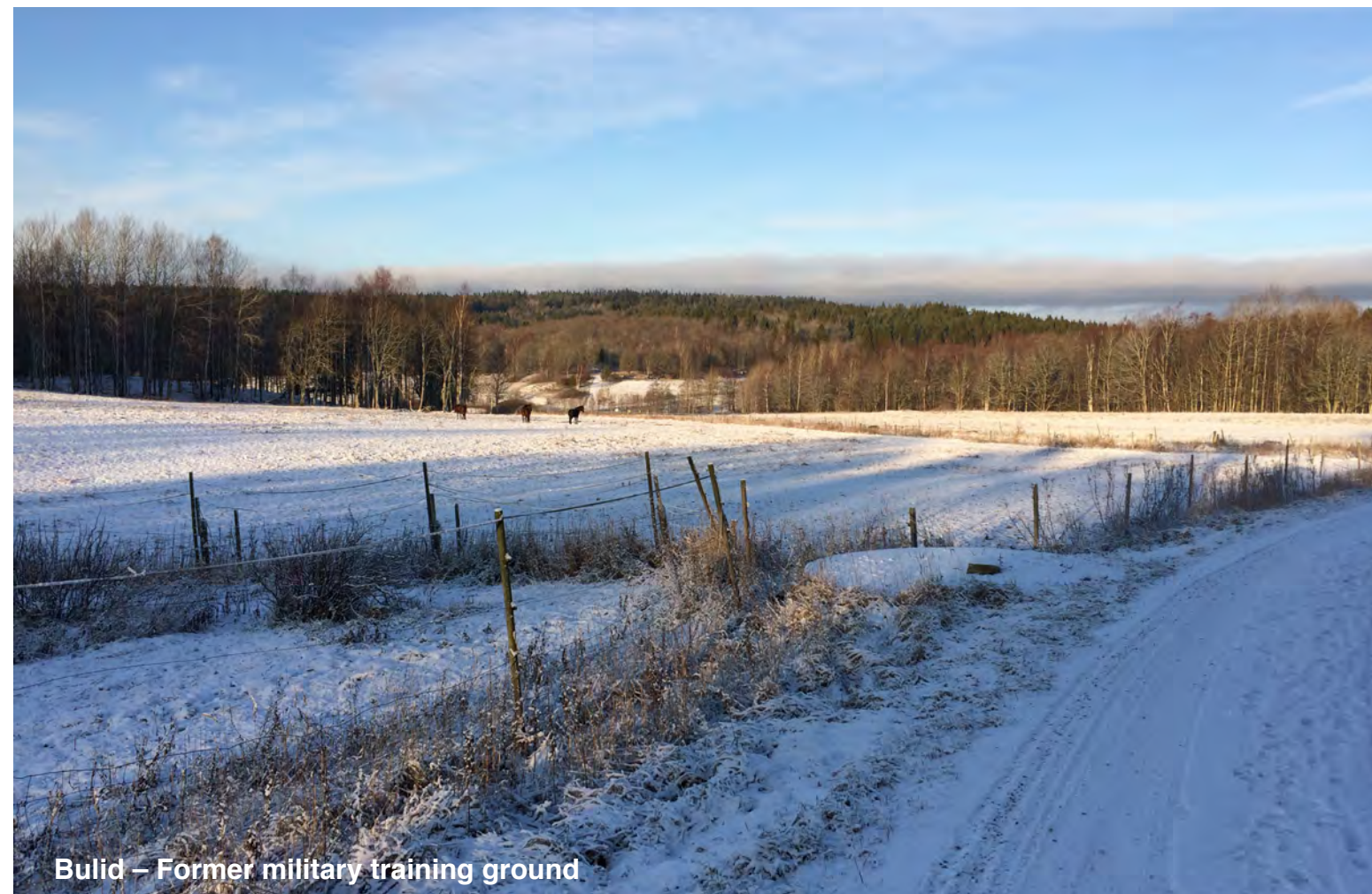
Bulid – Former military training ground