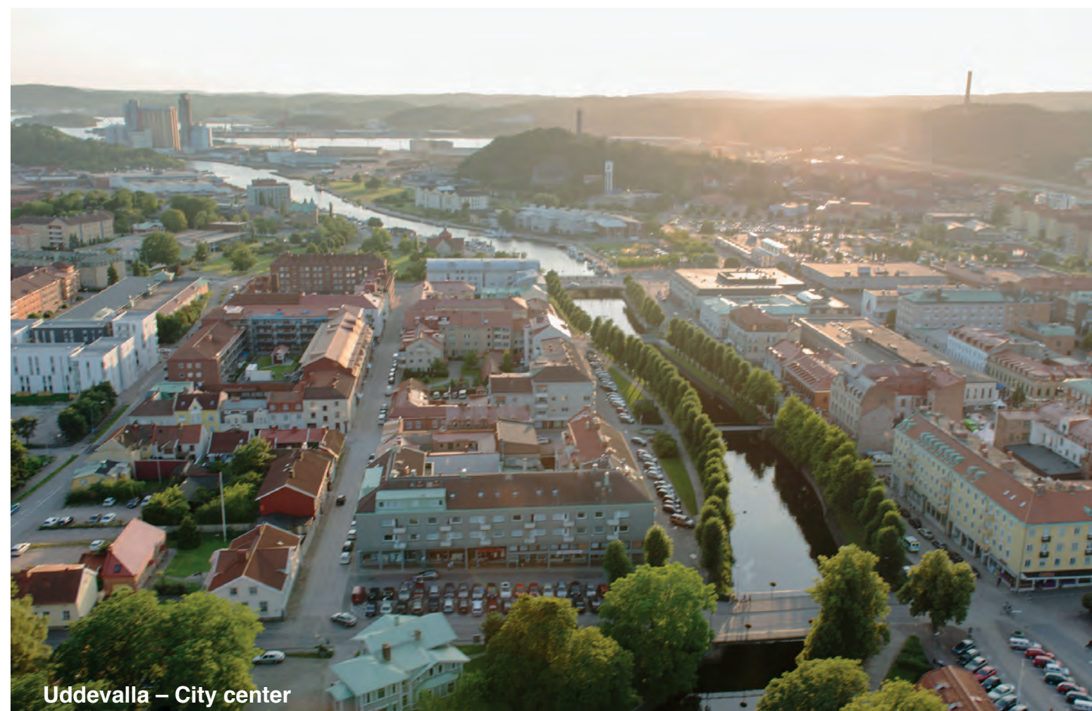
Uddevalla – City center