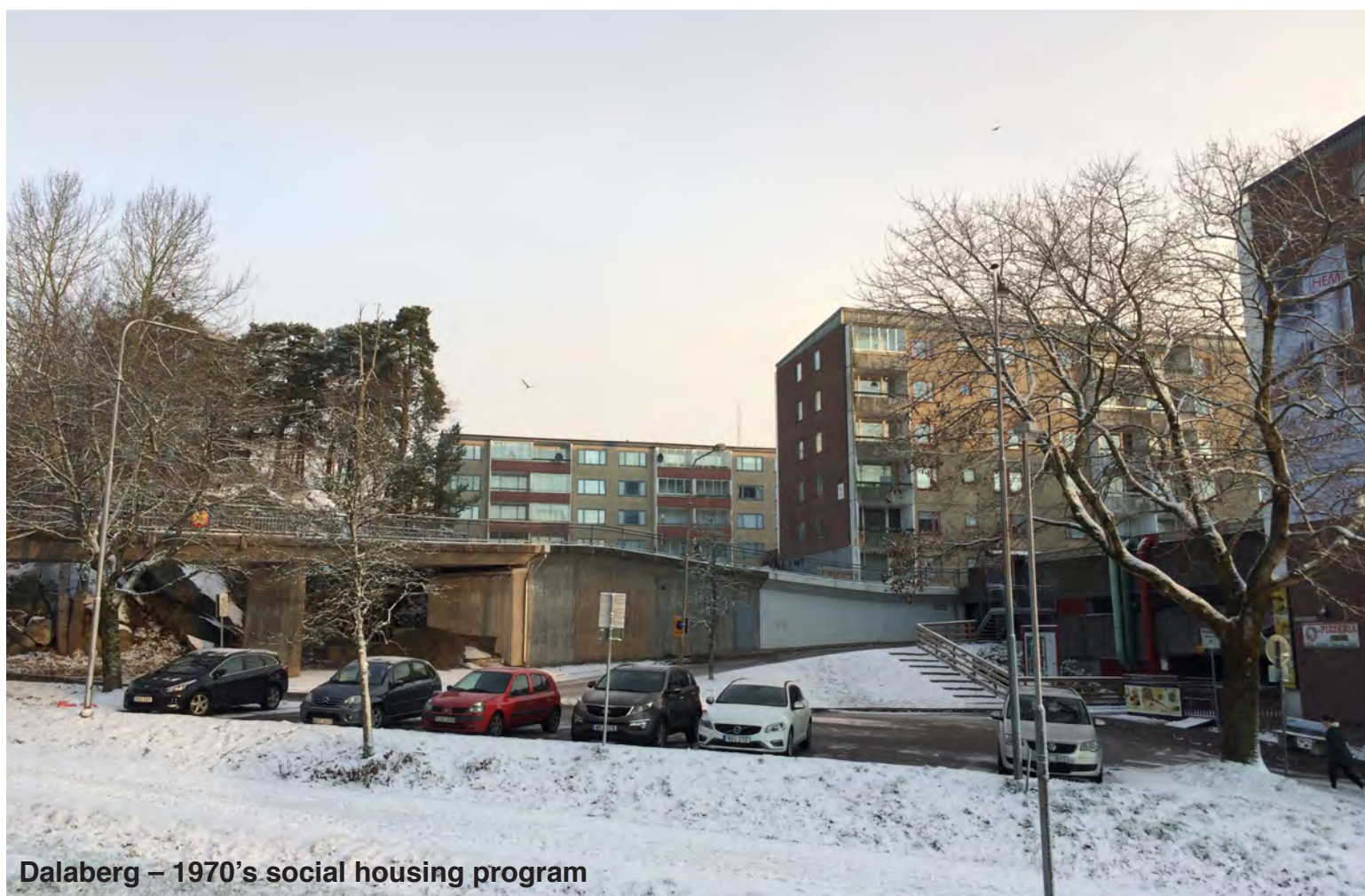
Dalaberg – 1970's social housing program