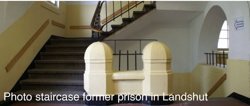
Photo staircase former prison in Landshut