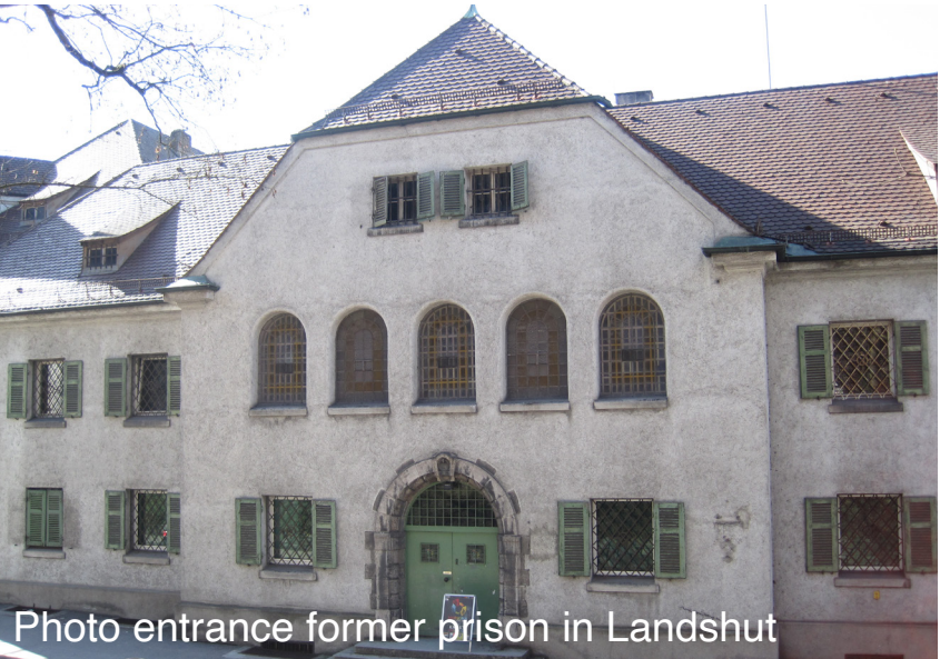
Photo entrance former prison in Landshut

The competition sets out to demonstrate innovative ideas for the future development of the study site (red area) and, in particular, the project site (yellow area). This corresponds to the scale levels S/M and L in the European Europa statutes.