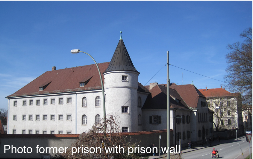
Photo former prison with prison wall