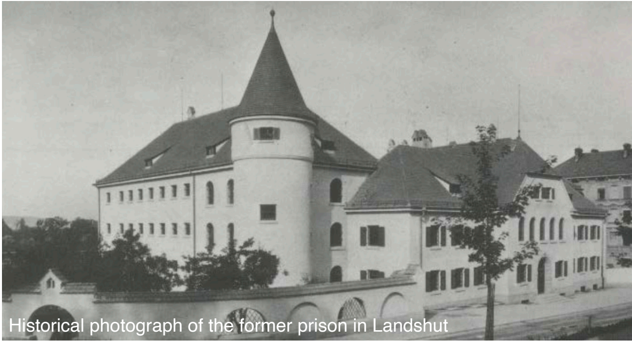
Historical photograph of the former prison in Landshut