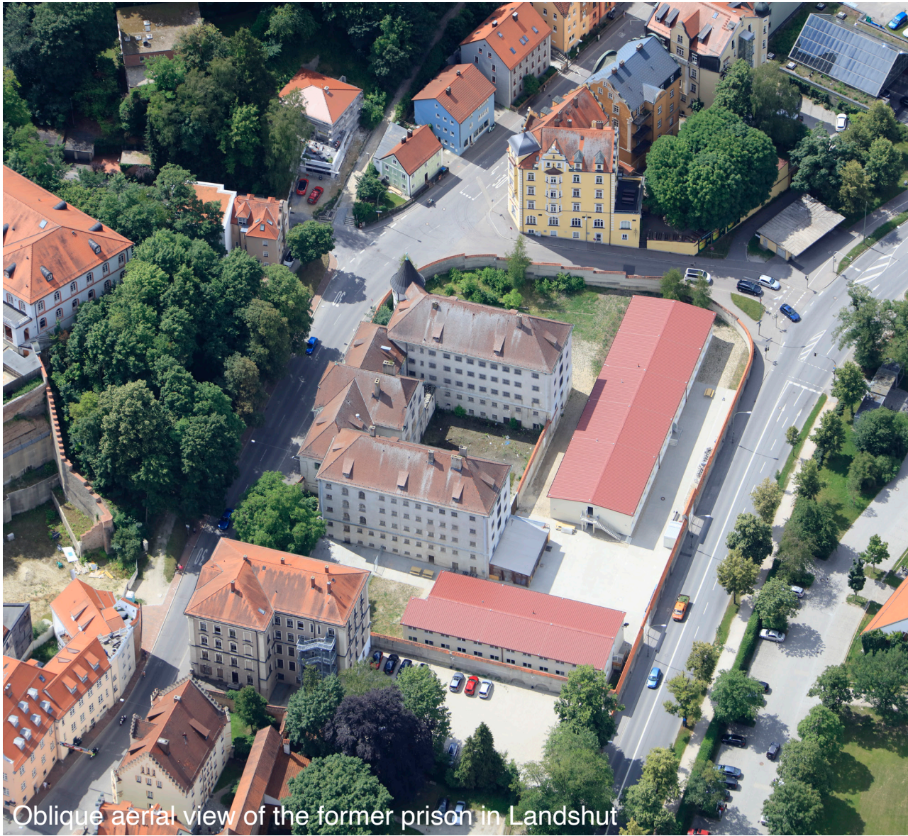
Oblique aerial view of the former prison in Landshut