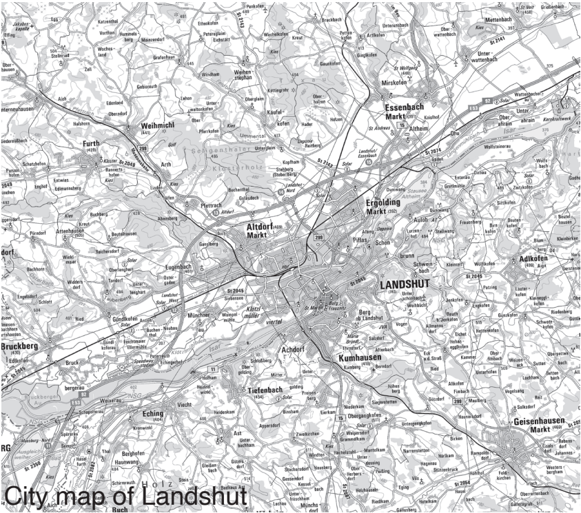
City map of Landshut

SCALE: S, M and L, architectural and urban scale TEAM REPRESENTATIVE: Architect, landscape planner LOCATION: Town of Landshut, Baden-Württemberg POPULATION: ~ 72,700 inhab. STUDY SITE: 16 ha PROJECT SITE: 1 ha SITE PROPOSED BY: Landshut ACTORS INVOLVED: Landshut, Free State of Bavaria OWNER(S) OF THE SITE: Landshut, Free State of Bavaria COMMISSION AFTER COMPETITION: Supplementary studies in cooperation with the town of Landshut