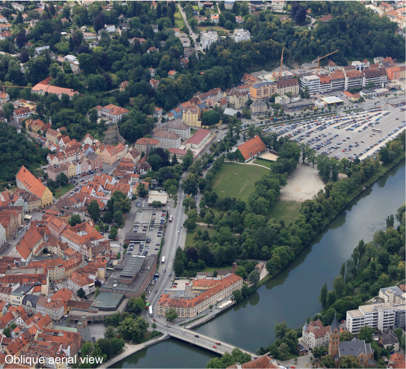
Oblique aerial view

The subject of the competition is the site of the former Landshut correctional facility on the edge of central Landshut. The prison was built in 1905–07 as a modern, medium-sized prison with space for 180 prisoners, and the complex has been a listed building since 2012. It stands on the main development axis leading to Landshut's historic town centre from the south, and work on the project should take this context into account. However, the project site needs to be approached with an open mind. All uses are conceivable. Since ceasing operation in 2008, the existing building has only been used temporarily, and has been completely empty for several years. The aim of the competition is to transform the building and the site, to open it up and integrate it into the city, to design a process for this transformation, and to define new programs. What are needed are innovative ideas on how to deal with the old building. The study site includes the Isarpromenade, the directly adjoining Grieserwiese, the park and a large event lawn, the access area to the historic town centre and the upper part of the town (Dreifaltigkeitsplatz), and Trausnitz Castle.