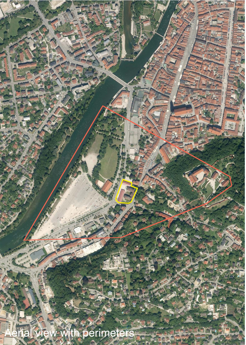
Aerial view with perimeters