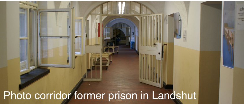
Photo corridor former prison in Landshut