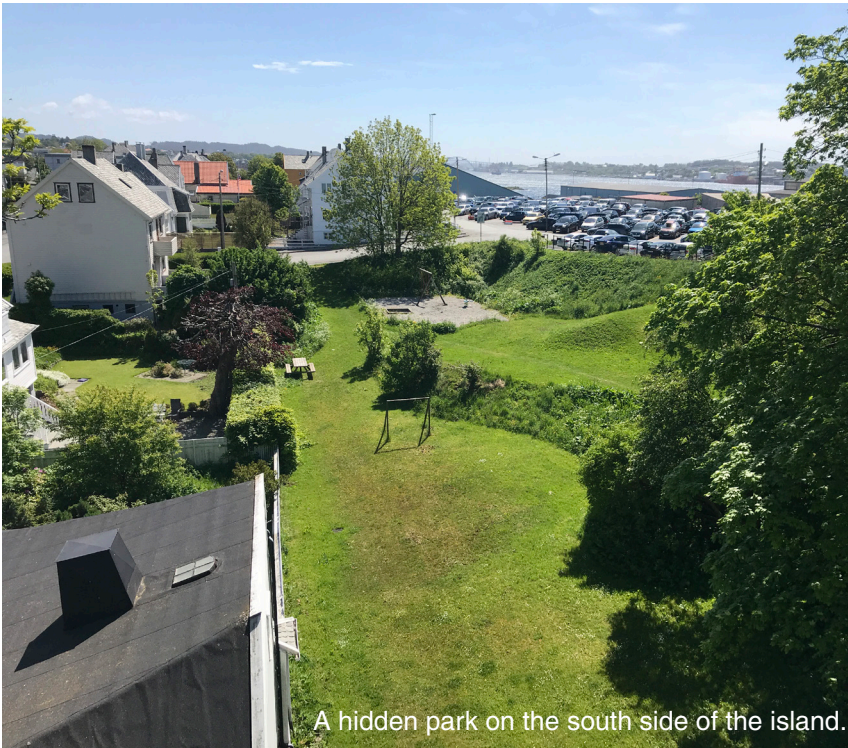
A hidden park on the south side of the island.