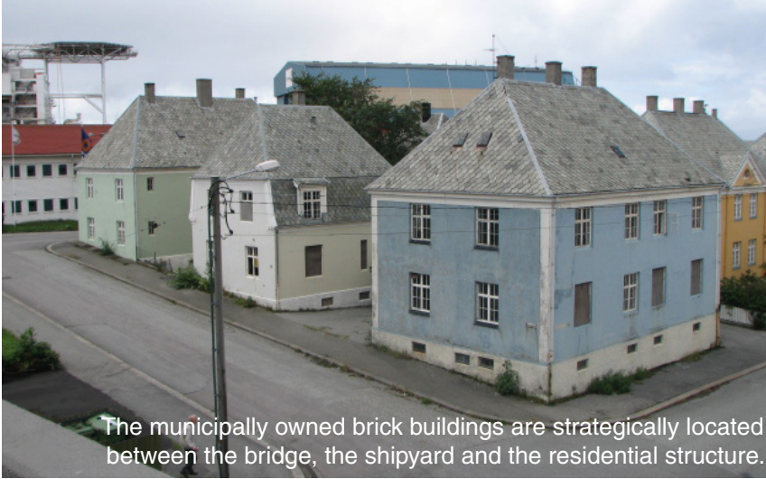
The municipally owned brick buildings are strategically located between the bridge, the shipyard and the residential structure.