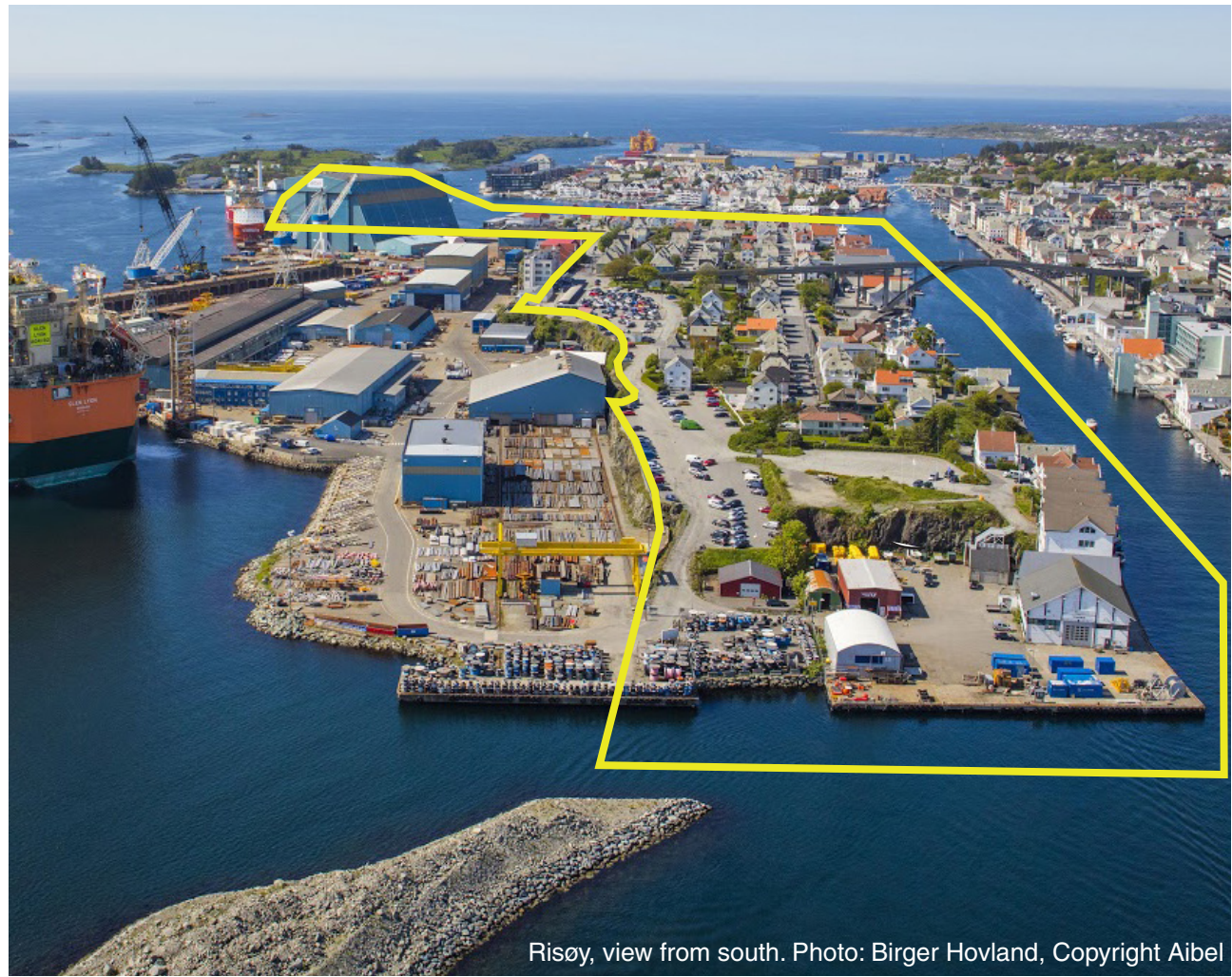
Risøy, view from south.