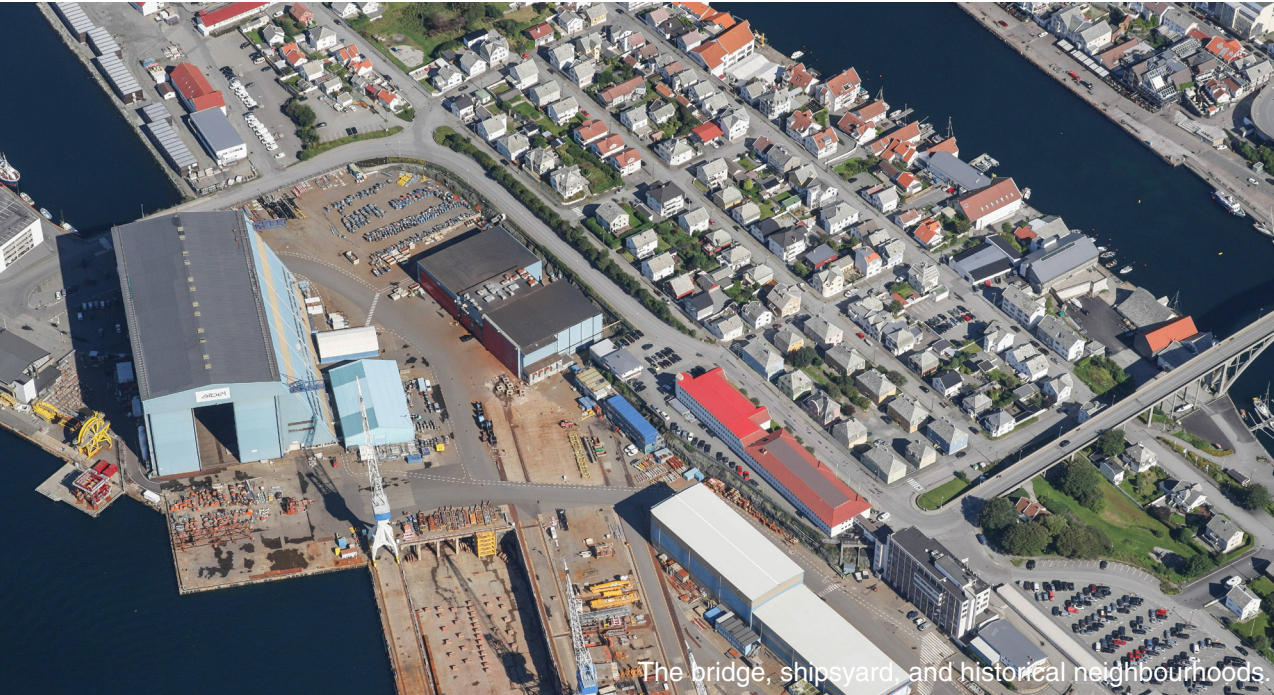
The bridge, shipyard, and historical neighbourhoods.